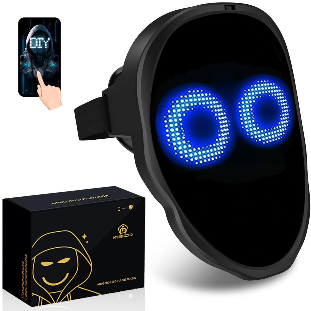
The MEGOO LED Mask, shown with its packaging and a smartphone displaying the control app.