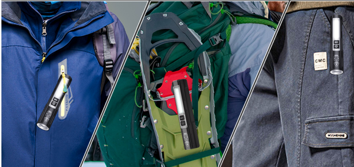
Image: The flashlight's integrated metal clip allows for easy and secure attachment to pockets, belts, or backpacks, preventing loss and ensuring accessibility.

The metal clip makes it easy to carry the flashlight in your pocket or backpack to prevent it from being lost and dropped.