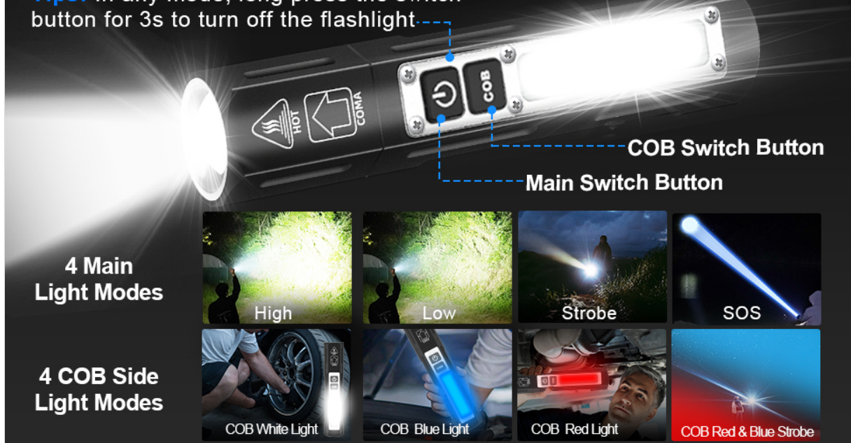
4 Main Light Modes

Tips: In any mode, long press the switch button for 3s to turn off the flashlight.