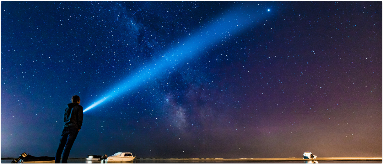
Image: The Banral K-2309C flashlight showcasing its super bright and long-range main beam, capable of illuminating distant objects.