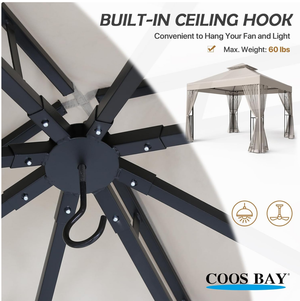
Image 5.1: The built-in ceiling hook, designed for hanging lights or a fan, with a maximum weight capacity of 60 lbs.