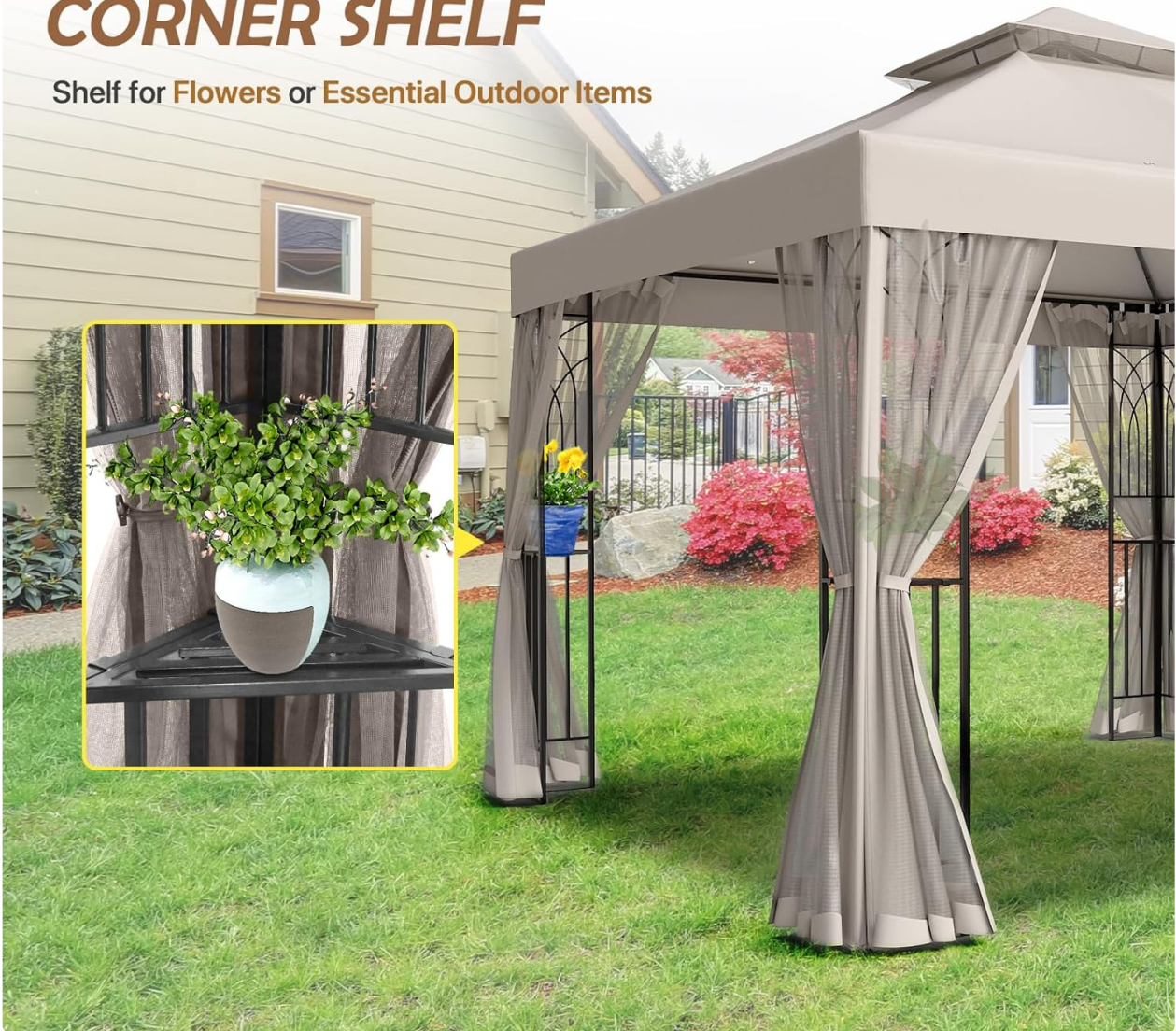
Image 4.4: A close-up view of one of the functional corner shelves, ideal for holding plants or other small items.

Shelf for Flowers or Essential Outdoor Items