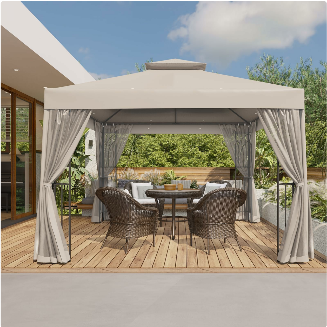
Image 1.1: The COOS BAY 10x10 Outdoor Patio Gazebo with Netting, showcasing its overall structure and design in an outdoor setting.