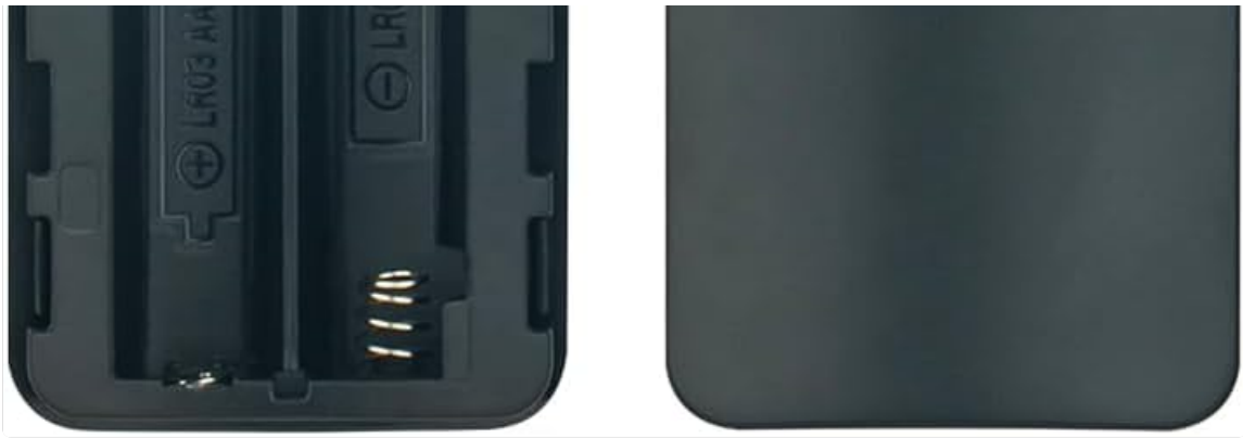
Figure 2: Battery compartment of the remote control, illustrating correct battery insertion.