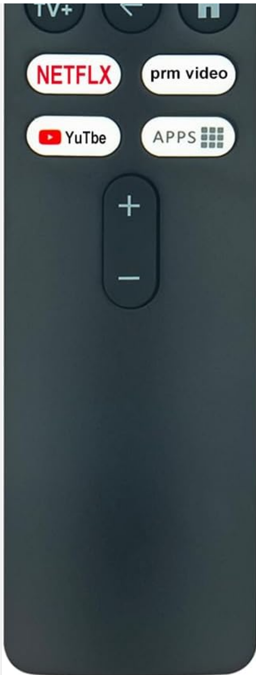
Figure 3: Remote control with an emphasis on the voice command button.