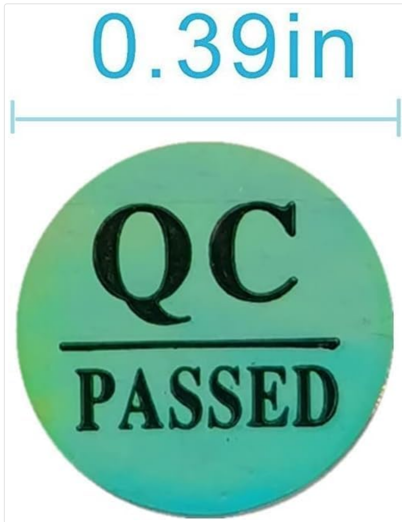
Image 2: A close-up view of a single QC Passed sticker, highlighting its 0.39-inch diameter.