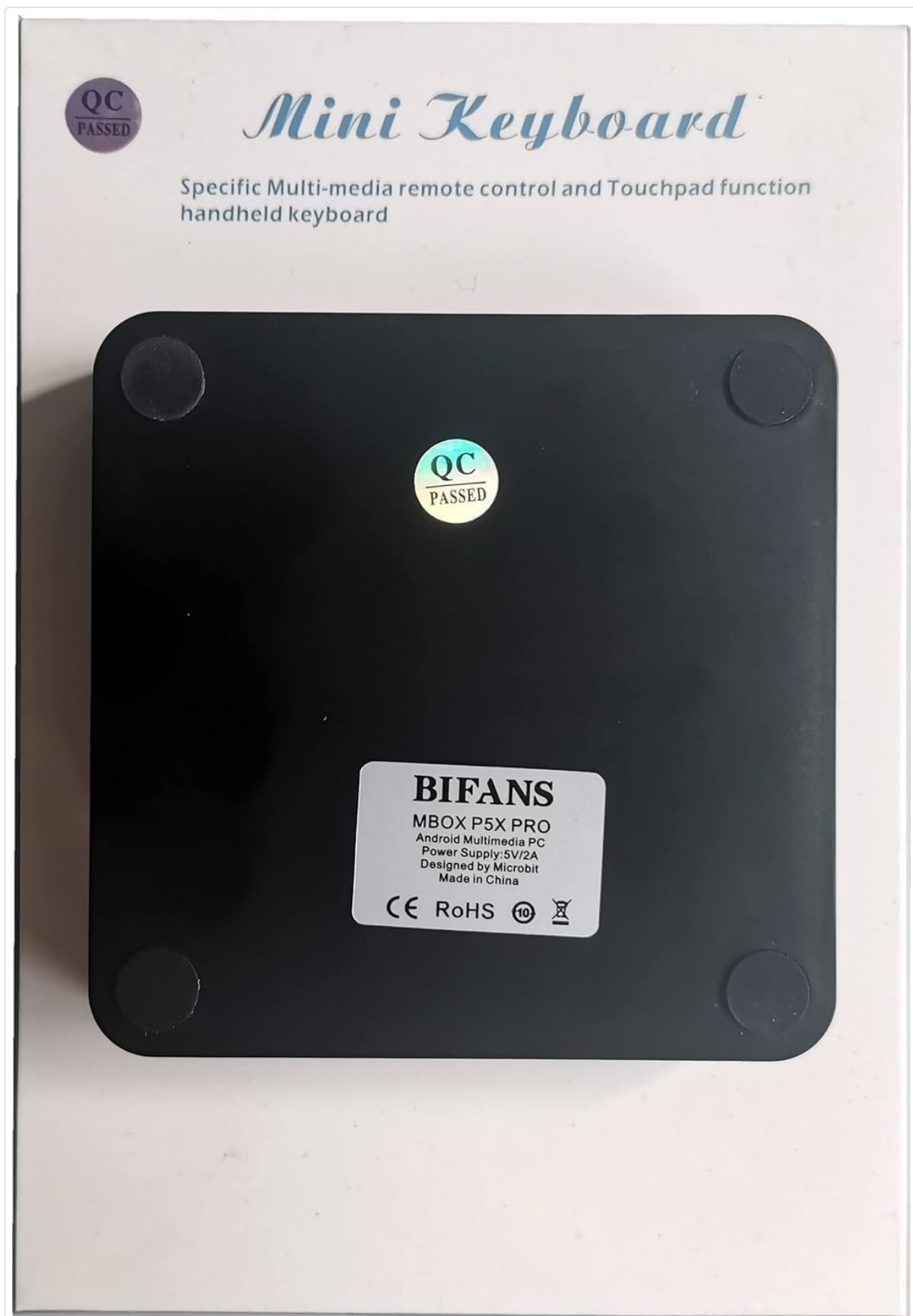
Image 3: An example of a QC Passed sticker applied to a product, demonstrating its intended use for quality assurance.