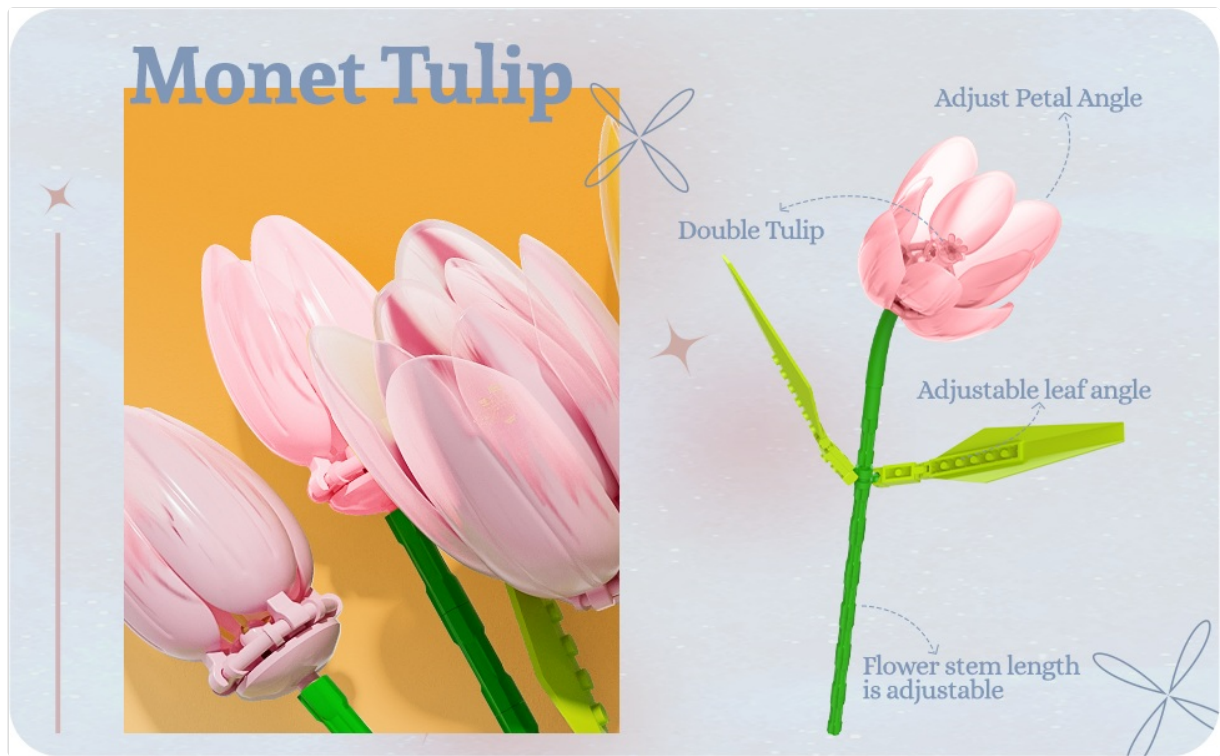
Image: Detailed view of a tulip showing points of adjustment for petals, leaves, and stem length.

Your browser does not support the video tag.