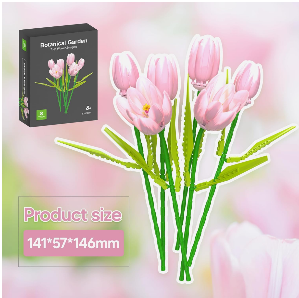
Image: The product box and the assembled tulip bouquet, illustrating the contents.