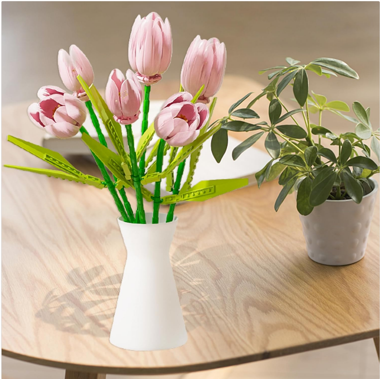
Image: The assembled tulip bouquet displayed in a white vase, showcasing its decorative potential.