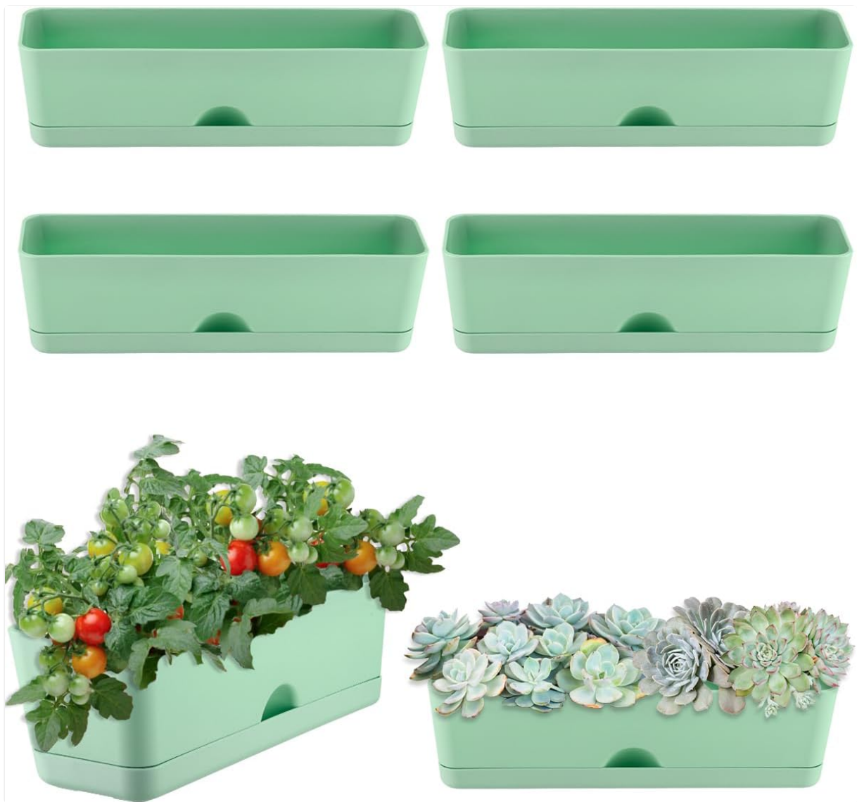
Image: A set of KvyusFlourish rectangle planters, showcasing their design and potential for various plants.