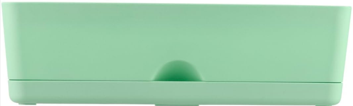
Image: Detailed view of the planter's base, illustrating the mesh drainage and aeration features.