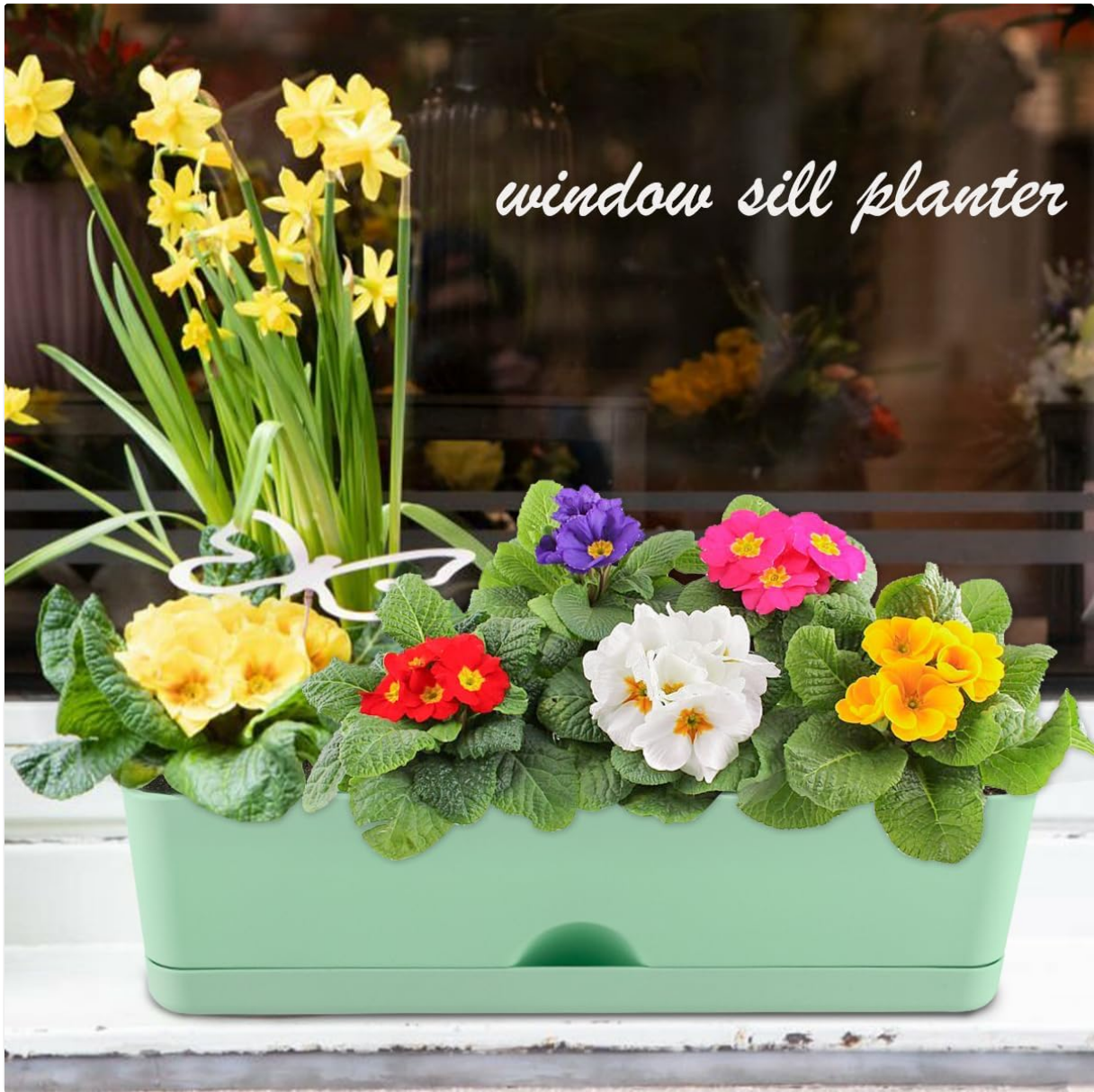
Image: A KvyusFlourish planter showcasing vibrant flowers, demonstrating its use as a window sill planter.