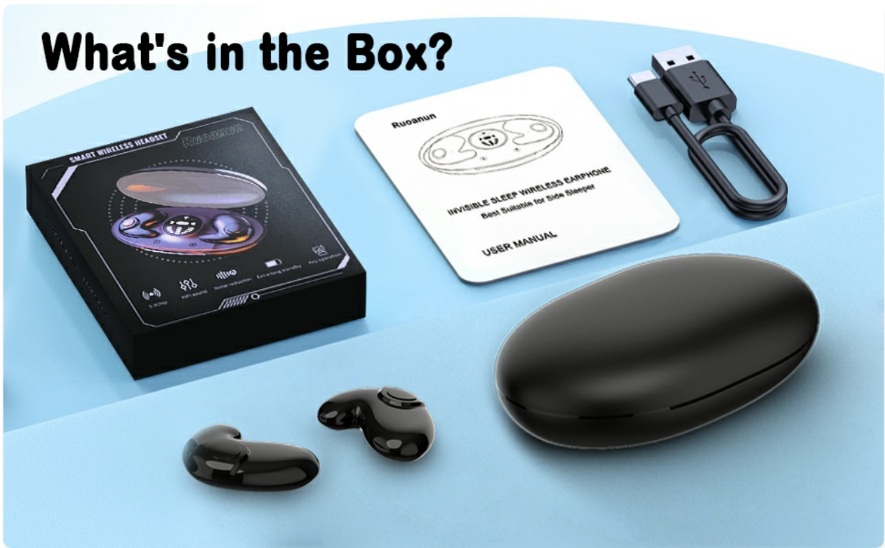
Image: The package contents, showing the earphones, charging case, USB-C cable, and user manual.