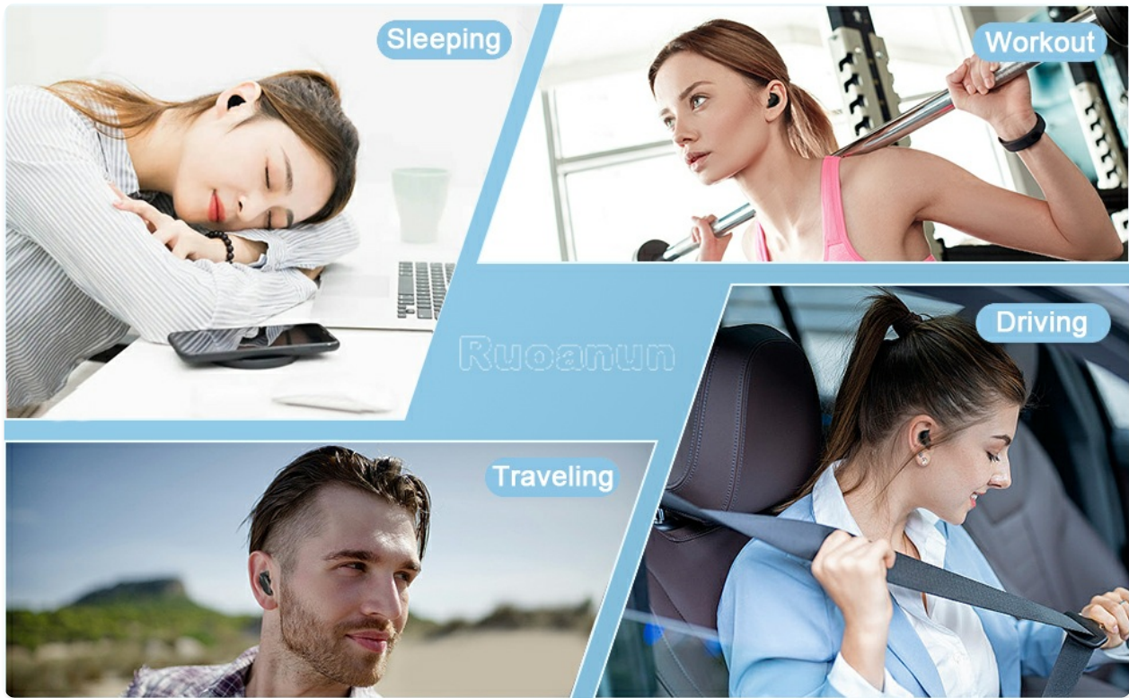
Image: Various usage scenarios for the earphones, including sleeping, working out, driving, and traveling.