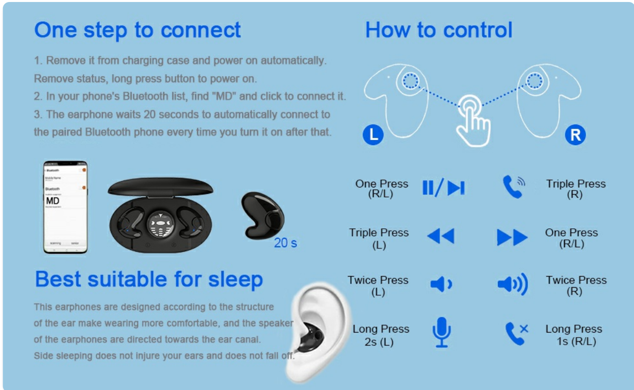
Image: Instructions for one-step auto pairing and a visual guide to earphone controls.