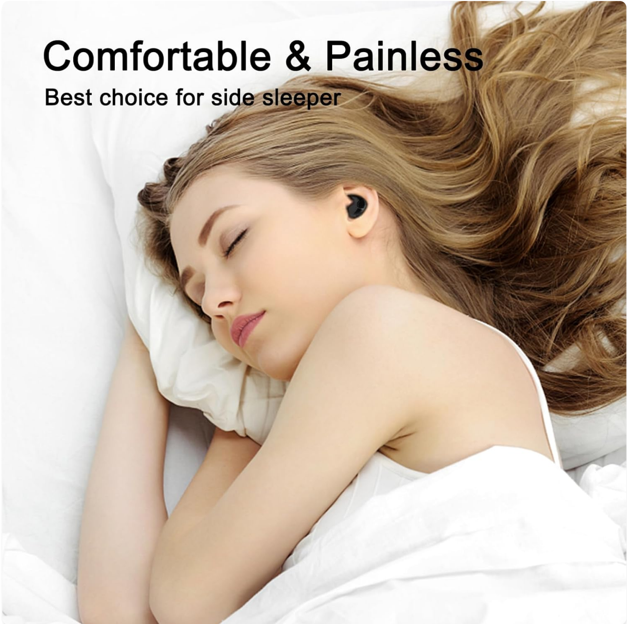
Image: A woman sleeping comfortably on her side while wearing the earphones.

Each earphone weighs approximately 3.2 grams and has a thickness of only 10.6mm, making them barely noticeable during extended wear.