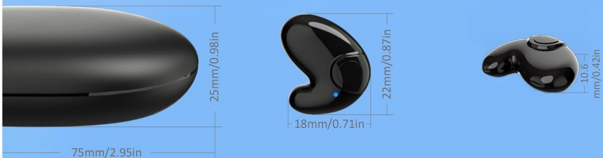
Image: Detailed dimensions highlighting the earphones' lightweight and thin profile.