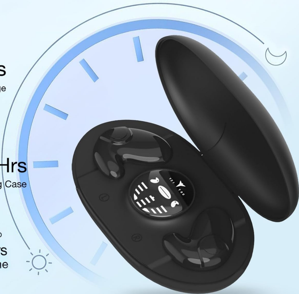
Image: Battery life indicators for single charge and total with charging case.