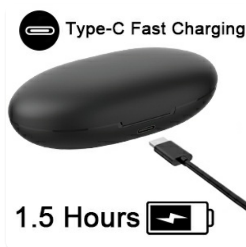
Image: The Type-C fast charging port on the earphone case.