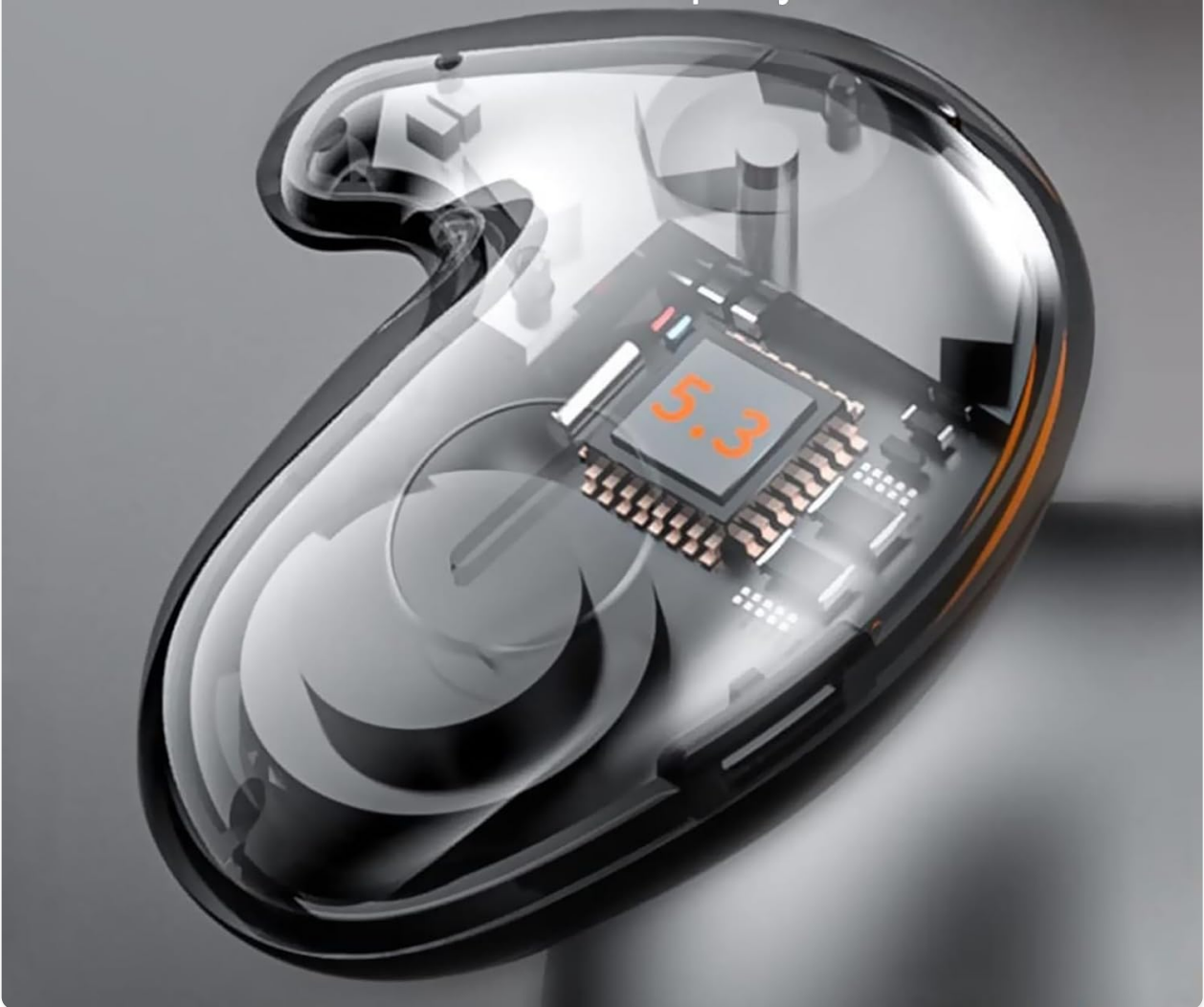
Image: The Bluetooth 5.3 chipset, highlighting advanced connectivity.

Faster connection & Better sound quality