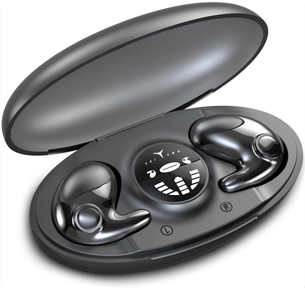
Image: Rehoria Invisible Sleep Wireless Earphones in their charging case.