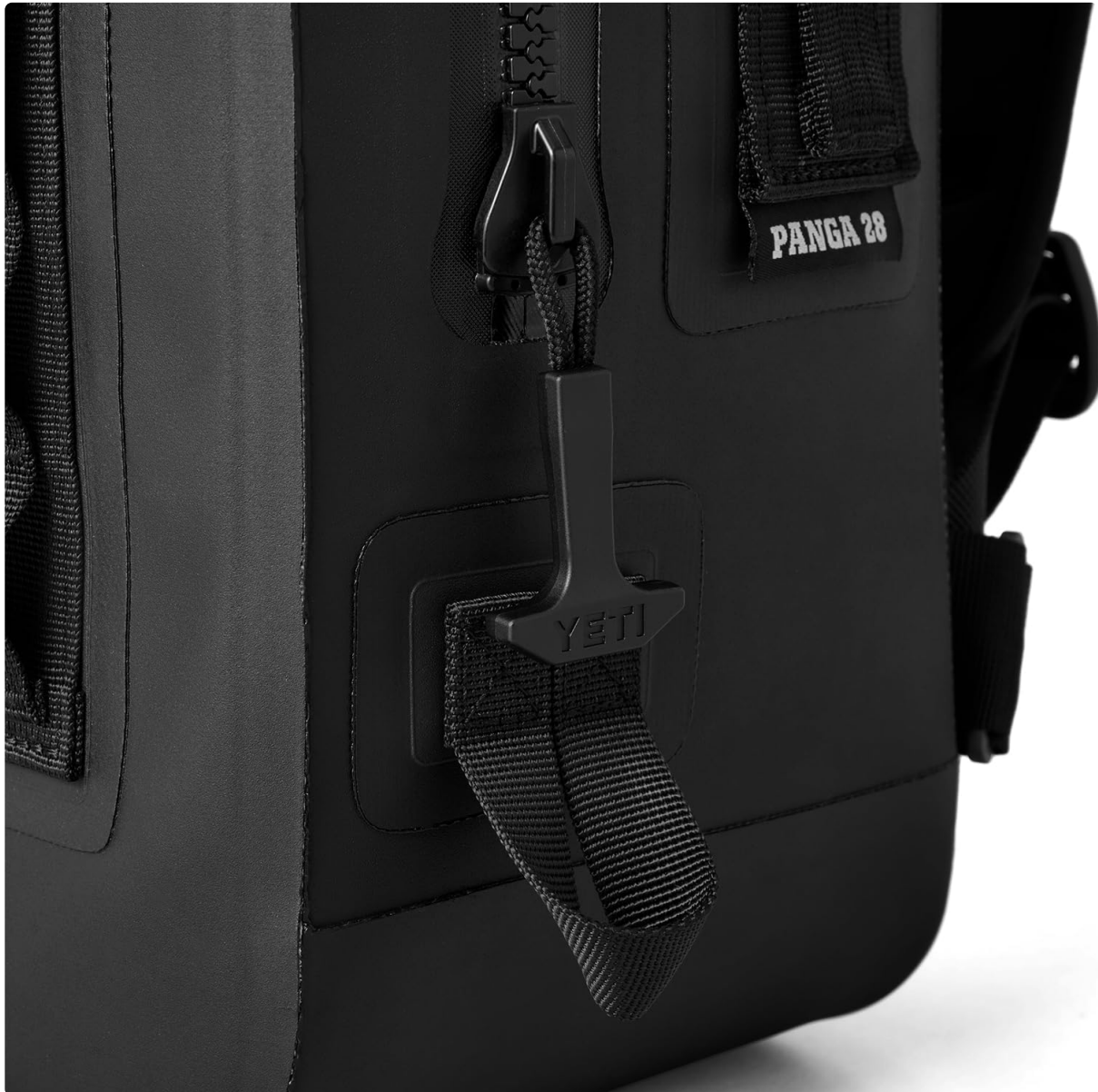
Figure 5: Close-up view of the robust HydroLok Zipper, essential for the backpack's waterproof integrity.