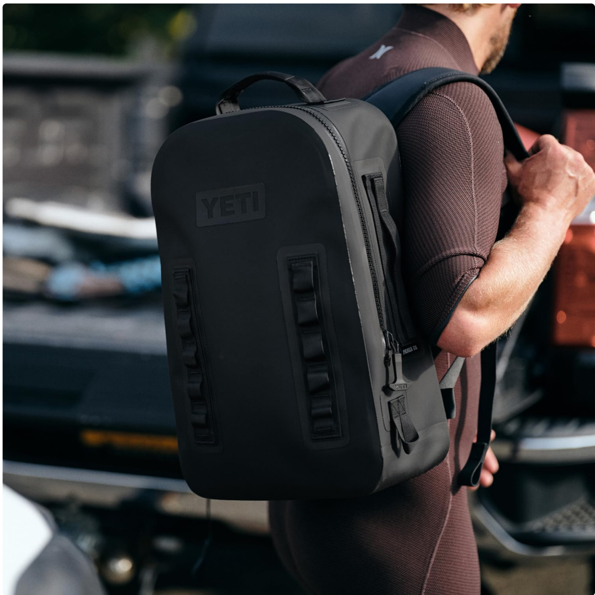
Figure 7: The Panga 28 Backpack being worn, demonstrating its practical use in an outdoor environment.