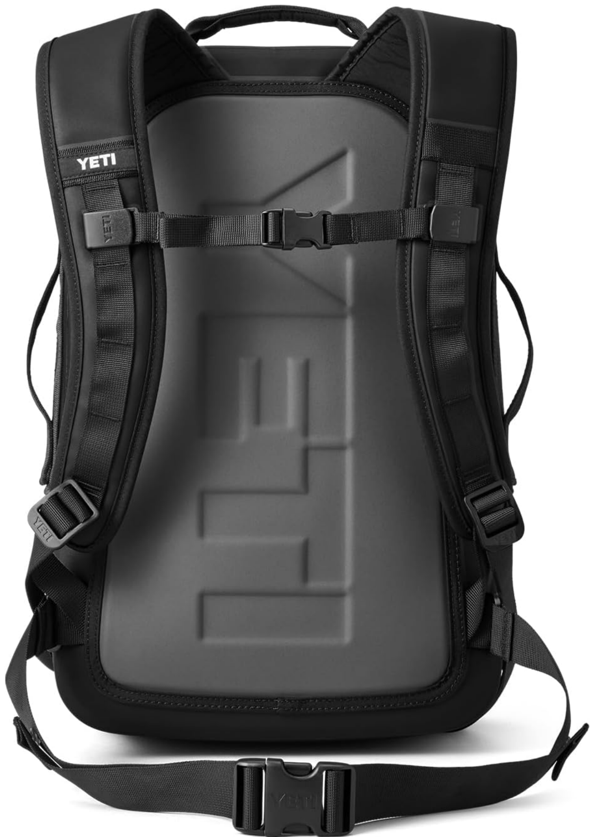
Figure 4: Rear view of the backpack, illustrating the ergonomic shoulder straps and attachment points for the chest and waist straps.