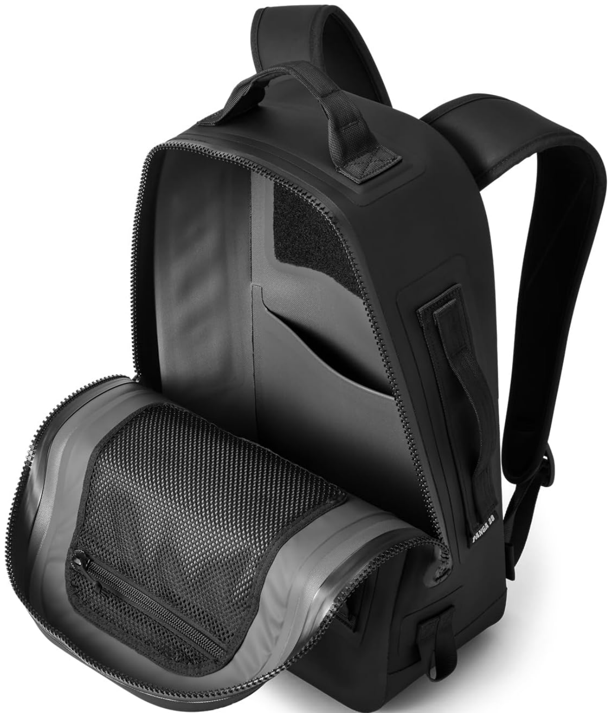
Figure 6: Interior view of the Panga 28, highlighting the mesh pocket and internal organization features.