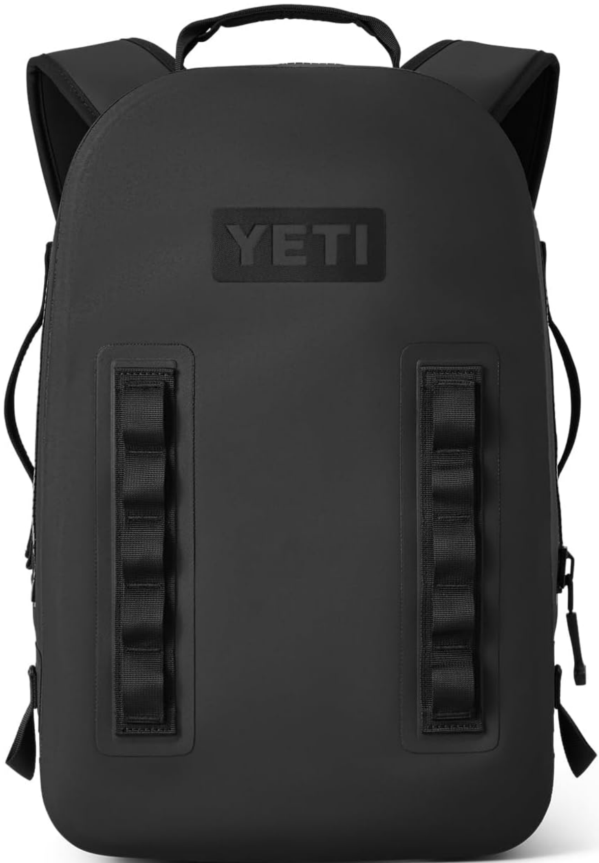
Figure 1: Front view of the YETI Panga 28 Backpack, showcasing its sleek black design and durable exterior.