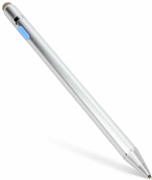
Image 1.1: The BoxWave AccuPoint Active Stylus in Metallic Silver.