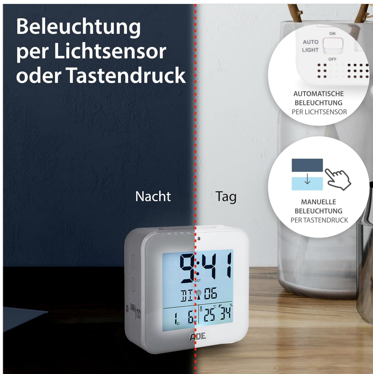
Image 6.2: Backlight can be activated manually or automatically via the light sensor.