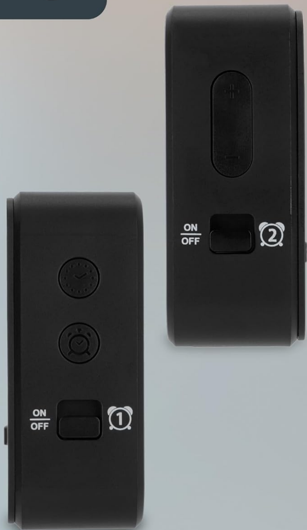
Image: Side view of the ADE Digital Alarm Clock CK2310-1, highlighting the accessible buttons for intuitive operation and the two alarm ON/OFF switches.