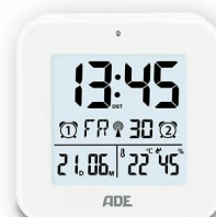
Image: Front view of the ADE Digital Alarm Clock CK2310-1, showing the digital display with time, date, temperature, and humidity.