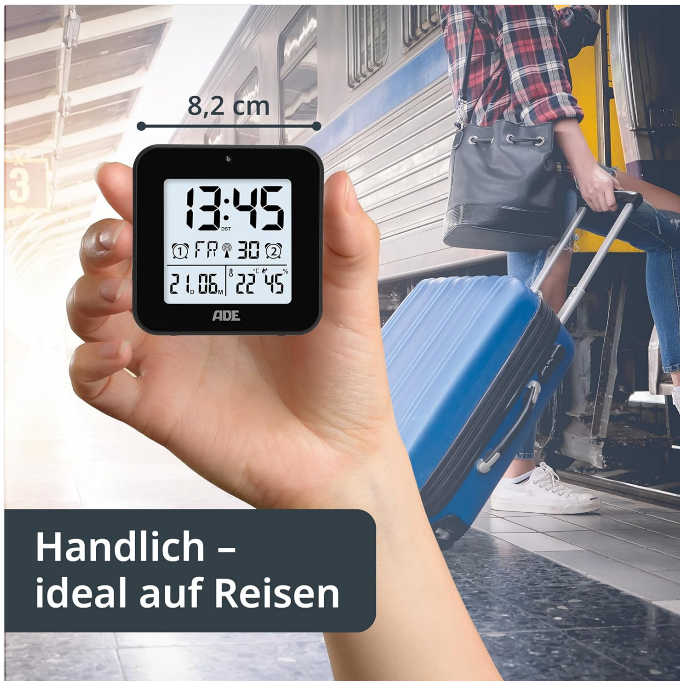
Image: The ADE Digital Alarm Clock CK2310-1 held in a hand, illustrating its compact and portable design, ideal for travel.