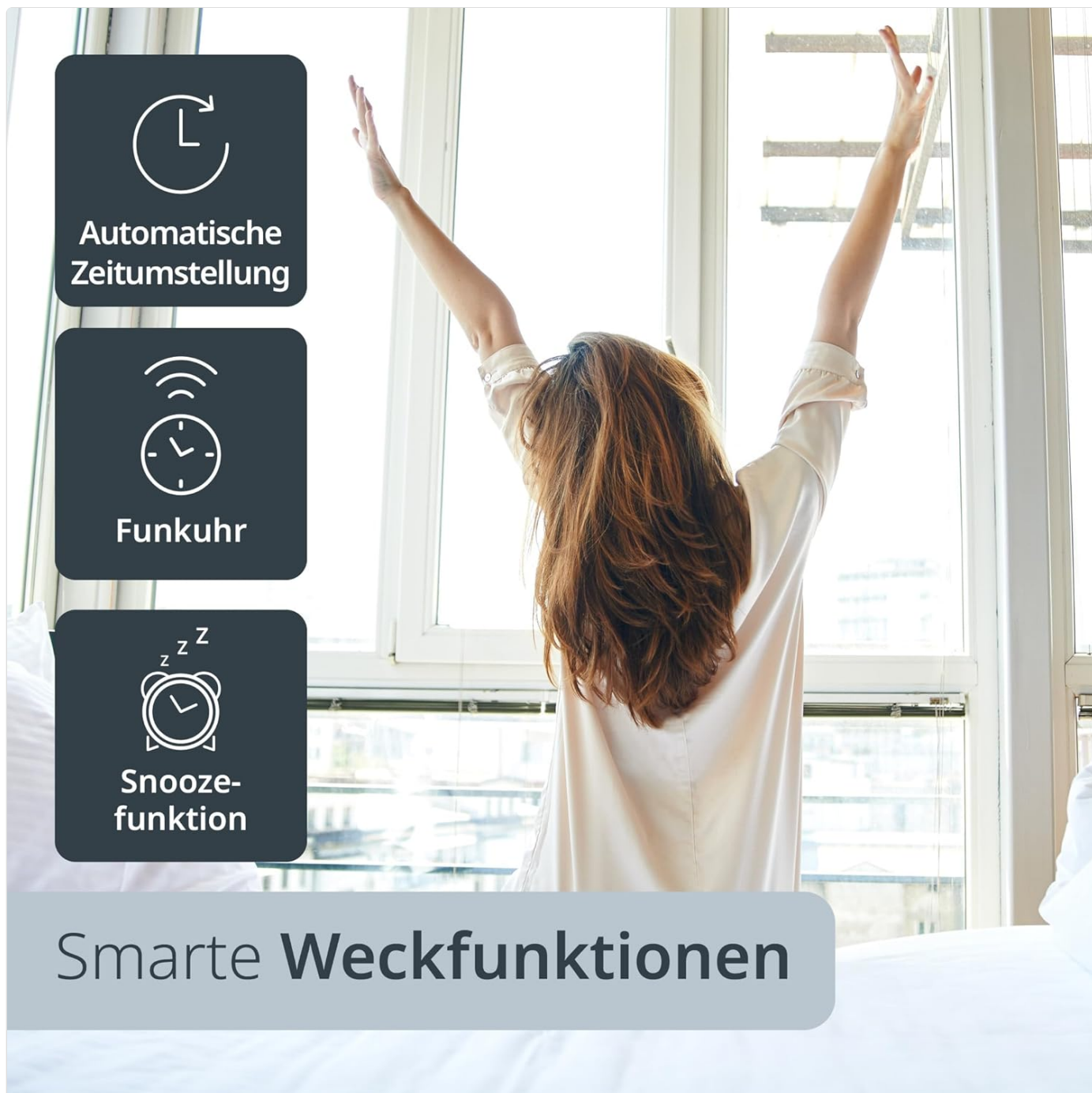
Image: The ADE Digital Alarm Clock CK2310-1 displaying smart alarm features, including automatic time adjustment, radio clock functionality, and snooze function.