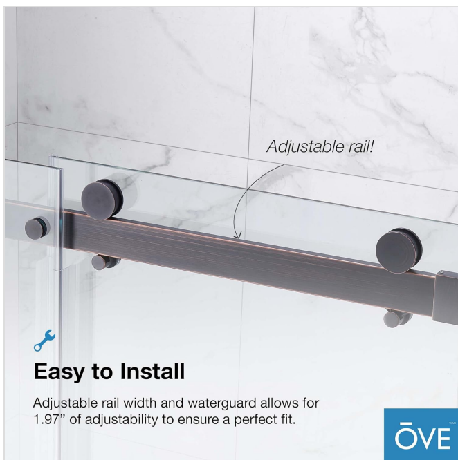
Image: Close-up of the adjustable rail mechanism, indicating how the rail width can be adjusted for a precise fit during installation.