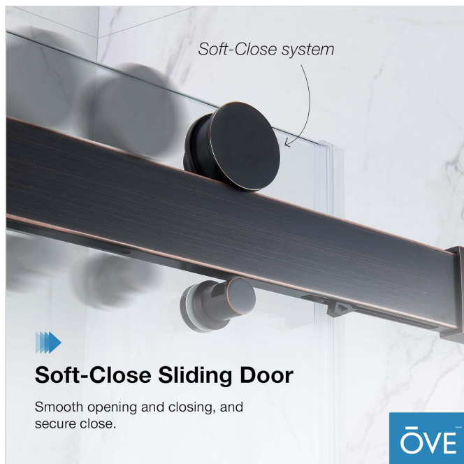
Image: Close-up view of the soft-close system on the shower door's top rail, highlighting the smooth operation mechanism.