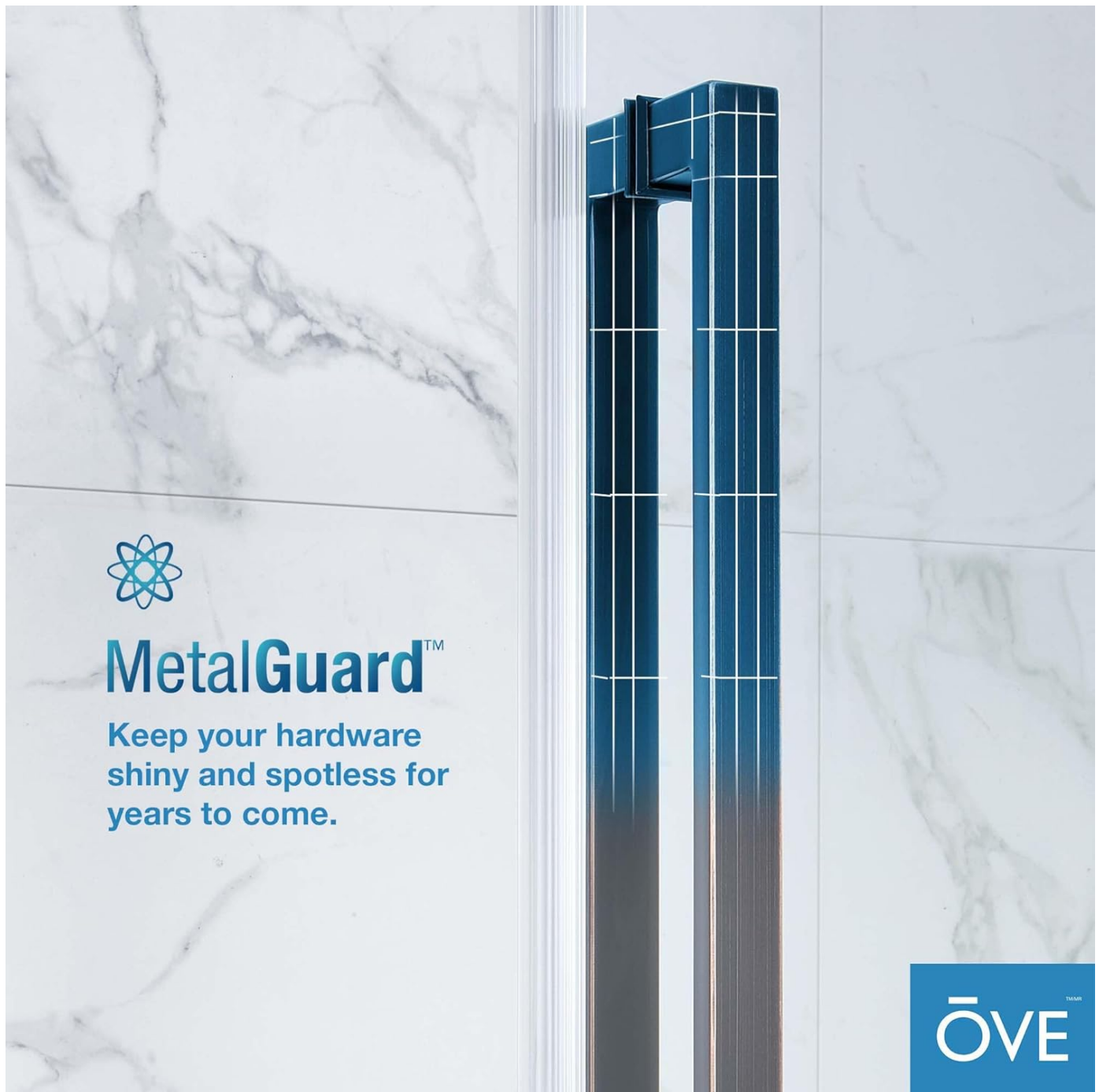
Image: Graphic highlighting the "MetalGuard" feature, indicating enhanced protection for the hardware finish against tarnishing and wear.