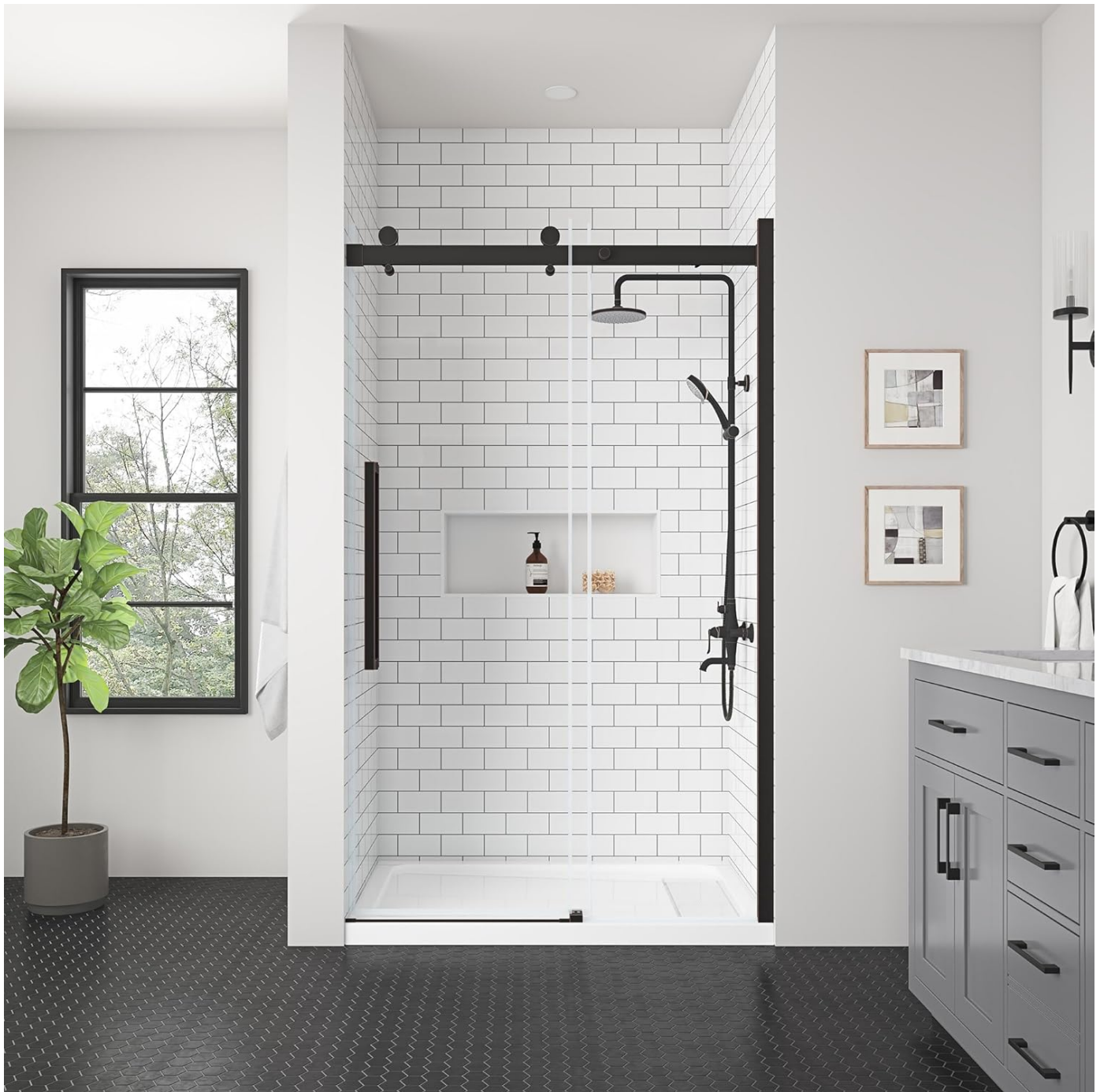
Image: The OVE Decors Bel Frameless Sliding Shower Door installed in a modern bathroom, showcasing its clear glass panels and oil-rubbed bronze hardware.