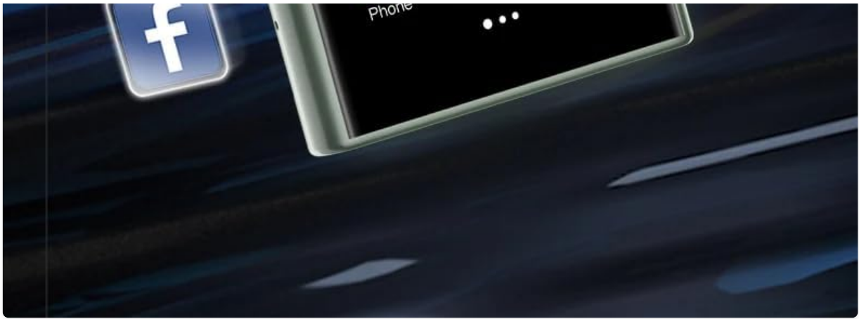
Figure 5: Detailed view of the S23 Pro Mini Smartphone's camera features.