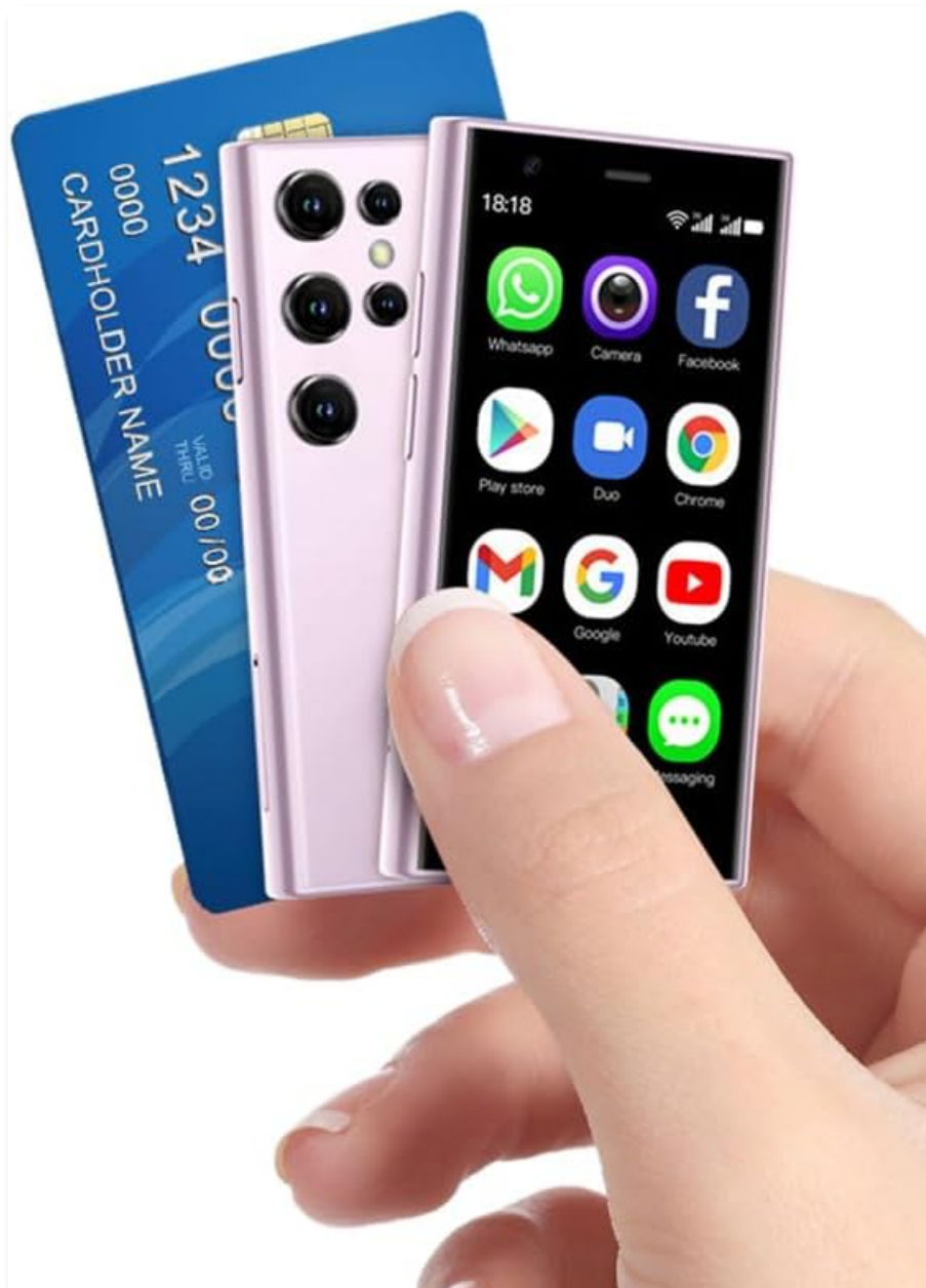
Figure 6: The compact size of the S23 Pro Mini Smartphone.

Enjoy multimedia content on the 3.0-inch HD display. The phone is suitable for watching videos and listening to music. You can also use the S23 Pro as a mobile hotspot to share its internet connection with other devices, enabling you to work or stay connected anywhere.