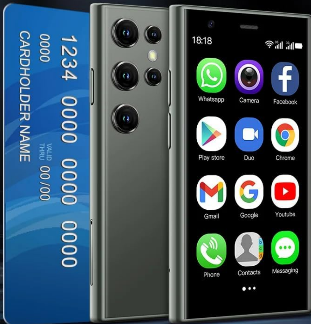
Figure 3: S23 Pro Mini Smartphone home screen with app icons.

Fashionable and minimalist, with one hand flexible control, comfortable grip, and a bank card like compact and stunning design, the small size does not take up any space, making people love it.