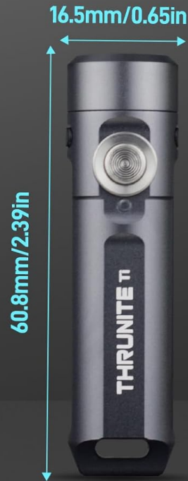
Image 5: The ThruNite Ti flashlight with its compact dimensions (60.8mm length, 26.5g weight) highlighted.