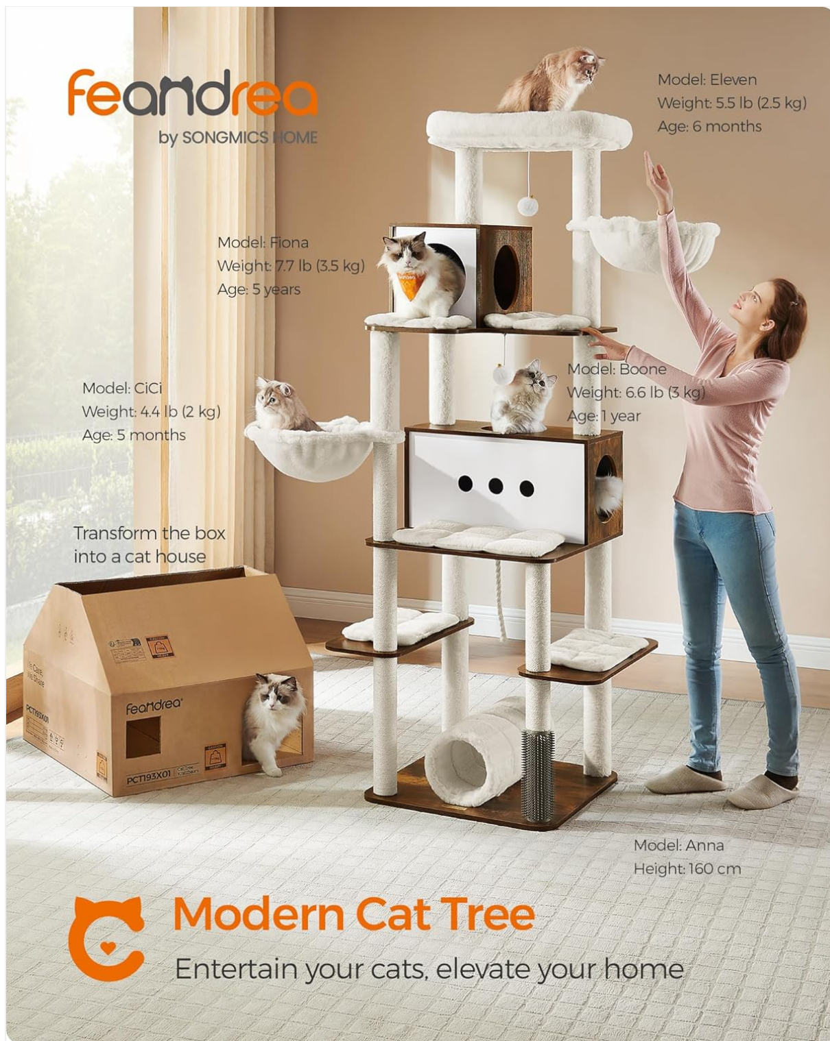
Image 1.1: Overview of the Feandrea Cat Tree UPCT193X01, highlighting its multi-level design and various features for cats.