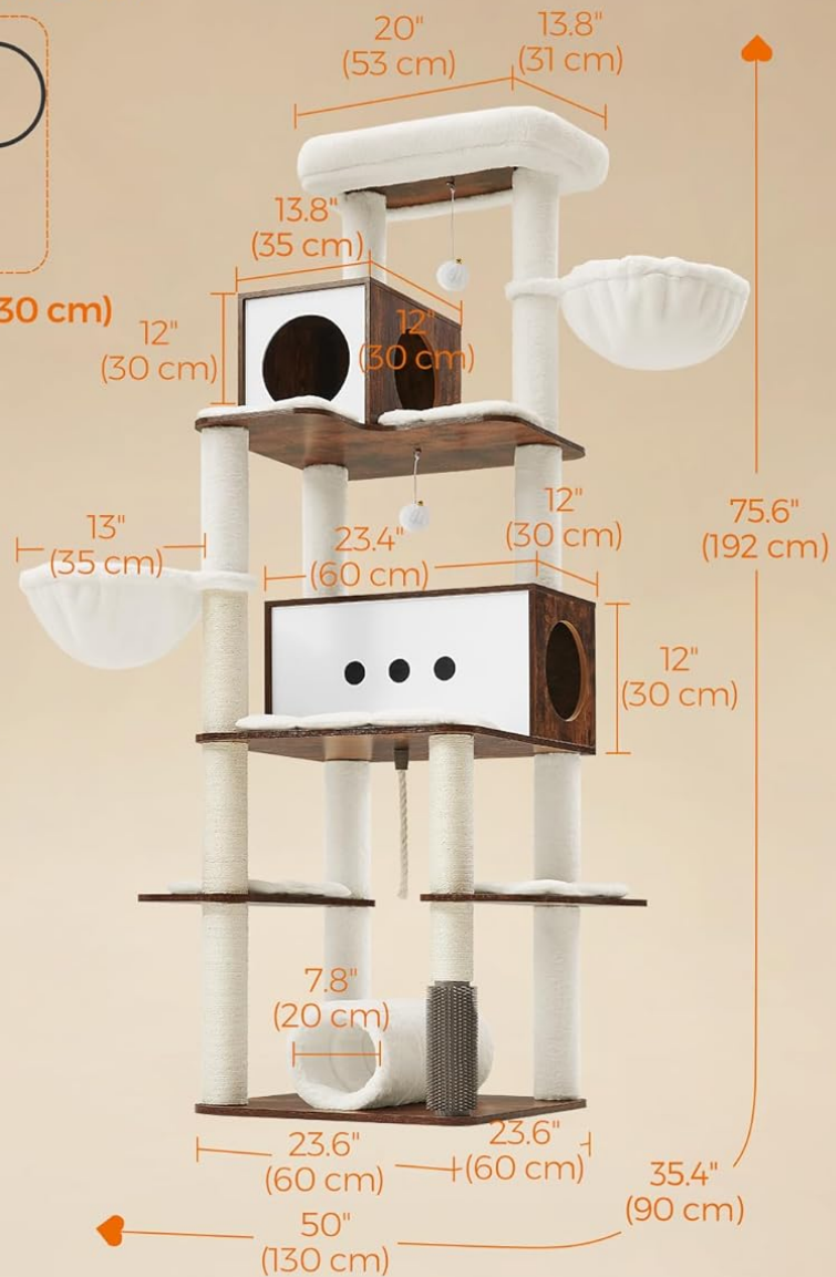
Image 8.1: Detailed dimensions and recommended cat weight/quantity for the cat tree.