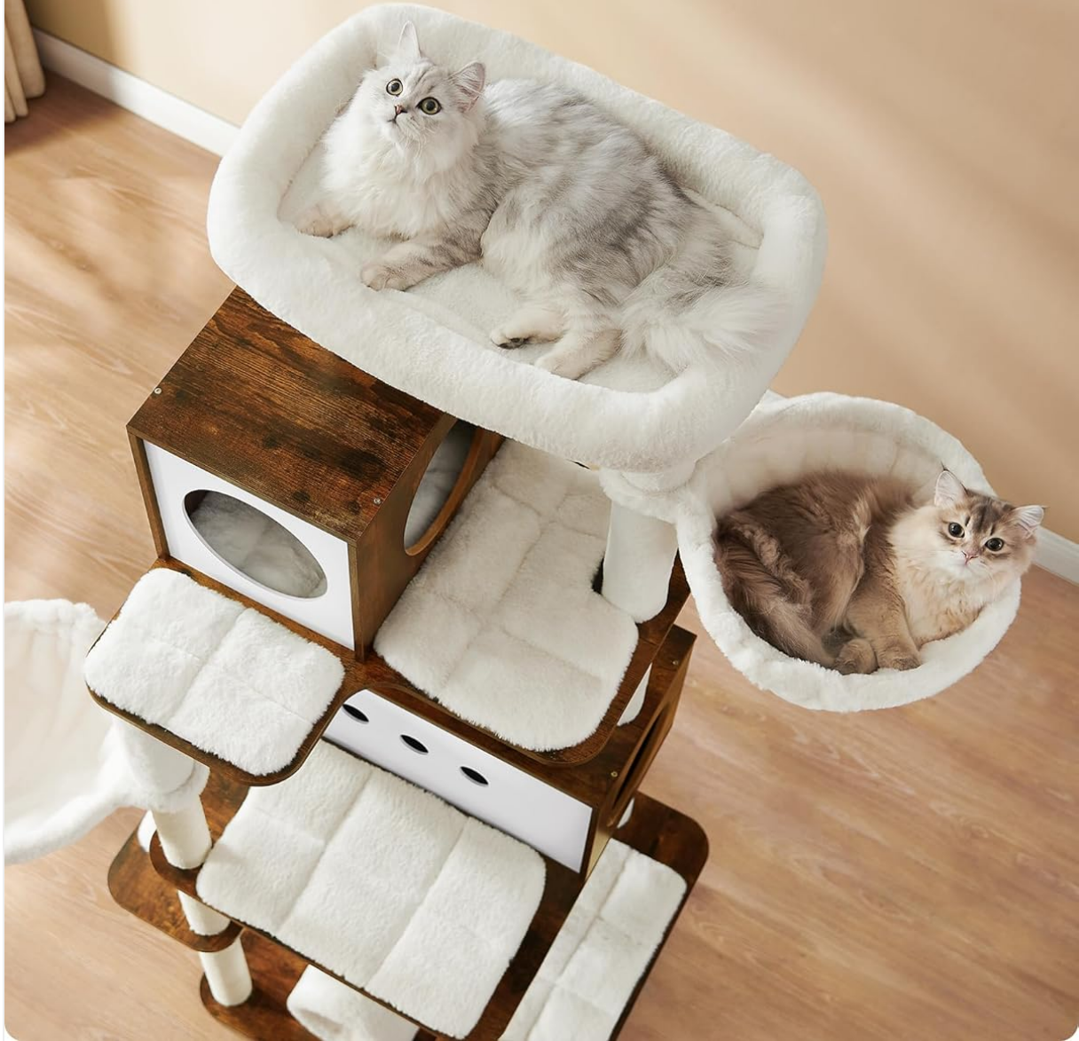
Image 5.3: The luxurious top perch, designed for comfortable observation and rest.

Gives cats cloud-nine comfort to overlook their kingdom