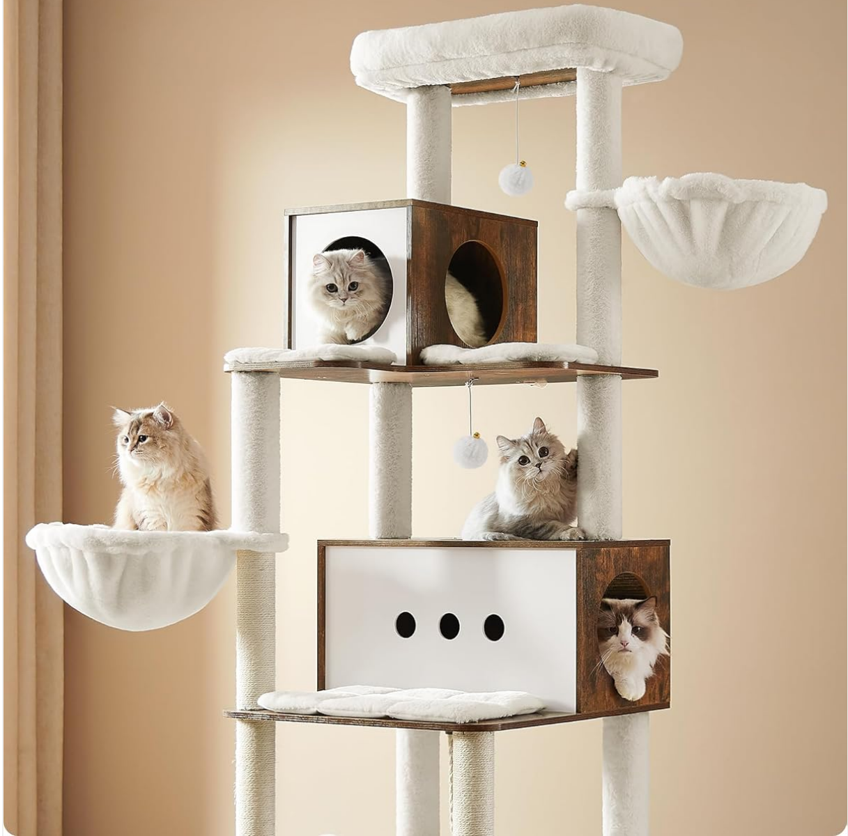
Image 5.2: Detail of the double caves and double baskets, highlighting their plush lining for comfort.