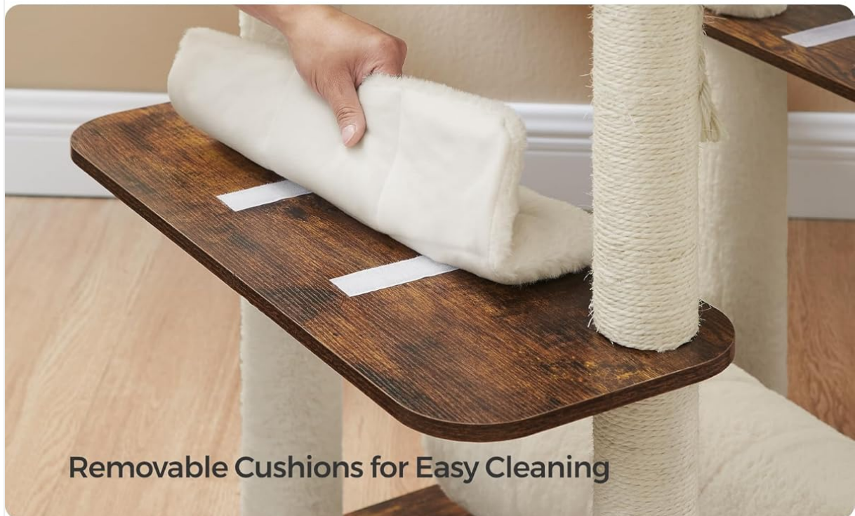
Image 6.1: Detail showing rounded platform corners for safety and the removable cushions for easy cleaning.