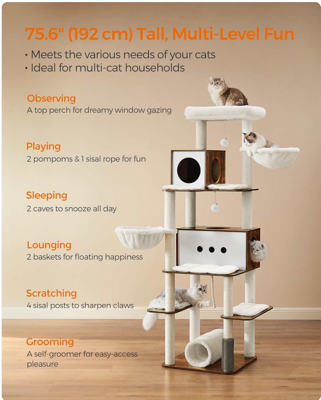
Image 5.1: Multi-level design illustrating different activity zones for observing, playing, sleeping, lounging, scratching, and grooming.