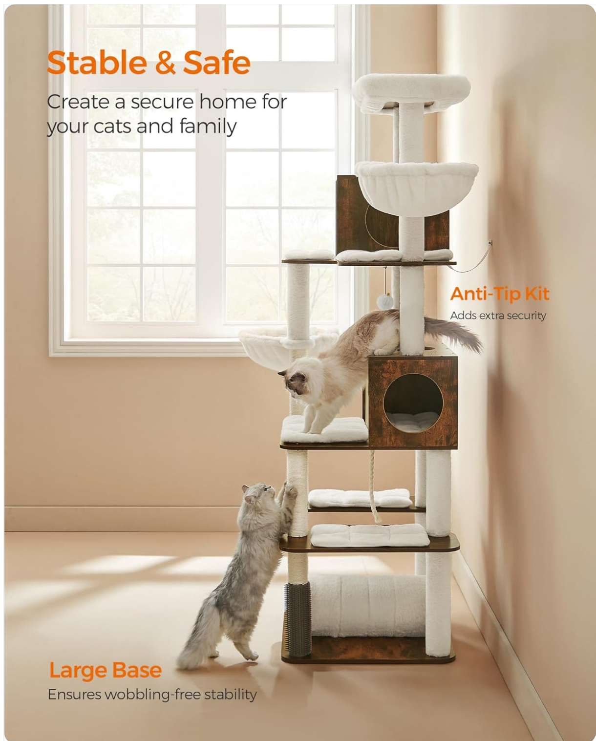
Image 2.1: Illustration of the anti-tip kit installation, emphasizing the importance of securing the cat tree to the wall for enhanced stability.