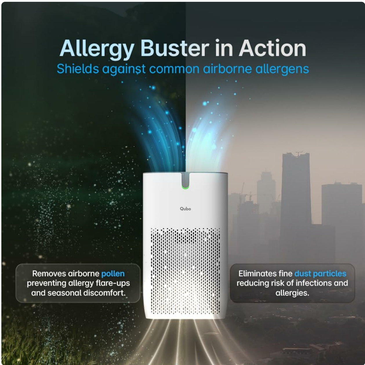
Image: The Qubo Smart Air Purifier Q400, a modern white device designed to blend into home environments.