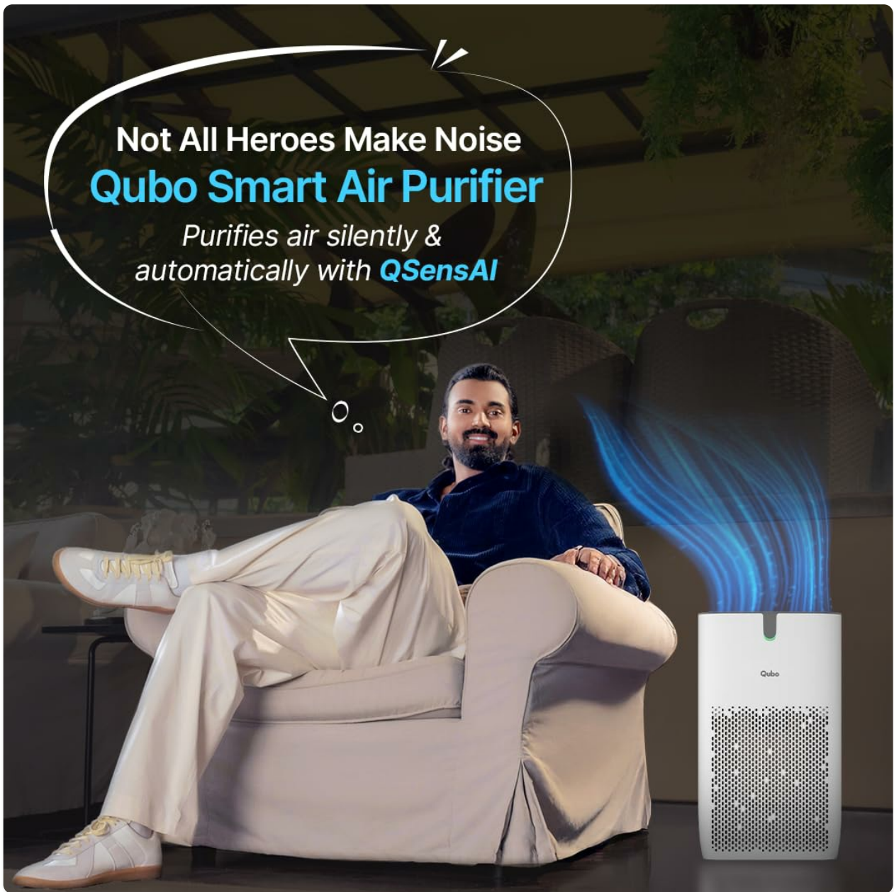
Image: The Qubo Smart Air Purifier Q400 effectively covering a room up to 400 sq. ft., ideal for bedrooms or study rooms.