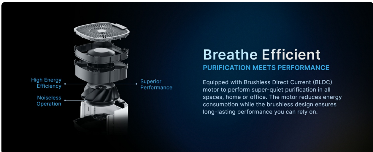
Image: A diagram showing the internal components of the Qubo Smart Air Purifier Q400, highlighting the filter installation process.

Your browser does not support the video tag.