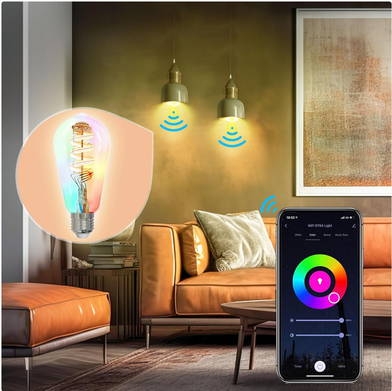
Image: A MOES Smart ST64 Edison LED Light Bulb correctly installed in a pendant light fixture.