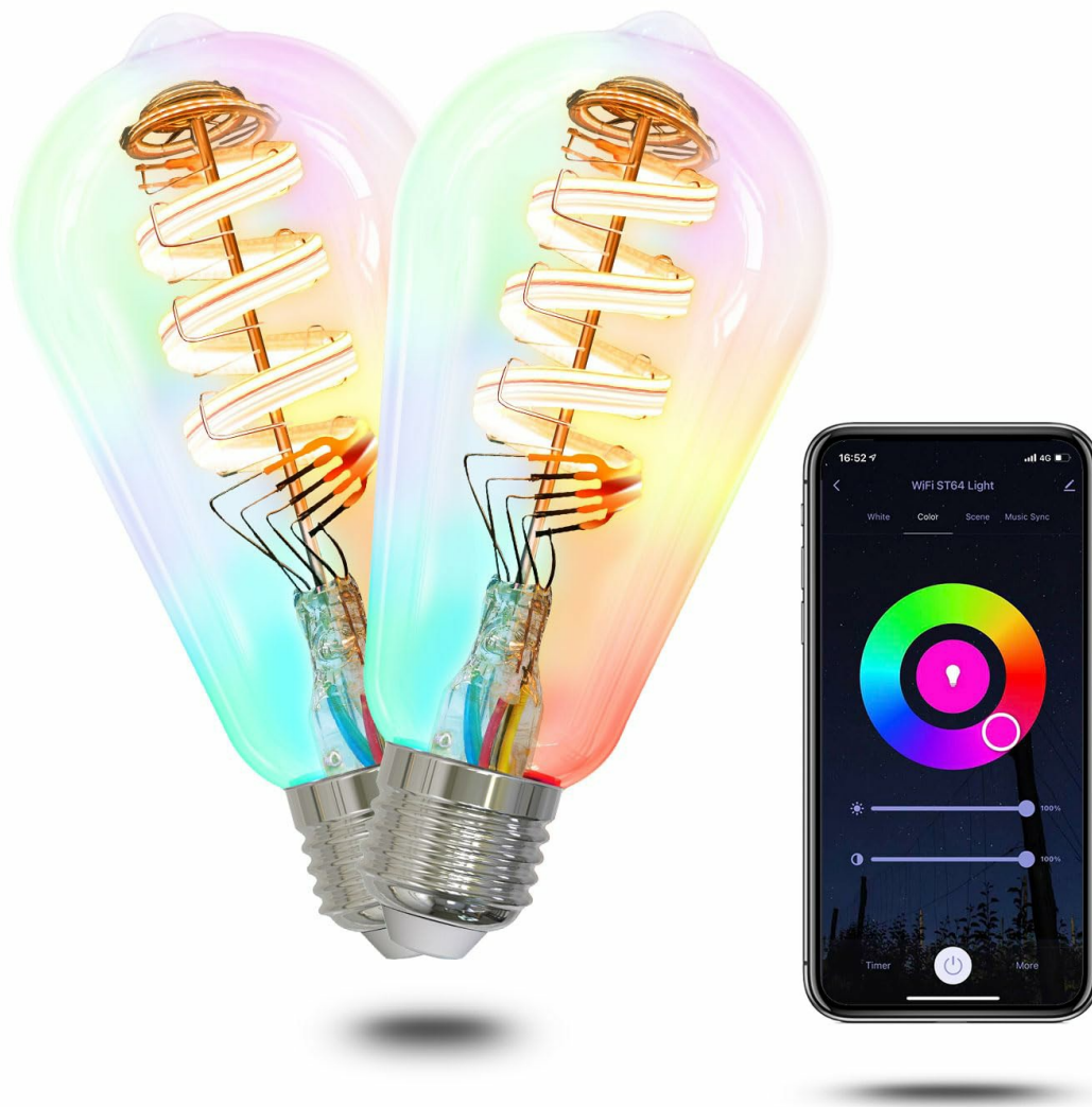
Image: MOES Smart ST64 Edison LED Light Bulb, showcasing its design and smart features.

Your browser does not support the video tag.