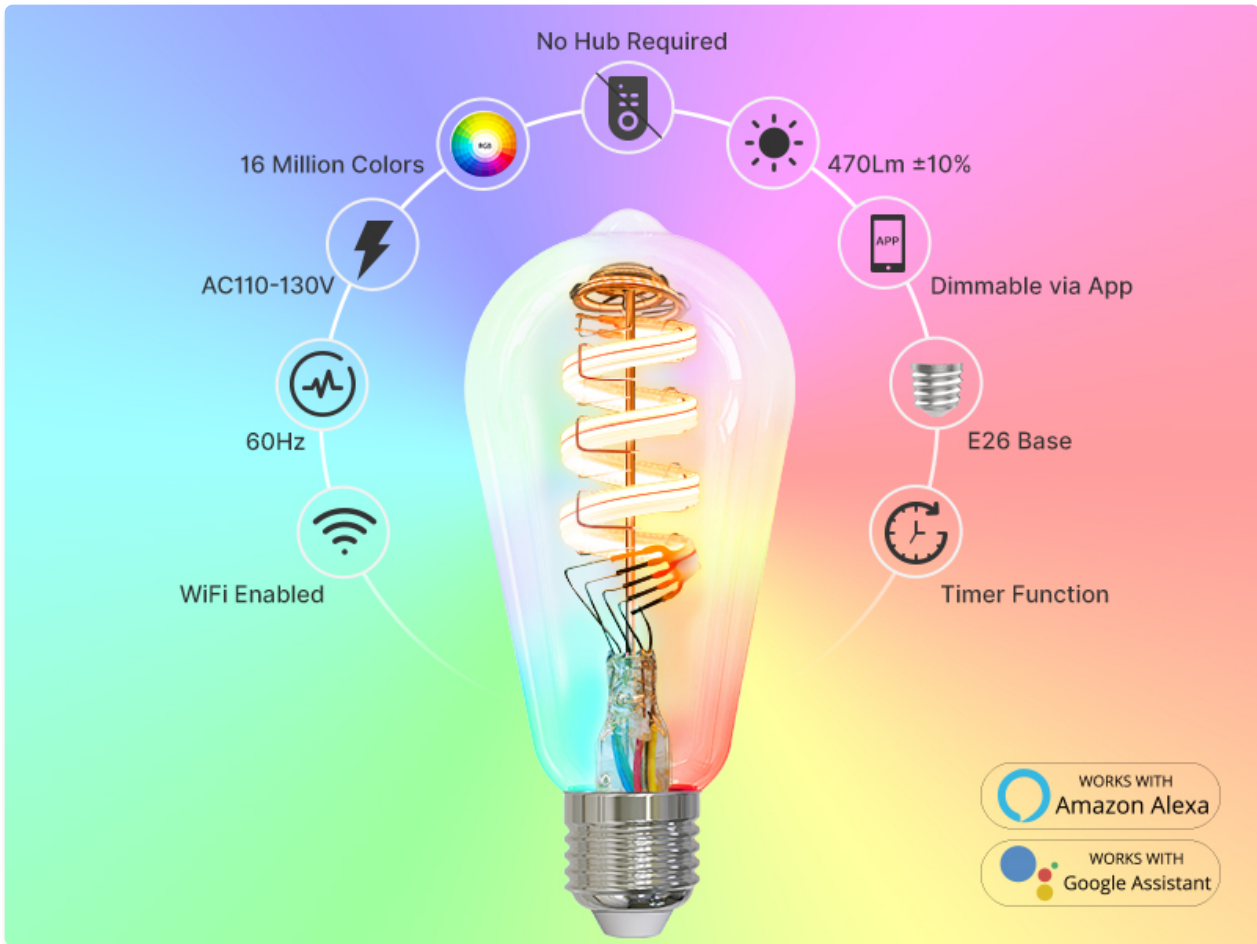
Image: Demonstrates the bulb's full-angle lighting capability and various color options, including warm white, daylight white, and 16 million colors.