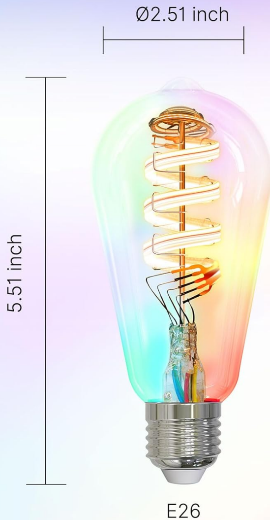
Image: Detailed product dimensions of the MOES Smart ST64 Edison LED Light Bulb.