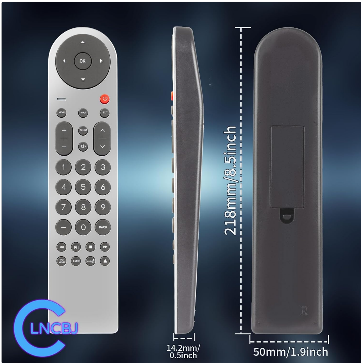
Image: Visual representation of the remote control's dimensions for reference.