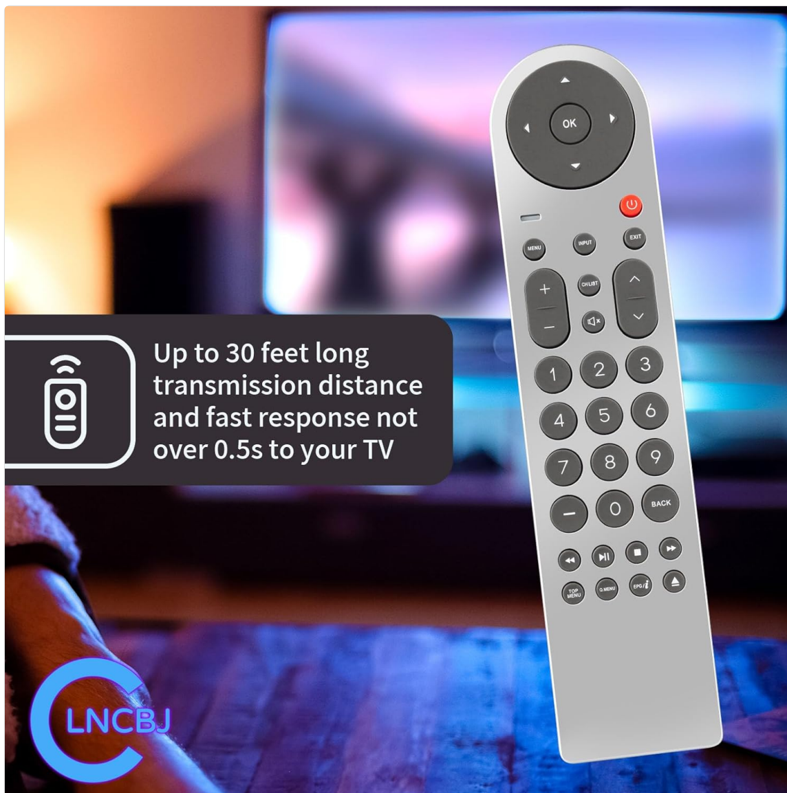
Image: The remote control demonstrating its effective operating range of up to 30 feet from the television.

The remote operates effectively up to 30 feet (approximately 9 meters) from the television, provided there is a clear line of sight between the remote's infrared emitter and the TV's receiver. Fast response times, typically under 0.5 seconds, ensure a smooth user experience.