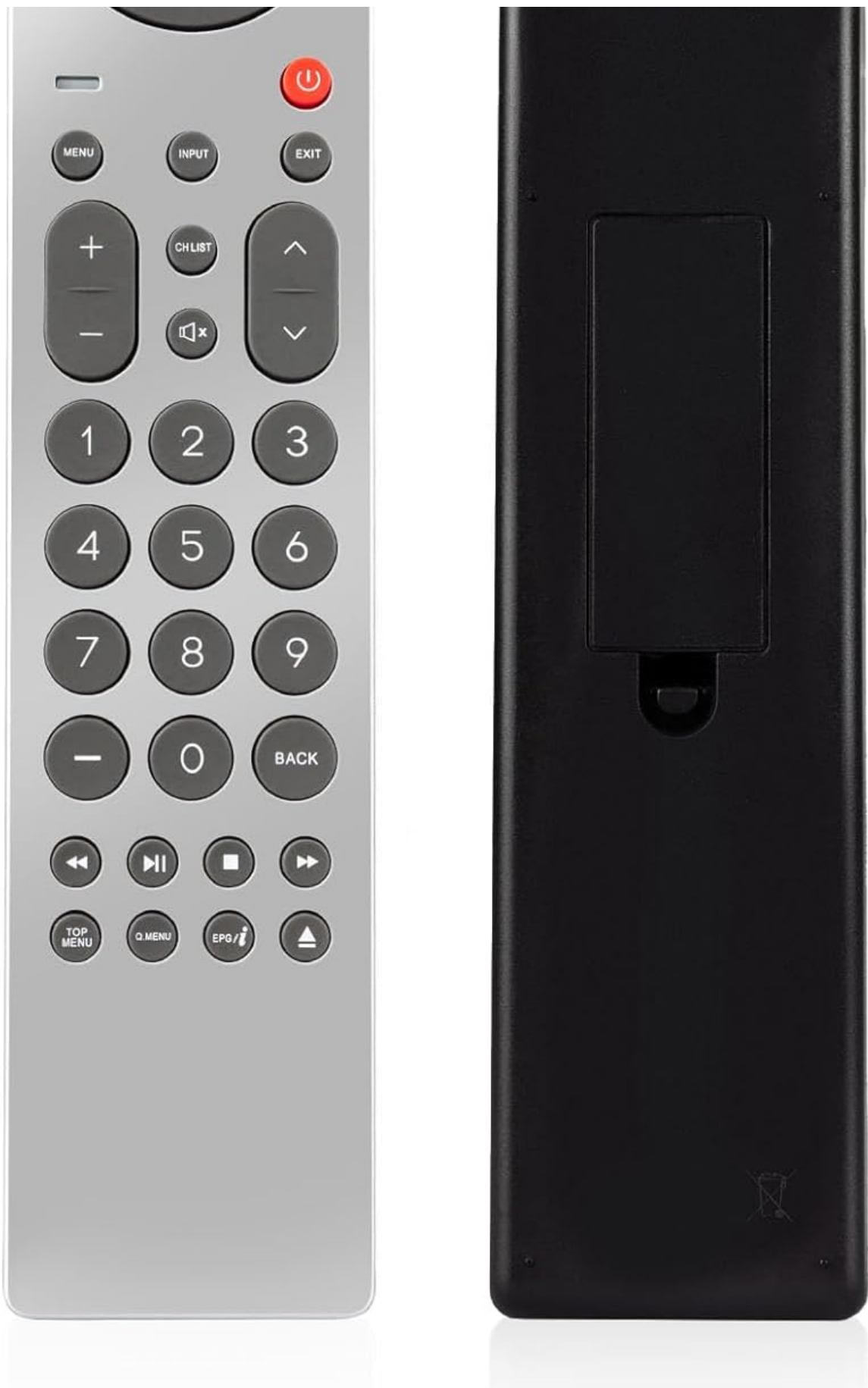
Image: Front and back views of the CLNCBJ RE20QP215 remote control, showcasing its sleek design and battery compartment.