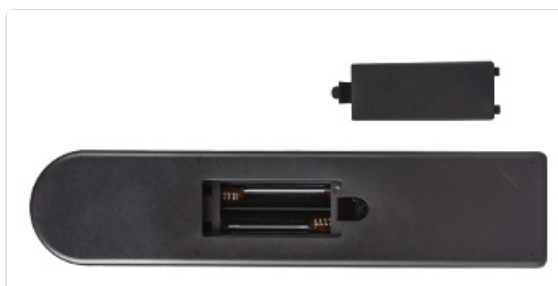
Image: The open battery compartment of the remote, illustrating where to insert the AAA batteries.