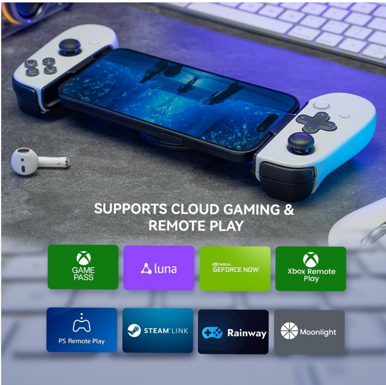
Image: A graphic showcasing the wide array of cloud gaming and remote play platforms, such as Xbox Game Pass, Amazon Luna, and Steam Link, that are compatible with the Leadjoy M1C+ controller.