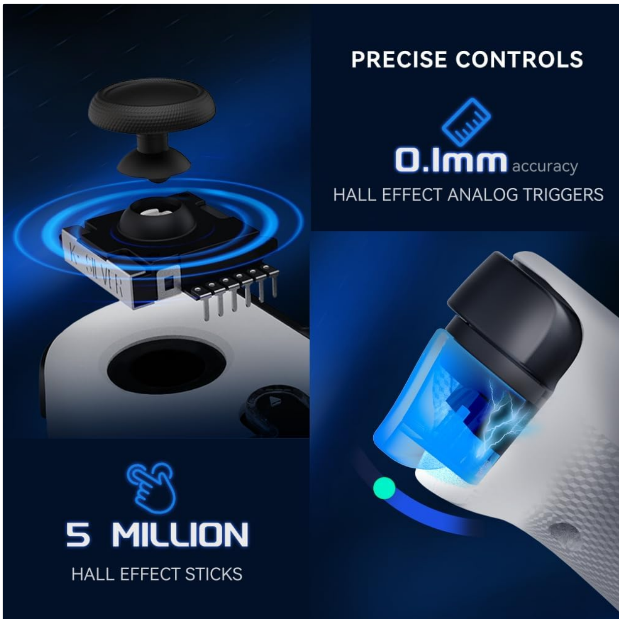
Image: A detailed view of the Hall Effect joystick mechanism and the 0.1mm precision of the analog triggers, highlighting their advanced technology.