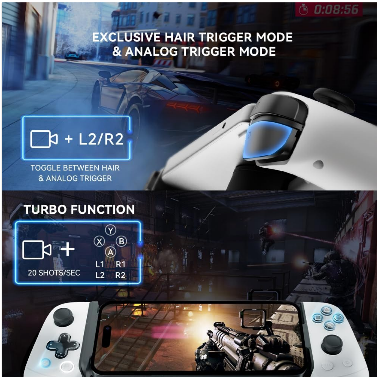
Image: Visual guide demonstrating the button combinations for switching between hair trigger and analog trigger modes, and activating the turbo function for rapid inputs.