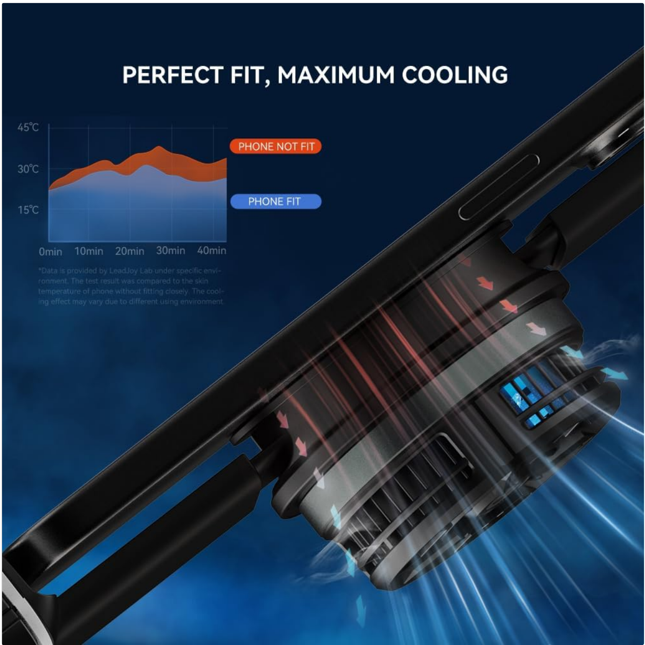
Image: An illustration of the cooling conduction plate integrated into the controller, showing how it facilitates heat transfer when used with a magnetic phone cooler.

*Data is provided by LeadJoy Lab under specific environment. The test result was compared to the skin temperature of phone without fitting closely. The cooling effect may vary due to different using environment.