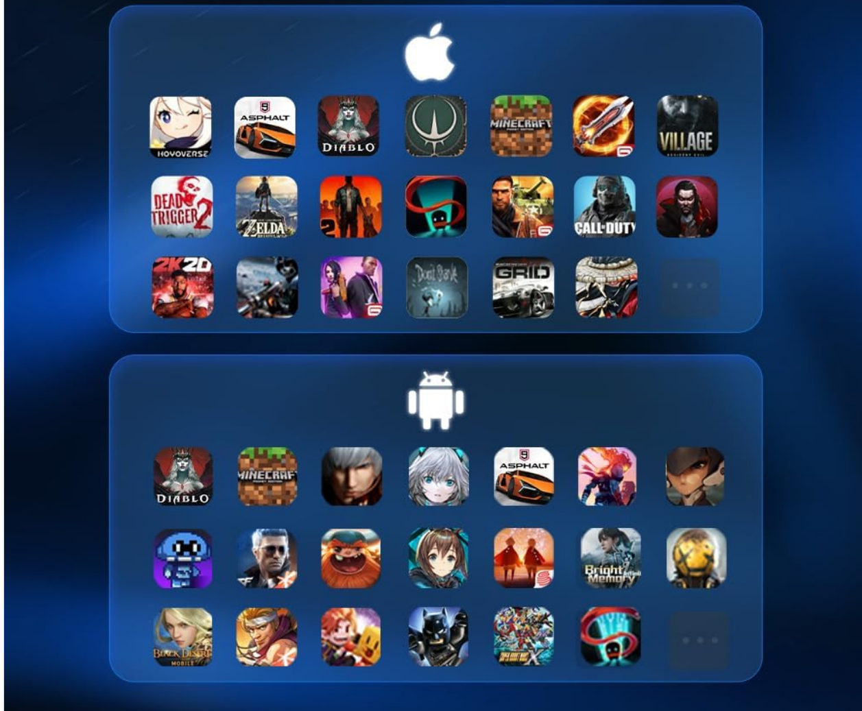
Image: A visual representation of various iOS and Android games that support controller input, demonstrating the wide compatibility of the Leadjoy M1C+.