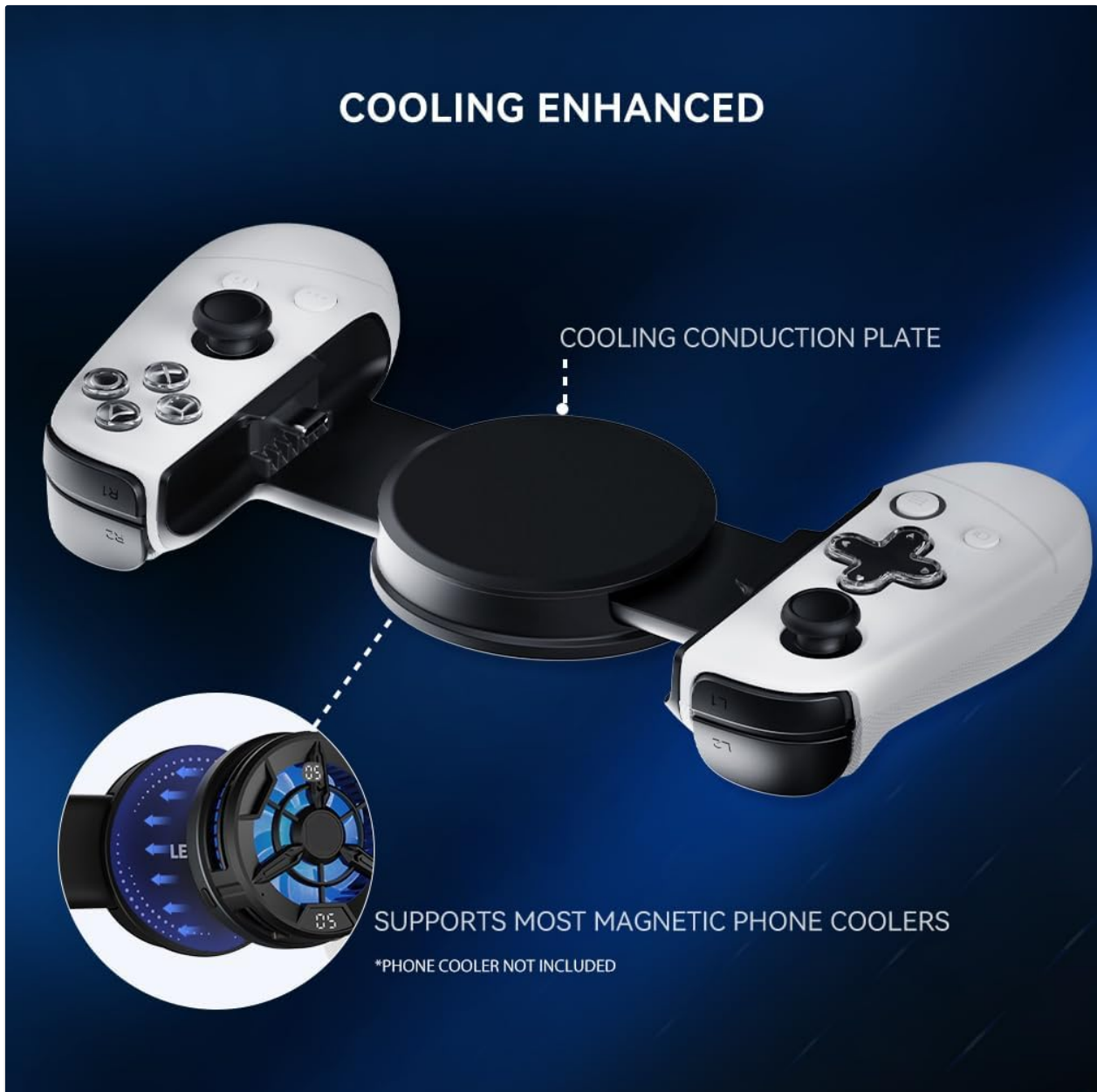
Image: The Leadjoy M1C+ controller with a smartphone securely connected via USB-C.