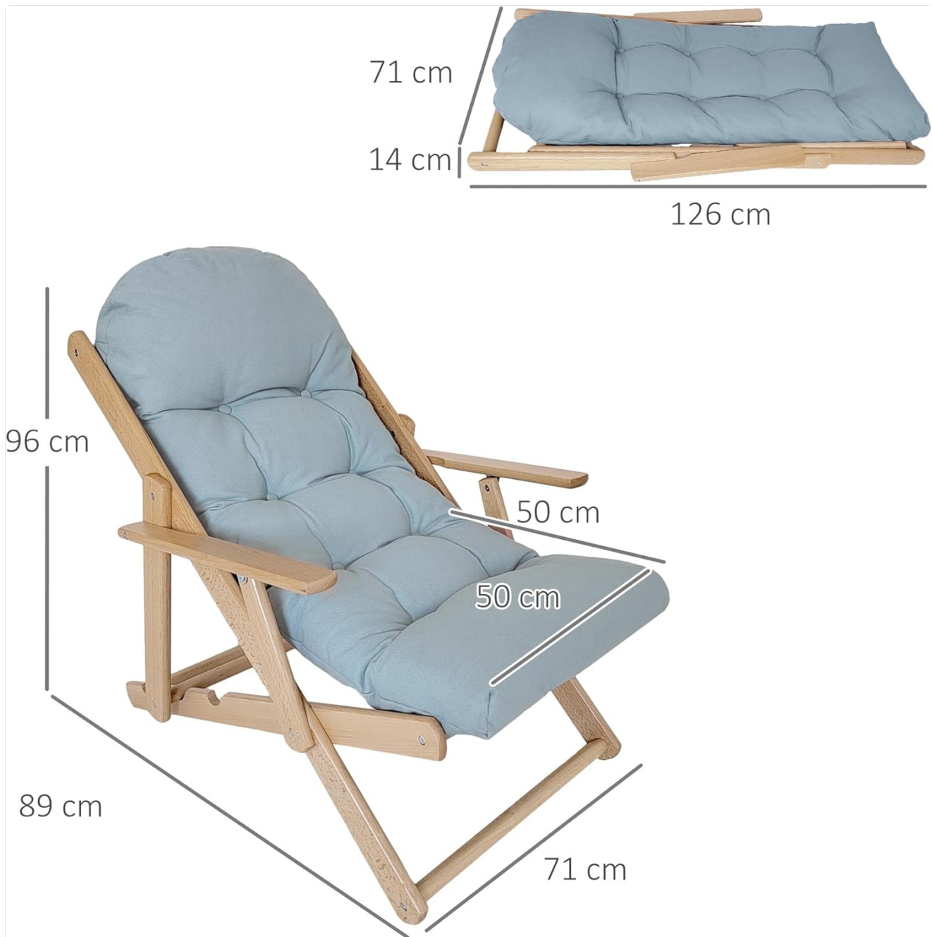
Image: Detailed diagram illustrating the various dimensions of the HOMCOM lounge chair in both its open and folded configurations.