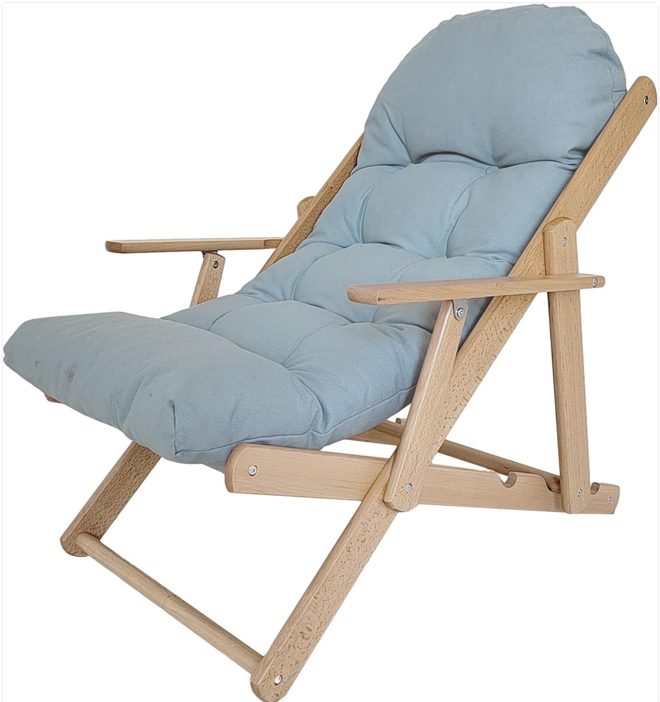
Image: Angled view of the HOMCOM lounge chair, highlighting the natural wood finish and the comfortable grey cushion.