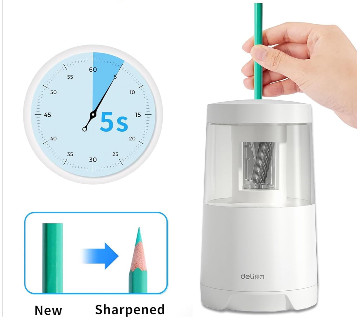
Image 4.1: The transparent shaving reservoir allows easy monitoring of fill level, and it can be easily opened for emptying.