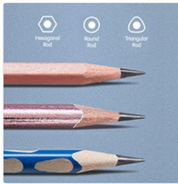
Image 3.3: The sharpener is suitable for pencils with hexagonal, round, and triangular cross-sections.