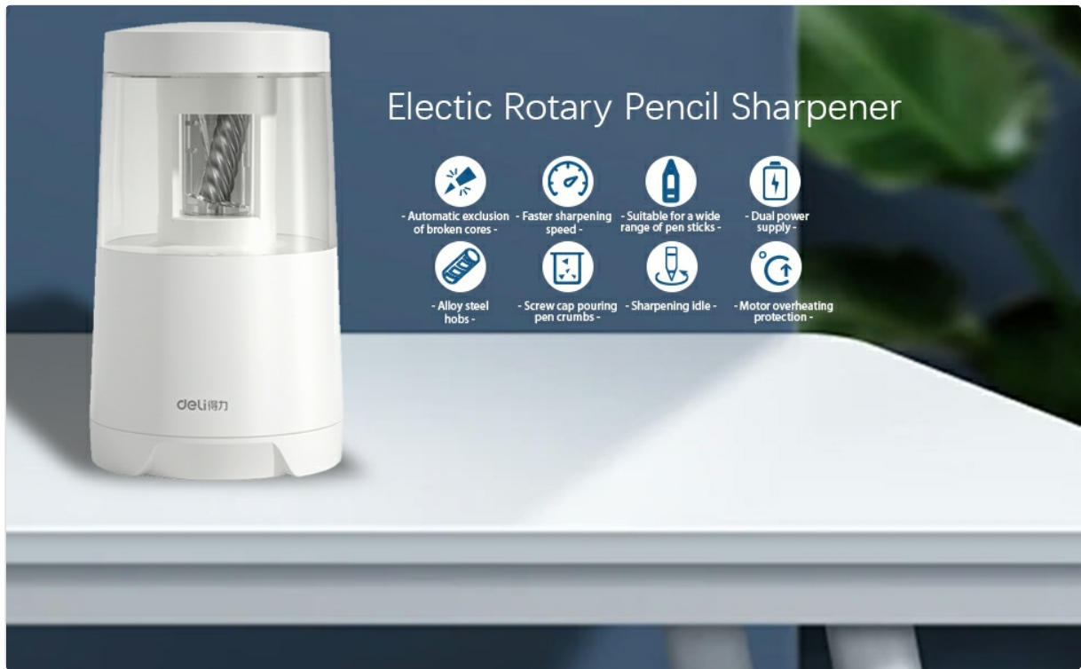
Image 4.3: An internal diagram illustrating the alloy steel hobbing blade and automatic core row hole for broken core exclusion.