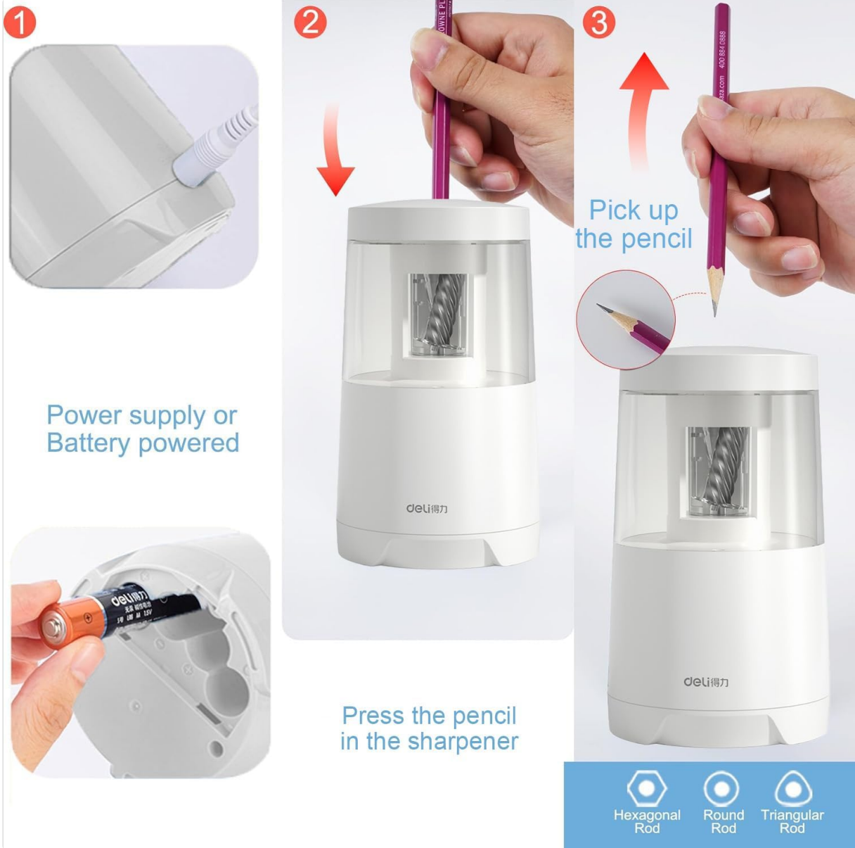
Image 3.1: Visual guide demonstrating the steps to insert a pencil, sharpen it, and remove it from the sharpener.