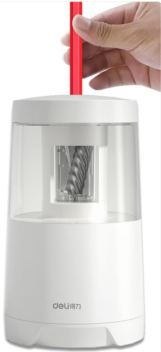
Image 2.2: The sharpener features an anti-slip pad on its base for stability during operation.