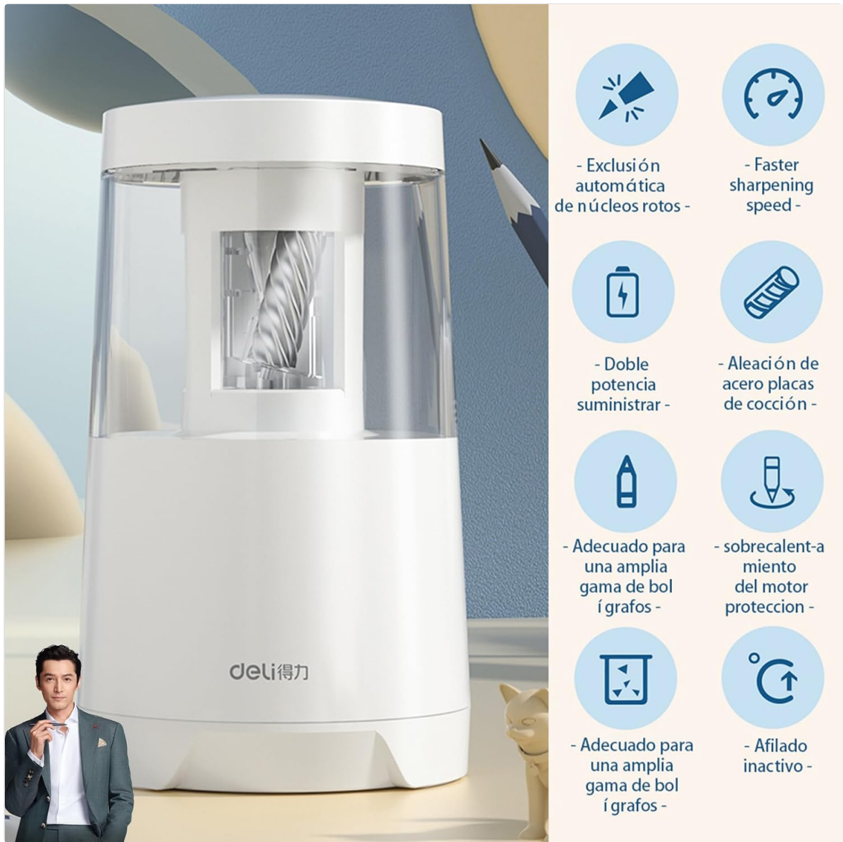
Image 1.1: Overview of the Deli Electric Pencil Sharpener VA5, highlighting its main features such as automatic broken core exclusion, faster sharpening speed, dual power supply, alloy steel blade, and suitability for various pencil types.