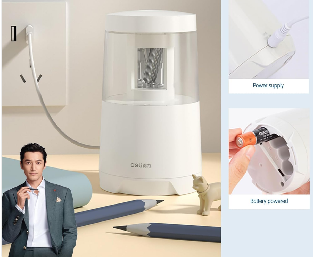
Image 2.1: The sharpener can be powered via a USB cable or by installing four AA batteries in the bottom compartment.

USB cable + battery dual power drive, no batteries required, powered by USB cable, can be powered by batteries for outdoor use