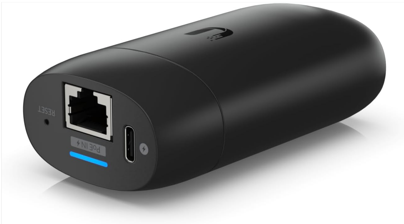
Figure 1: Rear view of the Ubiquiti UC-CAST-US Display Cast showing the PoE IN port, USB-C power input, and Reset button.