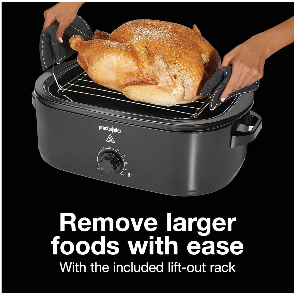
Figure 5: A large turkey being easily removed from the roaster oven using the integrated lift-out rack, designed for convenience and safety.