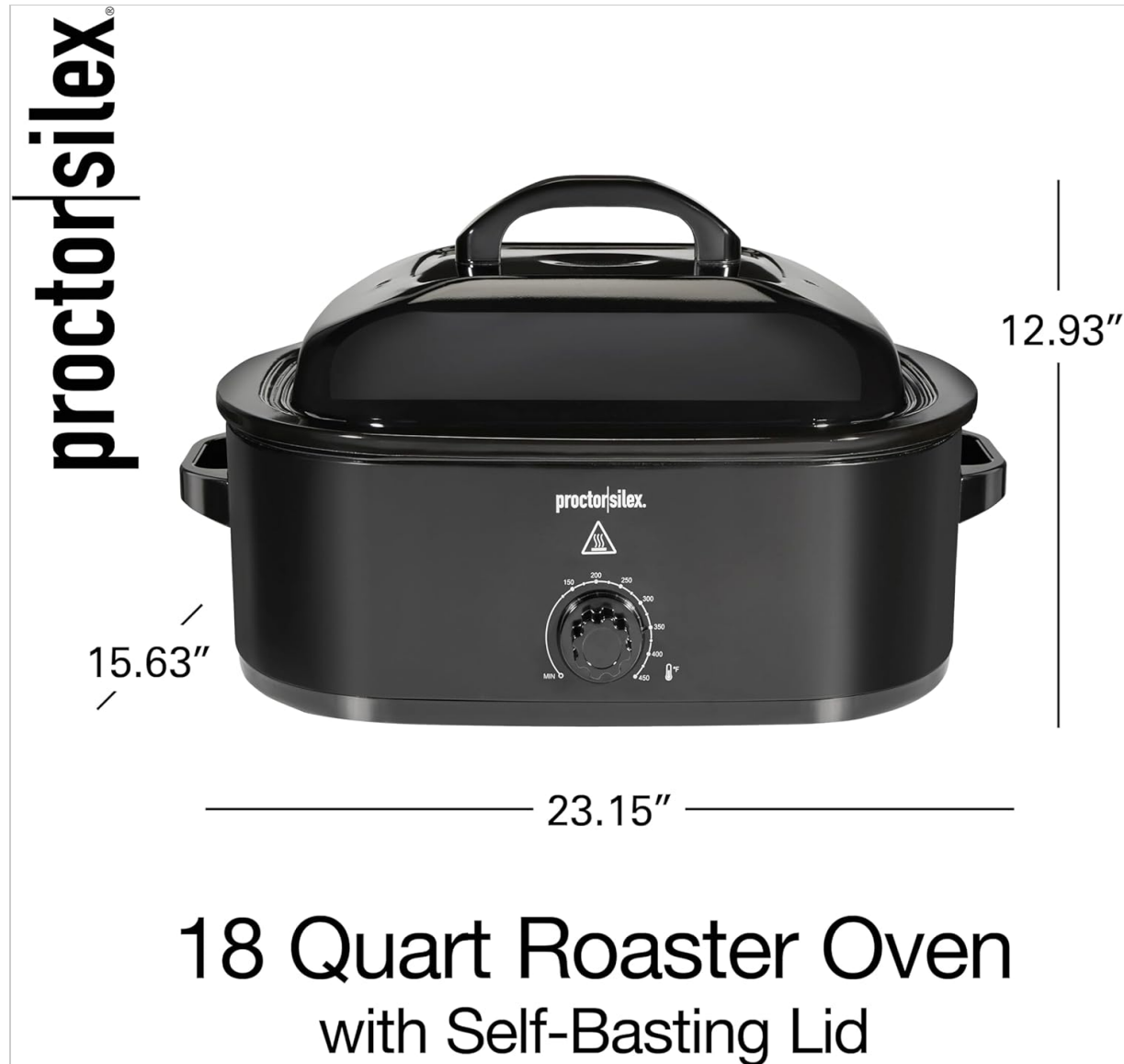
Figure 2: Overview of the roaster oven, highlighting its dimensions (15.64"D x 23.15"W x 12.93"H).