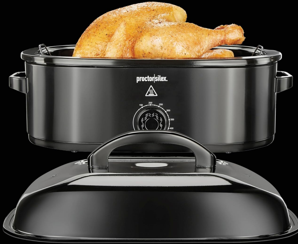
Figure 4: A cooked turkey inside the roaster oven, demonstrating its capacity and the effectiveness of the self-basting lid for moist results.