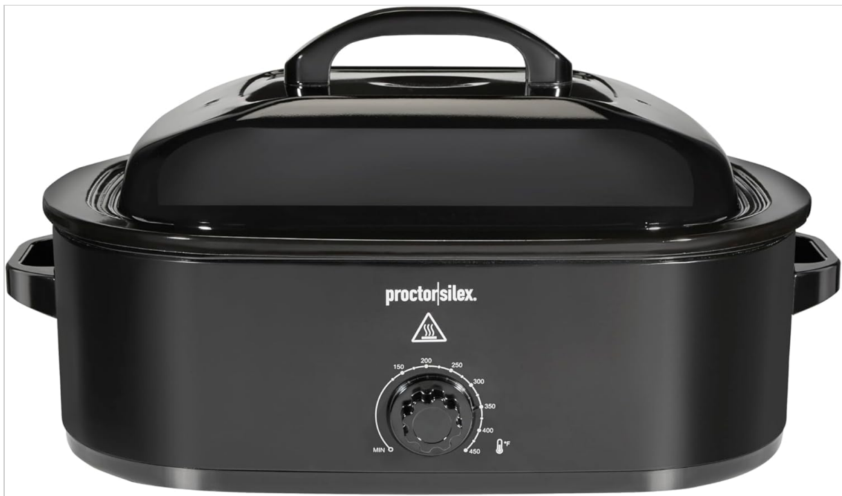
Figure 1: Proctor Silex 18-Quart Electric Roaster Oven with lid.

Your browser does not support the video tag.