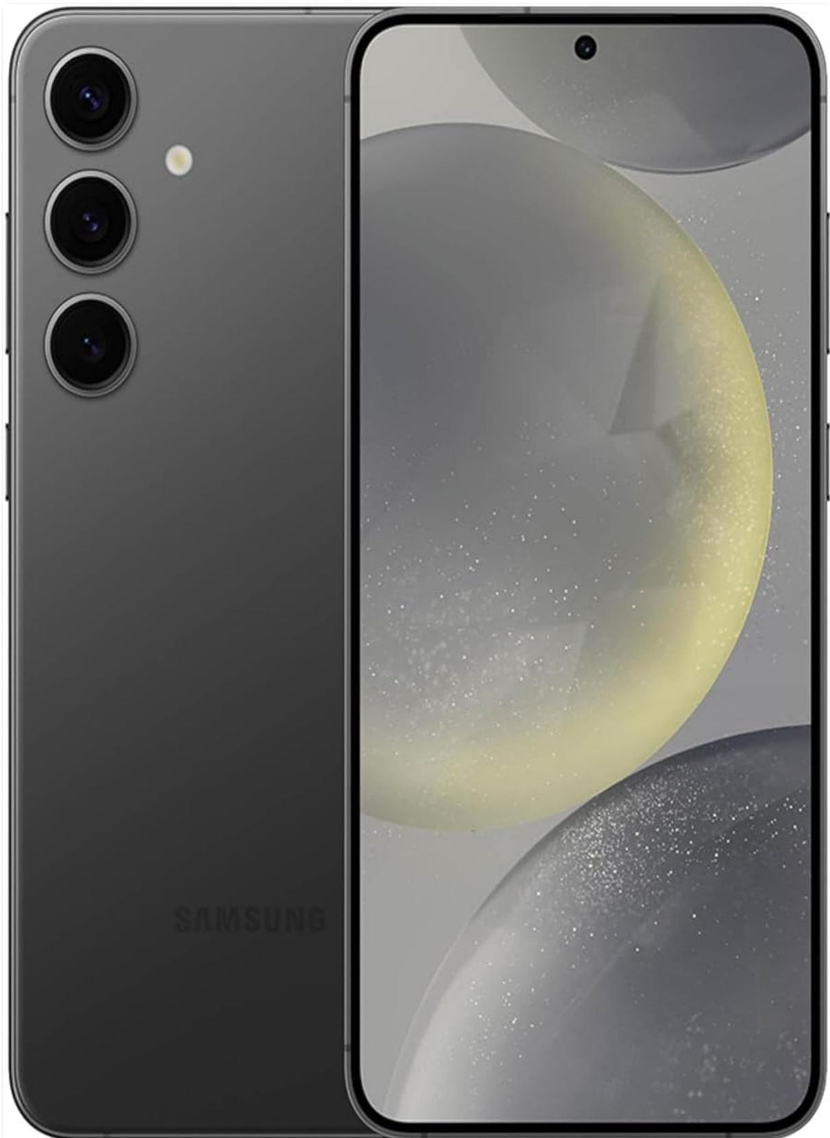
Image: Front and back view of the Samsung Galaxy S24.