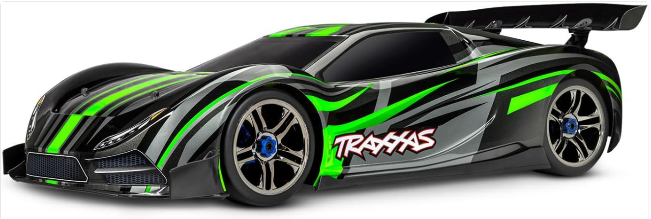
Figure 1: Front three-quarter view of the Traxxas XO-1 1/7 AWD Supercar, showcasing its aerodynamic design and green and black color scheme.

This instruction manual provides comprehensive guidance for the assembly, operation, and maintenance of your Traxxas XO-1 1/7 AWD Supercar. The XO-1 is a high-performance, all-wheel-drive remote-controlled vehicle designed for experienced users. Please read this manual thoroughly before operating the vehicle to ensure safe and optimal performance.