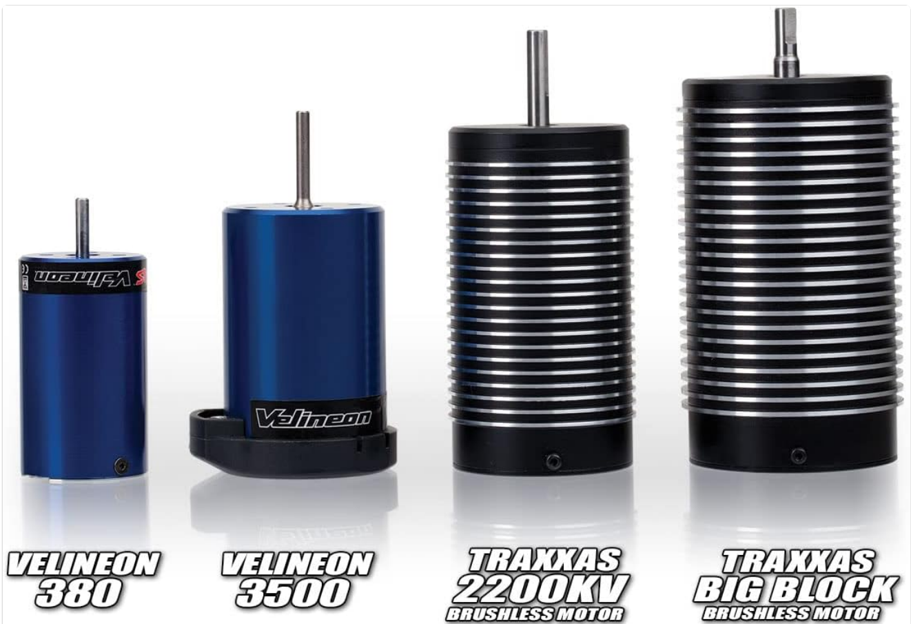
Figure 4: A visual comparison of various Traxxas brushless motors, including the powerful Big Block motor used in the XO-1.

The XO-1 is equipped with a powerful Traxxas Big Block motor and a Castle Mamba Monster Extreme ESC, capable of handling 6s LiPo power for exceptional acceleration and top speed. This system is designed for high-performance operation and requires careful handling.