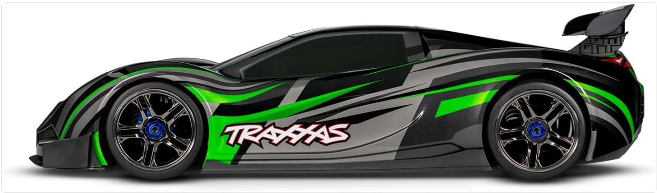
Figure 3: Side profile of the Traxxas XO-1, highlighting its sleek, aerodynamic body designed for high-speed performance.