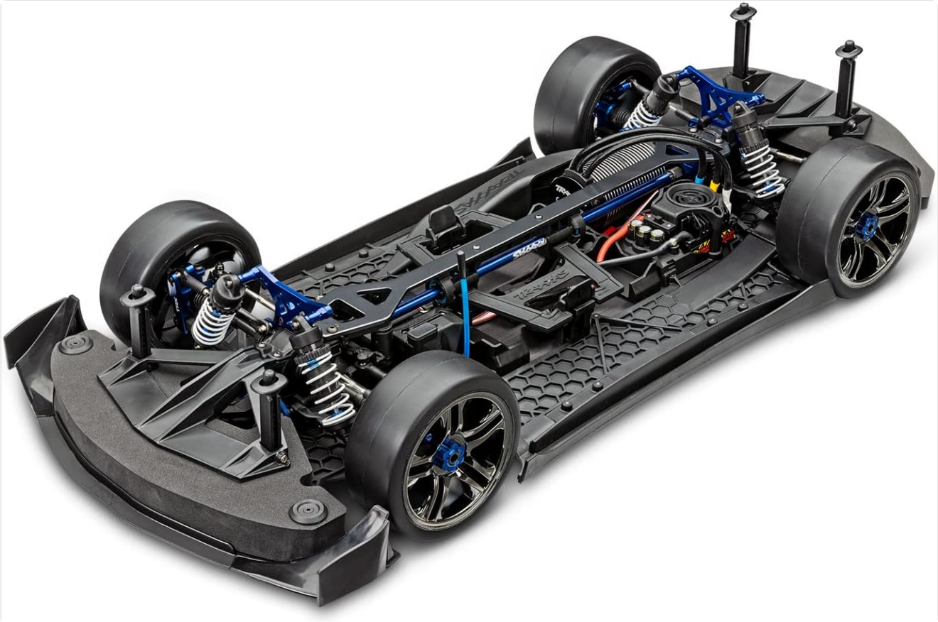
Figure 5: Angled view of the XO-1 chassis, providing a clear look at the suspension arms, shocks, and electronic components, essential areas for regular inspection.