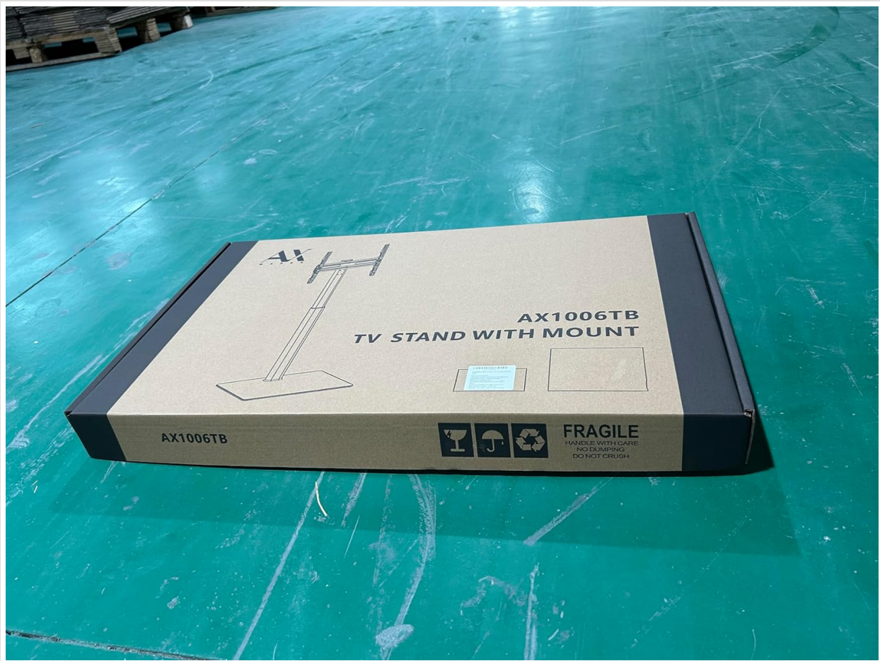
Image: The product packaging for the AX WABER TV Stand, model AX1006TB, indicating careful handling.