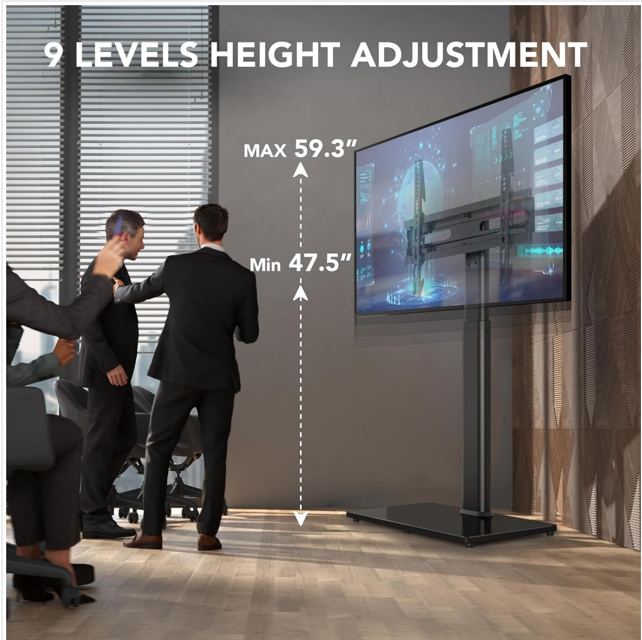
Image: A visual representation of the 9 levels of height adjustment, ranging from a minimum of 47.5 inches to a maximum of 59.3 inches.

The TV stand features 9 levels of height adjustment. To adjust the height, carefully loosen the securing bolts on the support pillar, slide the TV to the desired height, and then retighten the bolts securely. Ensure the TV is level after adjustment.