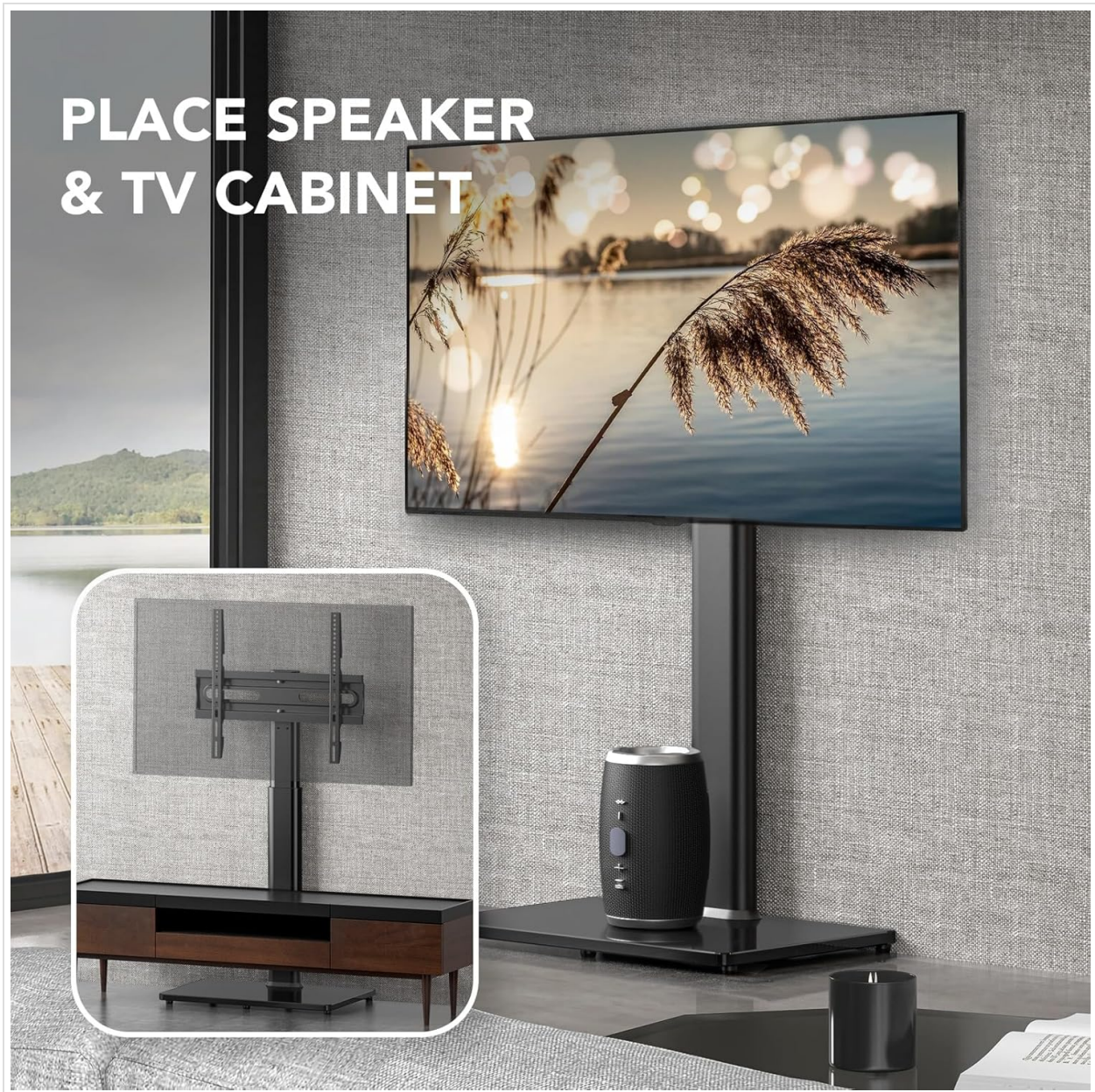
Image: The TV stand positioned alongside a TV cabinet and speaker, demonstrating its space-saving design and compatibility with existing furniture.