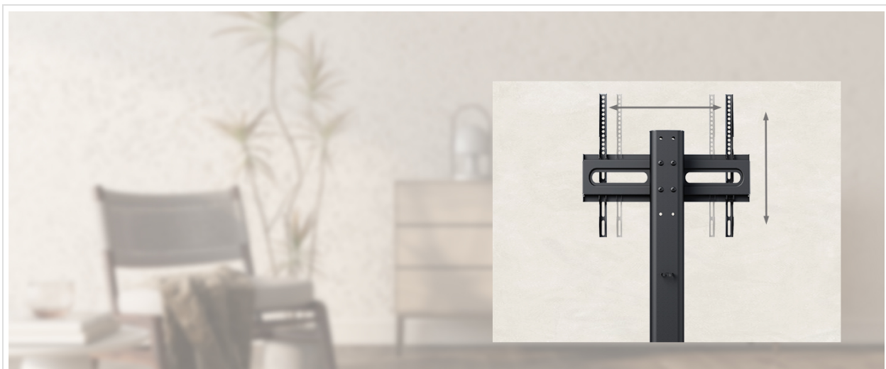
Image: The TV stand demonstrating its height adjustment capability, allowing for optimal viewing angles.