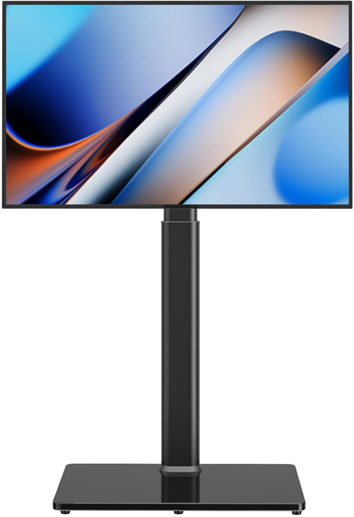
Image: The AX WABER Universal Floor TV Stand, showcasing its sleek black design and sturdy base.