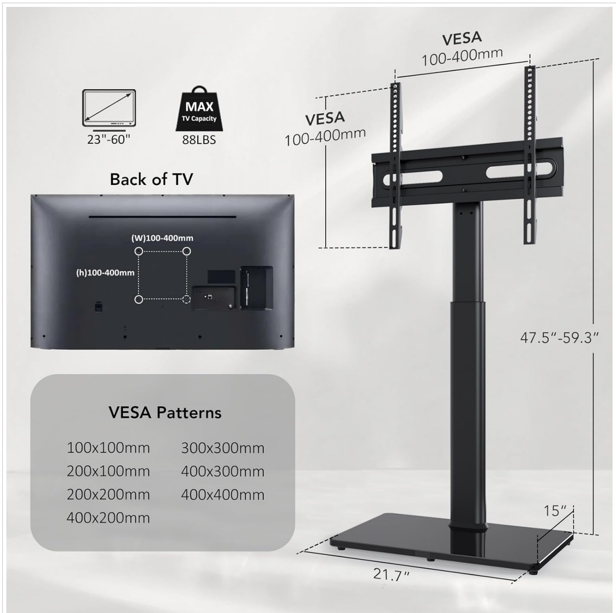
Image: Detailed diagram illustrating VESA compatibility (100-400mm) and overall dimensions of the TV stand.