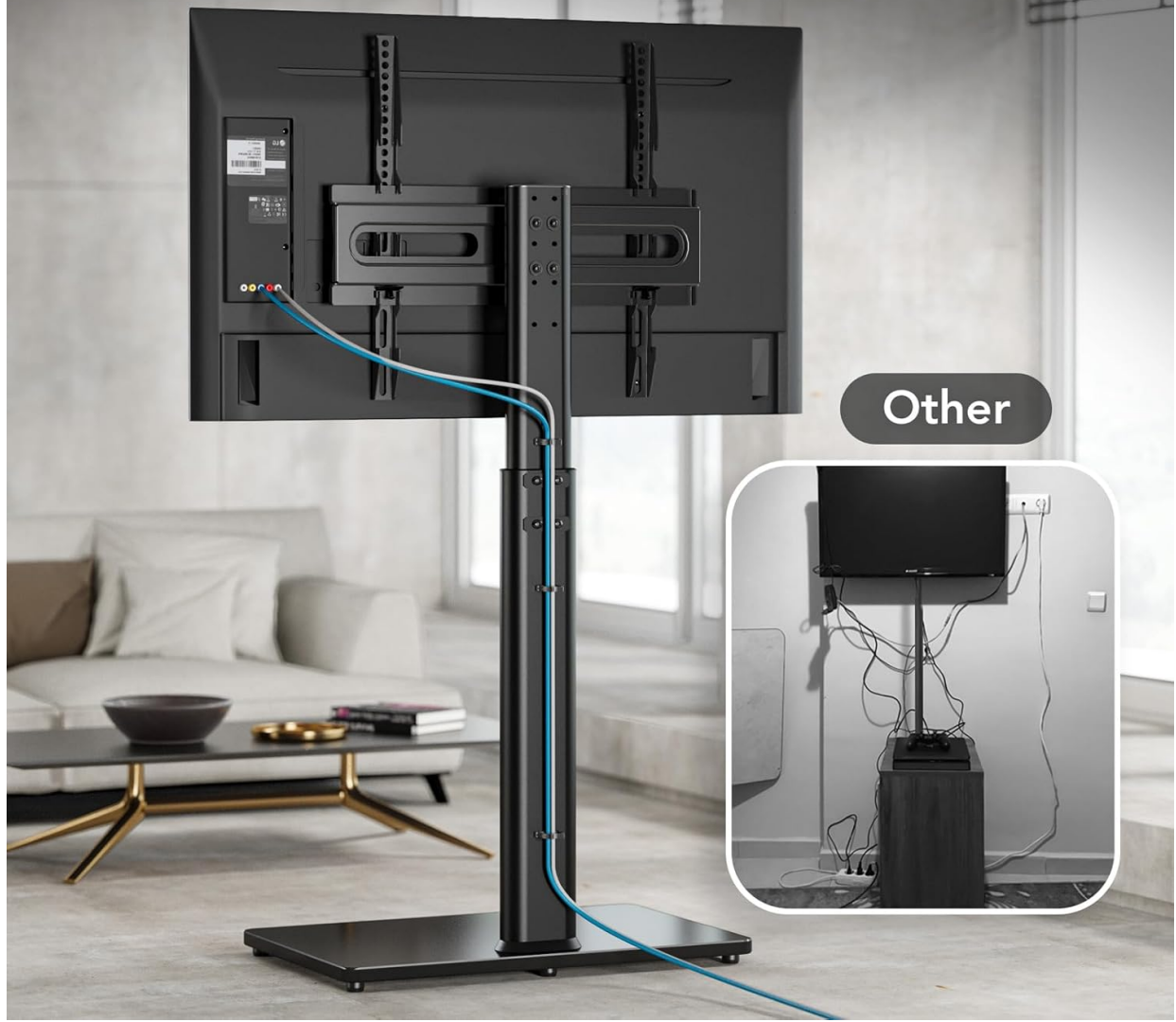
Image: A rear view of the TV stand showing how cables are neatly routed and hidden using the integrated cable management system.