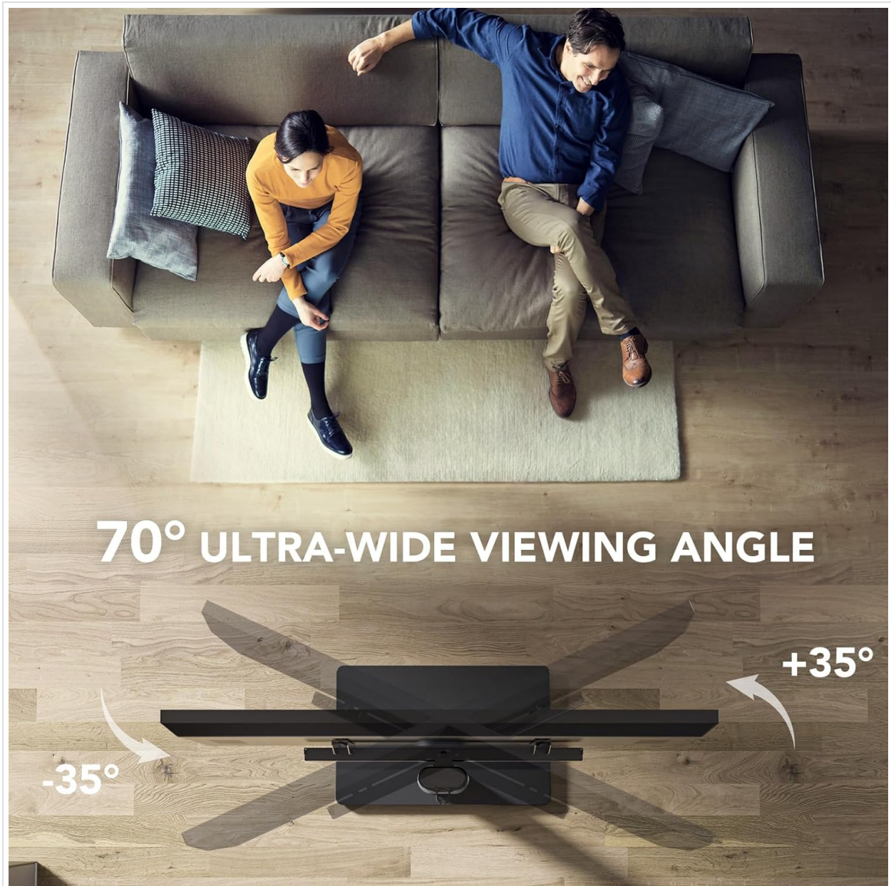
Image: An overhead perspective illustrating the 70-degree ultra-wide viewing angle provided by the swivel mount.

The TV mount allows for a 70-degree swivel range (-35 to +35 degrees). Gently push the TV to the left or right to achieve your desired viewing angle. This feature is ideal for optimizing viewing from different positions in a room.