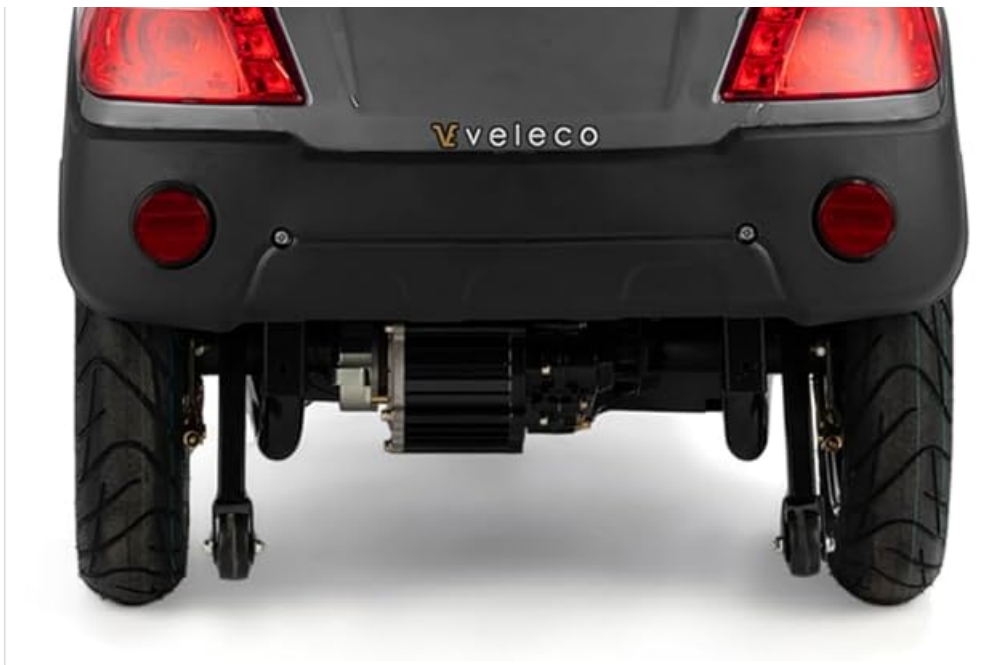
Figure 3.3: Rear view of the scooter, showing the taillights and the spacious, lockable rear storage case.