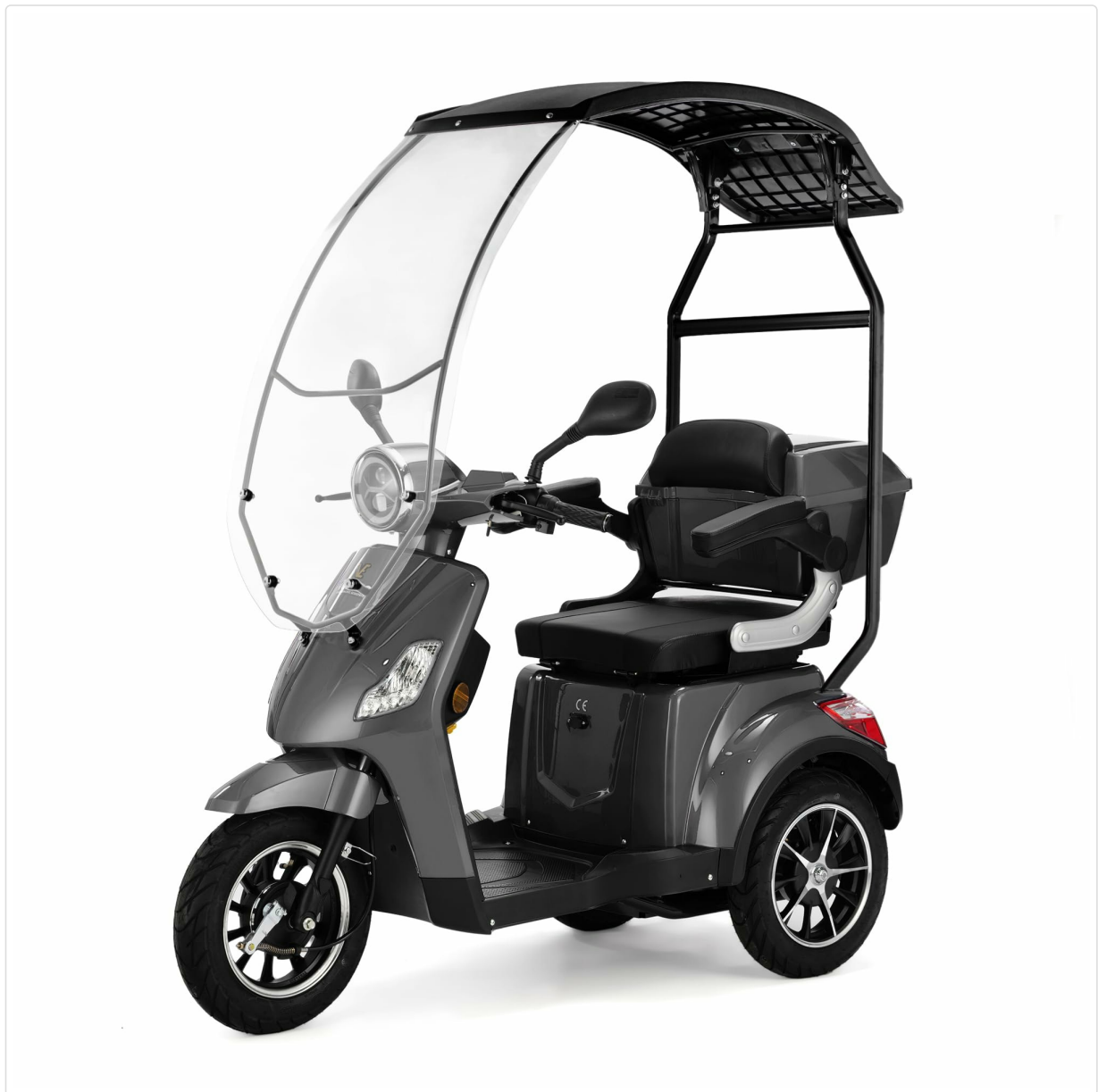
Figure 3.1: Side view of the VELECO DRACO mobility scooter, showcasing its design and integrated roof.