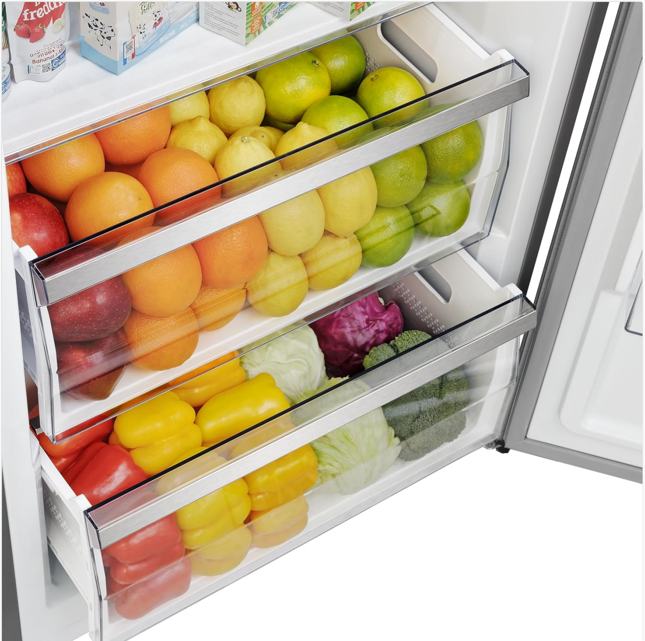
Figure 5: Example of refrigerator drawers filled with fresh produce, demonstrating the capacity and design for optimal food preservation.