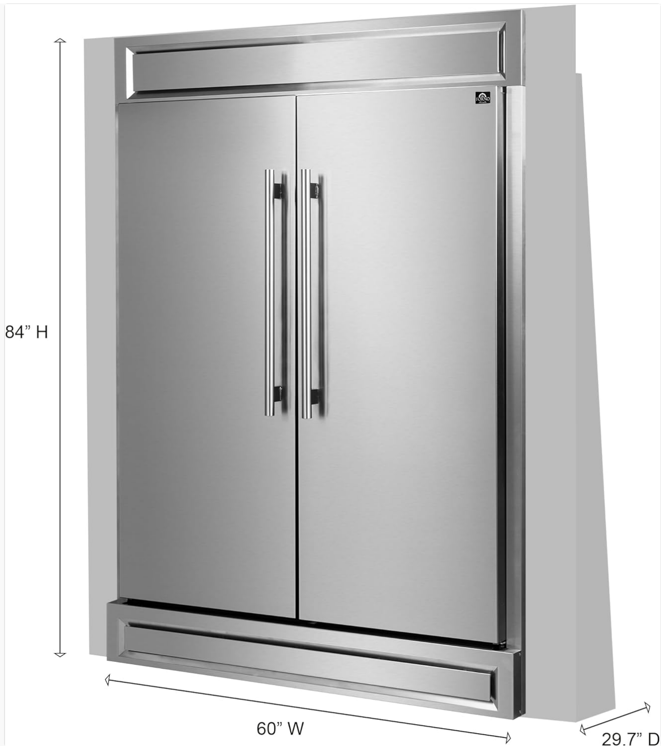
Figure 2: Dimensional diagram of the Forno Maderno 60-inch Convertible Refrigerator/Freezer, indicating its height, width, and depth for proper built-in installation.