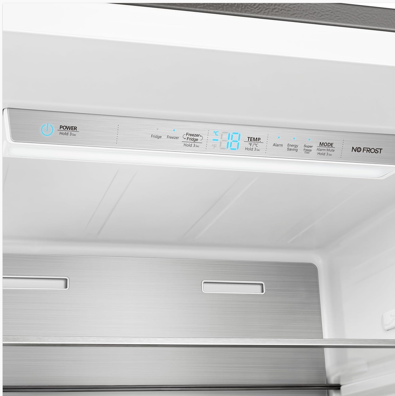
Figure 3: Detailed view of the internal electronic touch control panel, showing buttons for Power, Fridge/Freezer mode, Temperature adjustment, and other functions.

The internal electronic touch control panel allows you to manage the appliance's settings. It typically includes controls for power, temperature adjustment, mode selection (refrigerator/freezer), and special functions like Super Freeze or Energy Saving.