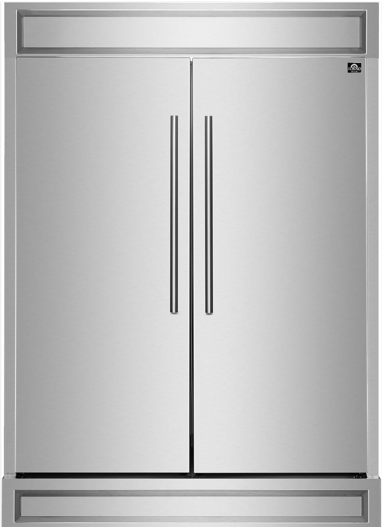
Figure 1: Front view of the Forno Maderno 60-inch 2-Piece Convertible Refrigerator/Freezer. This image displays the appliance with its stainless steel finish and two vertical handles, designed for built-in integration.