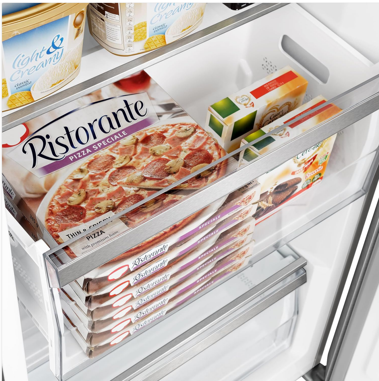
Figure 6: Example of freezer drawers containing various frozen food items, illustrating the storage capabilities when configured as a freezer.