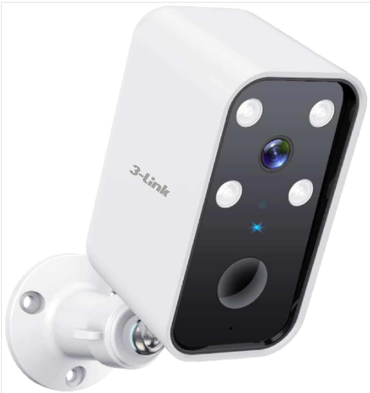
Image: The 3-Link TB1 Wireless Outdoor Security Camera, a white bullet-style camera with a wall mount, featuring a lens, four LED lights, and a blue indicator light.