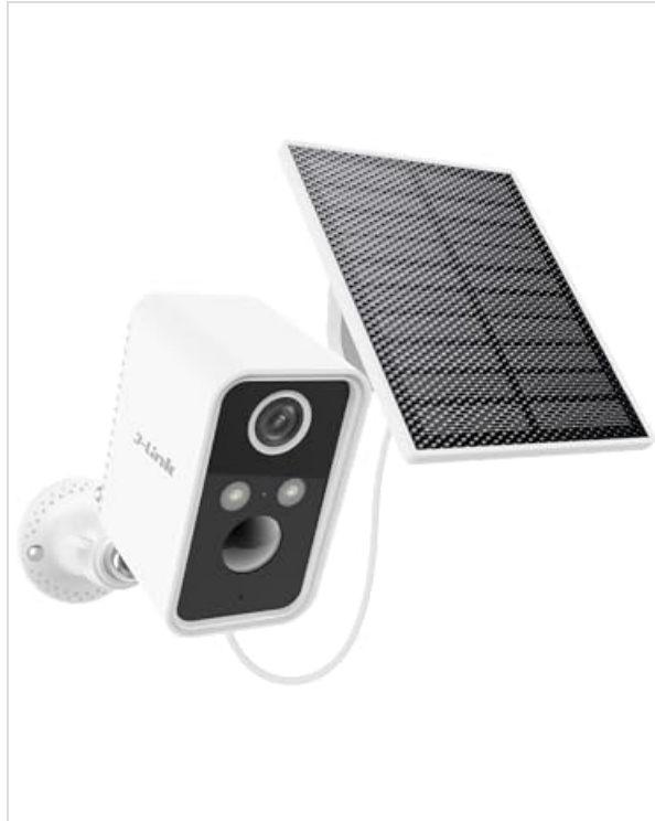
Image: The 3-Link TB1 camera mounted on a wall, connected to an optional solar panel for continuous charging.

Choose a suitable outdoor location for mounting, ensuring a clear view and strong Wi-Fi signal. Use the provided wall mount and screws to securely attach the camera. Adjust the camera angle for optimal coverage.