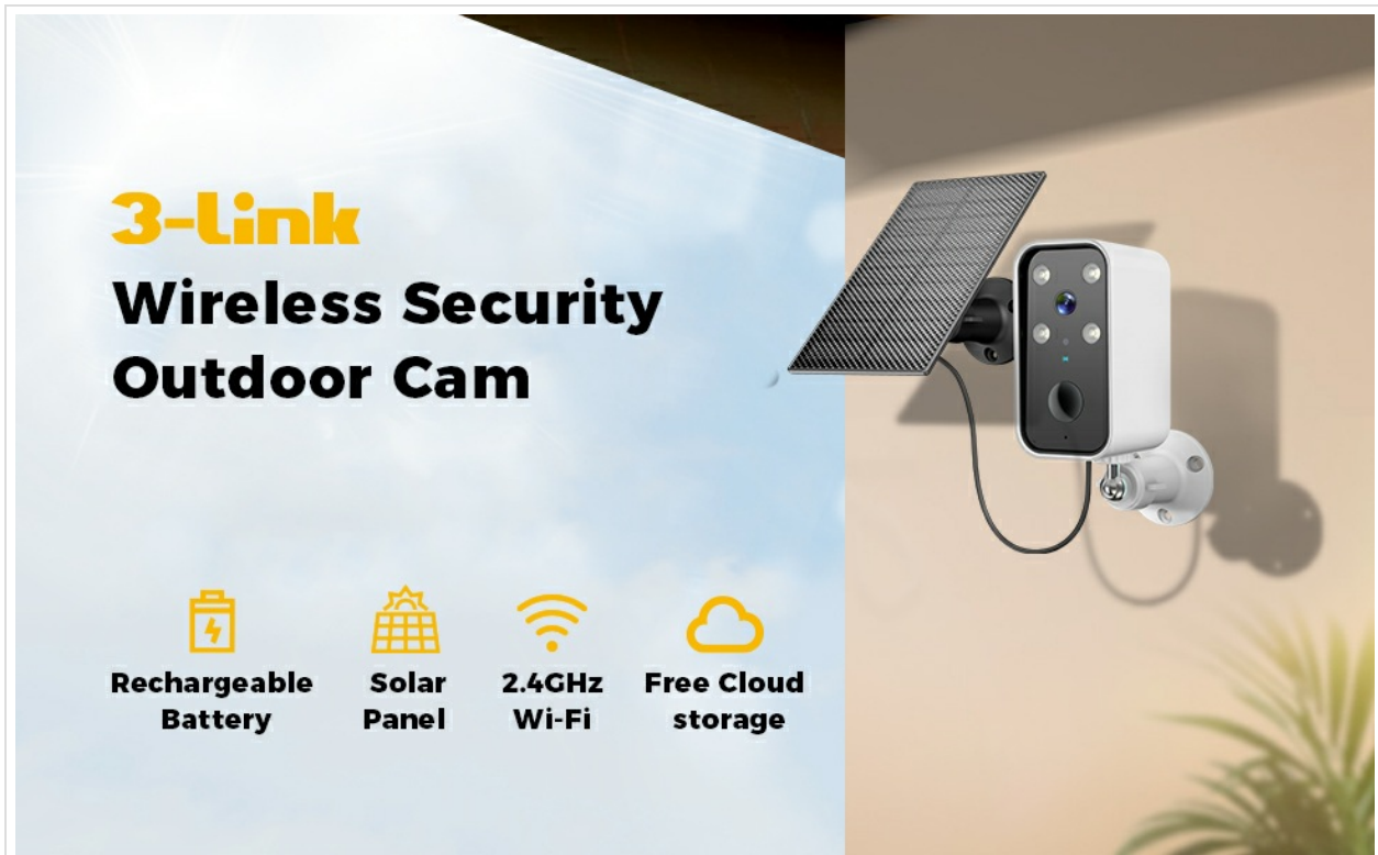
Image: An illustration highlighting the camera's features: Rechargeable Battery, Solar Panel compatibility (sold separately), 2.4GHz Wi-Fi, and Free Cloud storage.