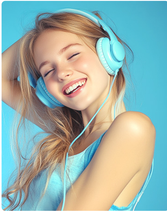
Figure 9: Image Viewing and Editing

This image shows the AGPTEK T05 MP4 player displaying an image with various editing options, including filters like "None", "Punch", "Vintage", "B/W", and "Bleach", demonstrating its multimedia capabilities beyond just playback.