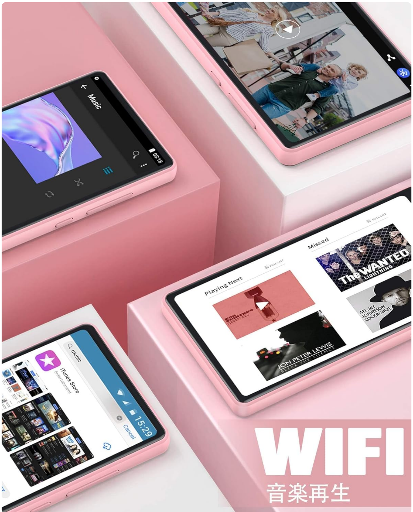
Figure 4: Wi-Fi Enabled Music Playback

This image illustrates the AGPTEK T05 MP4 player displaying a music playback screen, with a prominent "WIFI" text overlay, indicating its wireless connectivity feature for online music streaming or content access.