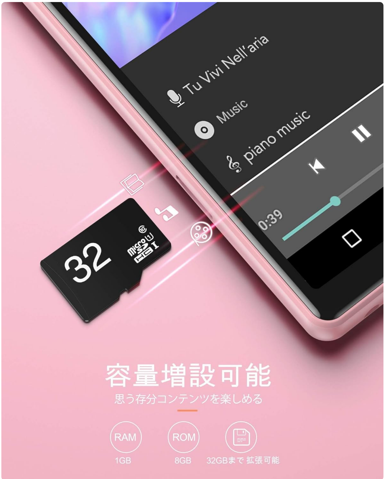
Figure 6: MicroSD Card Insertion

This image depicts a microSD card being inserted into the AGPTEK T05 MP4 player, with text indicating "Capacity expandable" and specifications for RAM (1GB), ROM (8GB), and expandable storage up to 32GB.