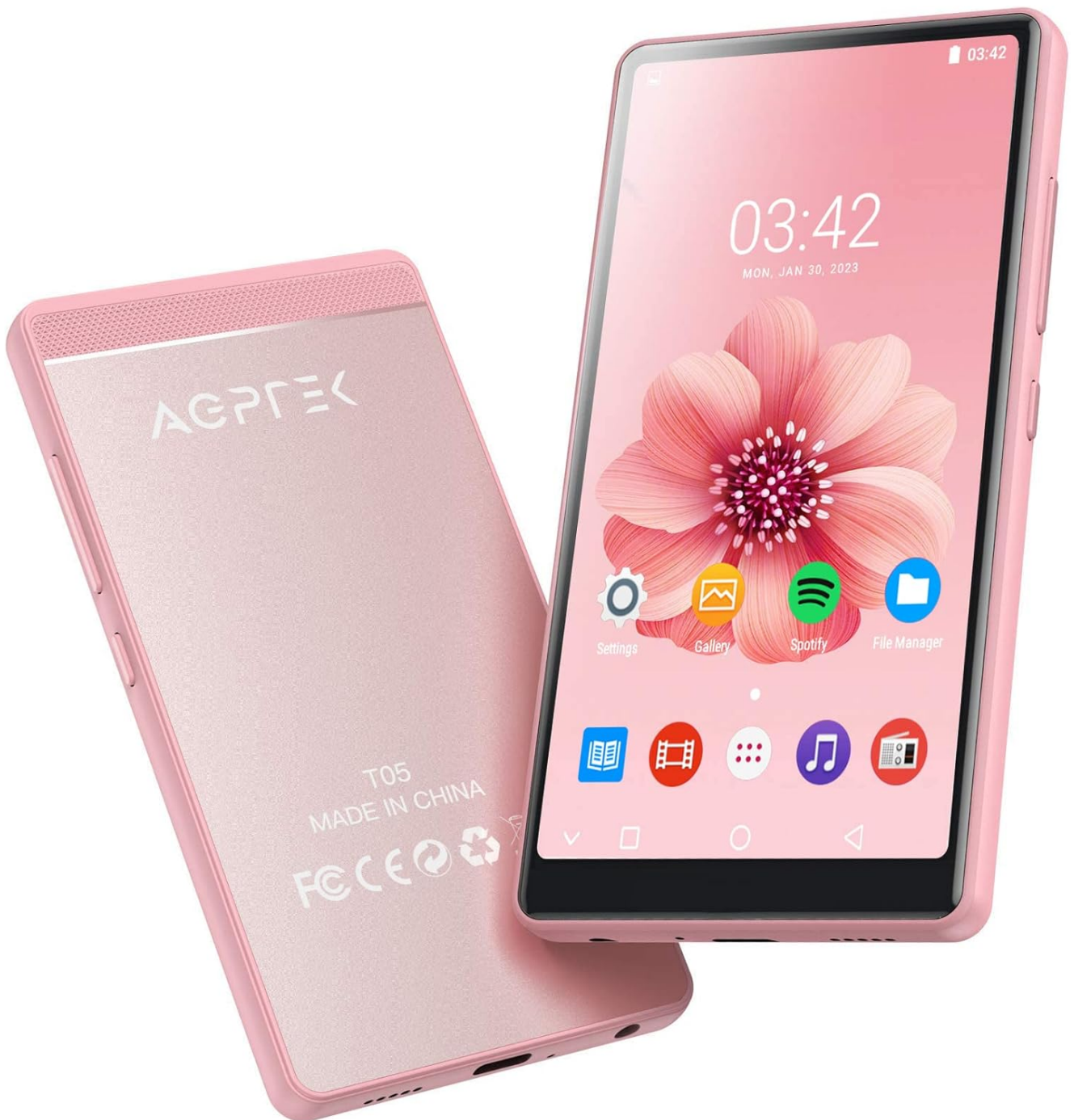
Figure 1: AGPTEK T05 MP4 Player Overview

This image displays the AGPTEK T05 MP4 player, highlighting its sleek pink design. The front screen shows a vibrant floral wallpaper and various application icons, while the back panel features the AGPTEK branding and model number T05.