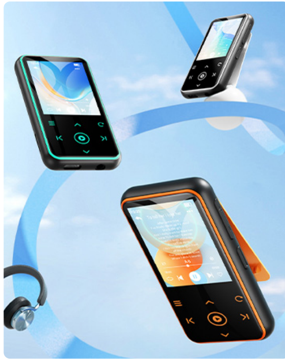
Figure 5: Bluetooth Functionality

This image shows a side profile of the AGPTEK T05 MP4 player, with graphic overlays of a Bluetooth symbol, a speaker icon, and a headphone icon, illustrating its wireless audio capabilities.