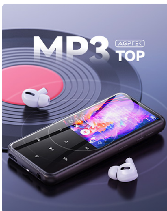
Figure 3: Touch Screen Interaction

The AGPTEK T05 features a responsive touch screen for intuitive control. Tap icons to open applications, swipe to navigate between screens, and use pinch-to-zoom gestures where applicable.