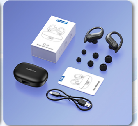
Image: An illustration showing the FOYCOY D8 earbuds, charging case, USB-C cable, and different sized eartips included in the package.