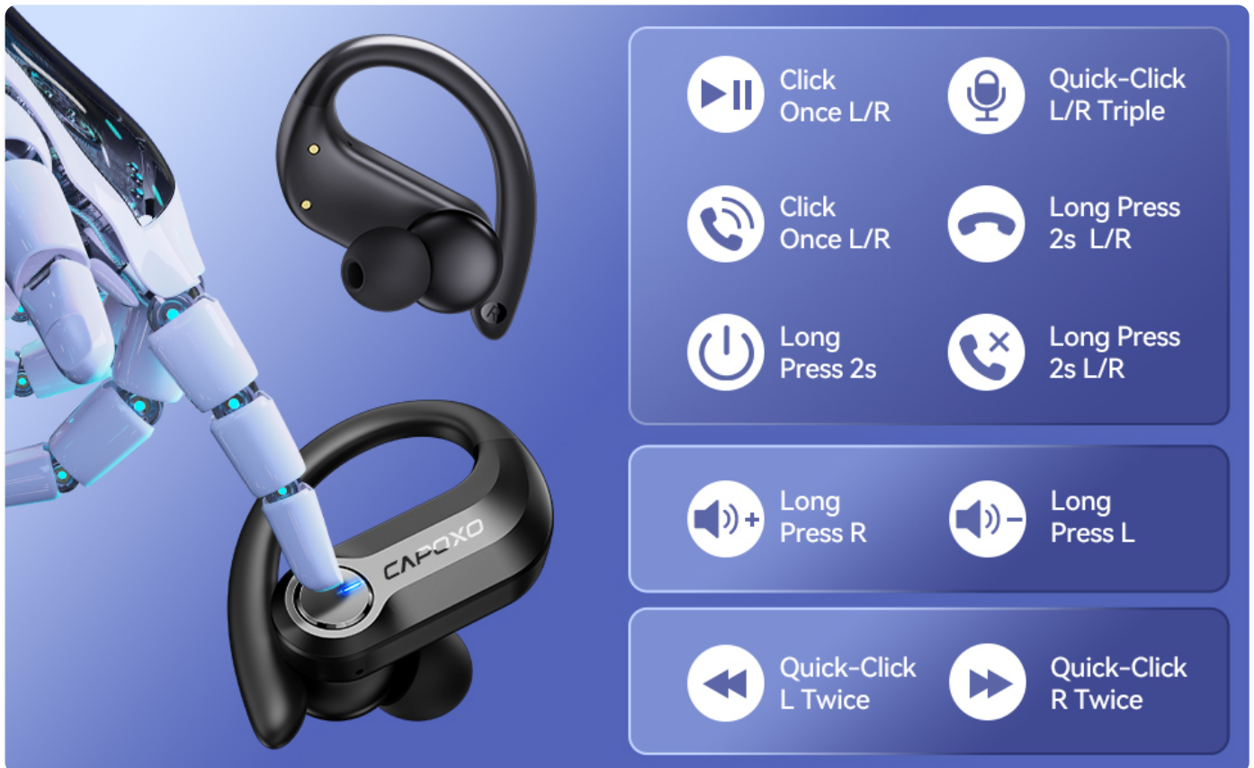
Image: A comprehensive guide to the on-device button controls for music playback, call handling, and activating voice assistants.