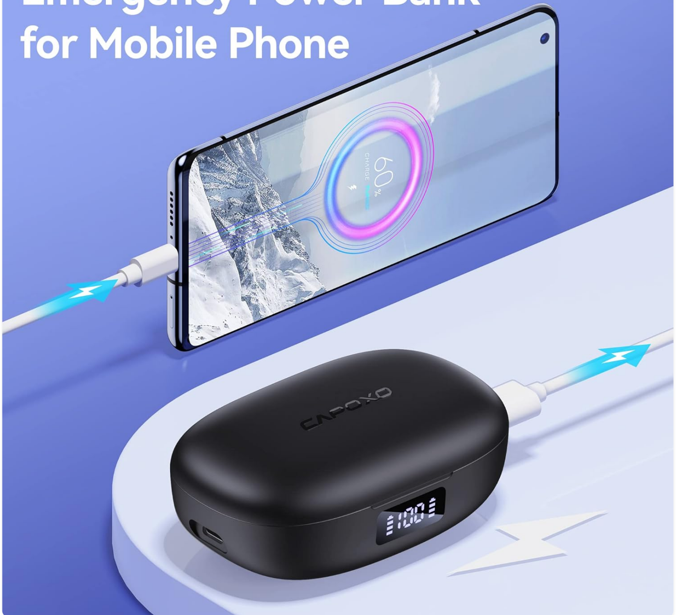
Image: The charging case being used as an emergency power bank to charge a smartphone.