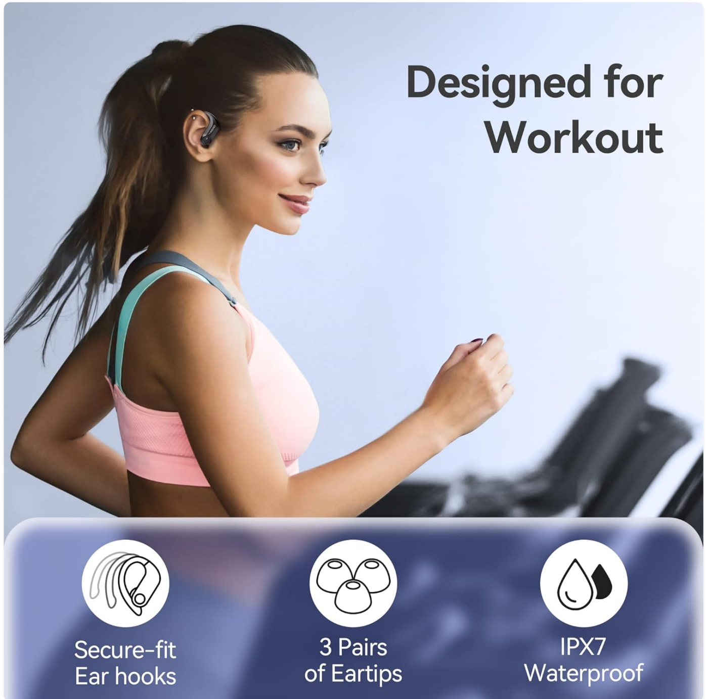
Image: The earbuds demonstrating their IPX7 waterproof capability, suitable for active use.