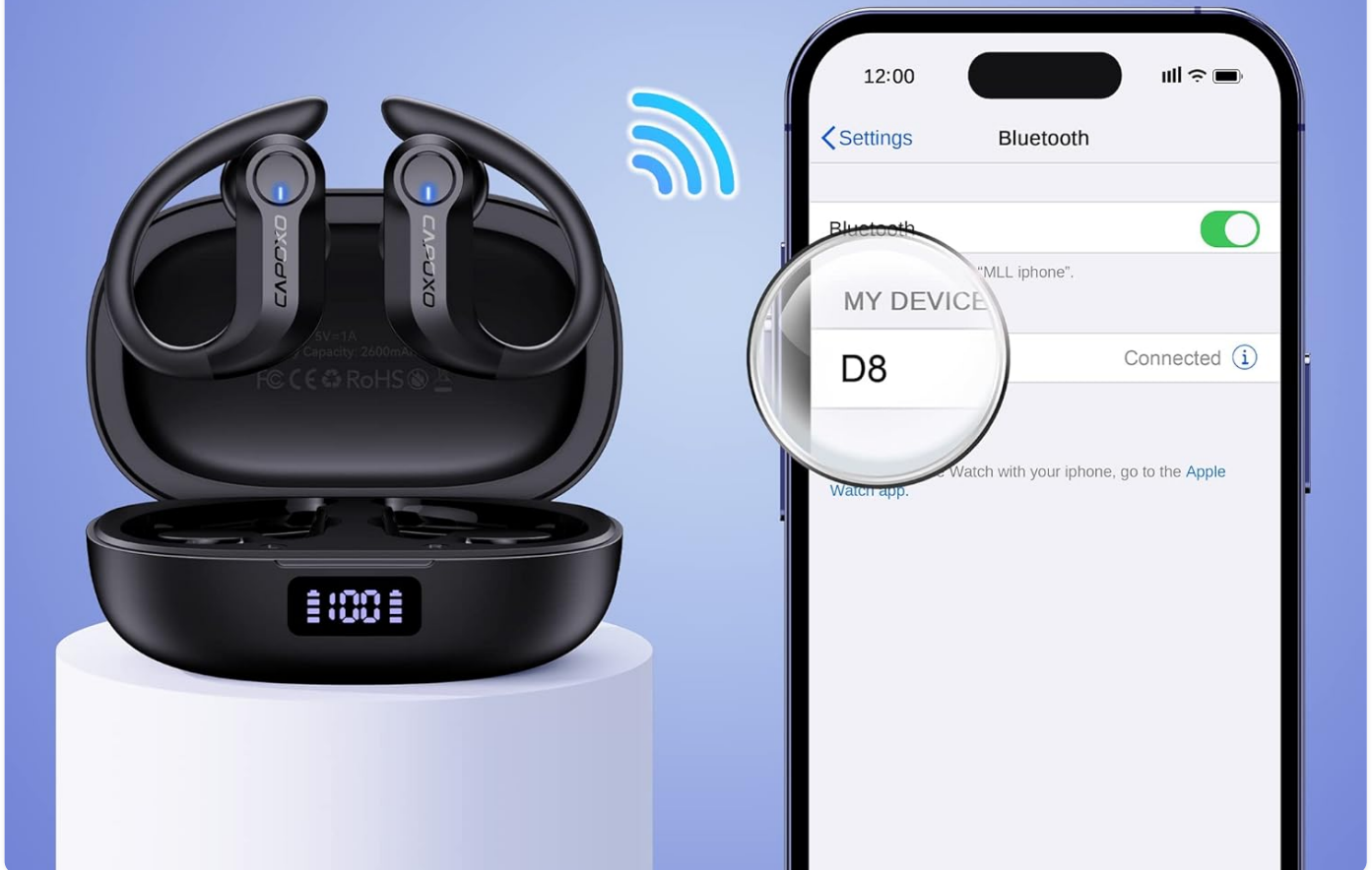
Image: A visual guide to the one-step auto pairing process, showing the earbuds in their case and the Bluetooth connection screen on a smartphone.