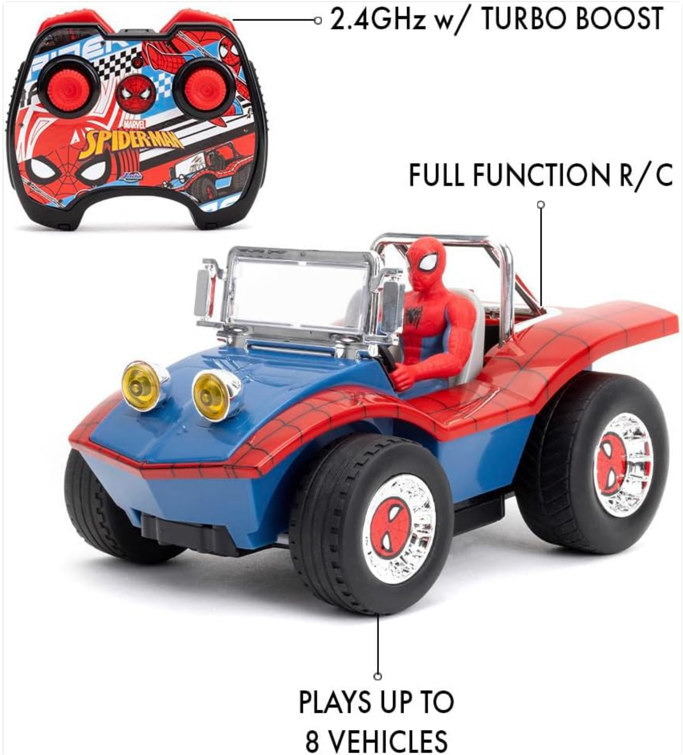
Image: The RC buggy and remote control with labels indicating "2.4GHz w/ TURBO BOOST", "FULL FUNCTION R/C", and "PLAYS UP TO 8 VEHICLES".