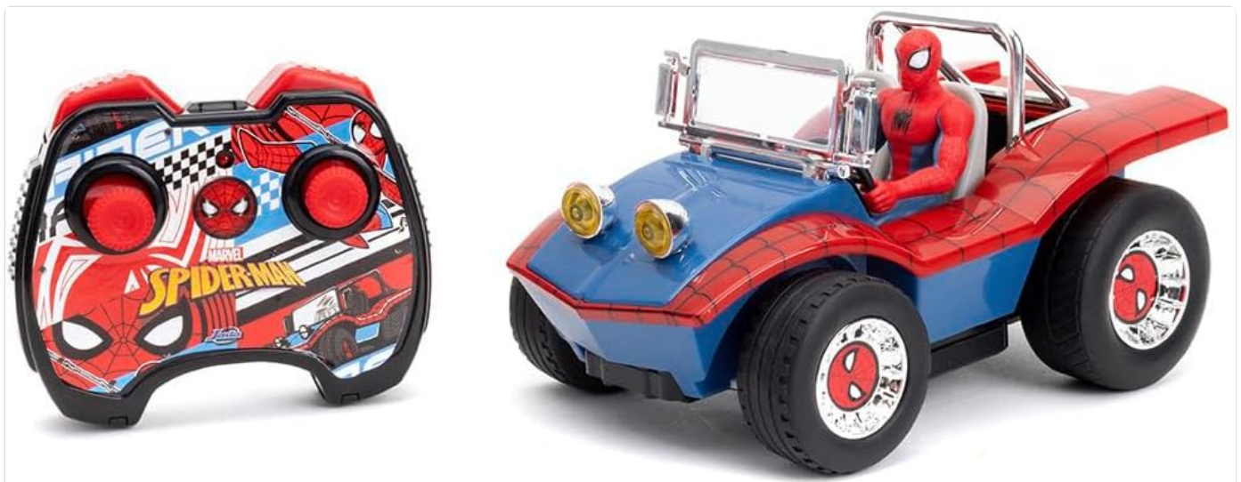
Image: The Spider-Man themed RC buggy and its accompanying remote control. The buggy is red and blue with Spider-Man details, and the remote control features Spider-Man graphics.

Immerse yourself in the world of your favorite hero, Spider-Man! This ergonomic and easy-to-use remote-controlled buggy, adorned with Spider-Man's colors, is sure to delight. Take control of this 1:24 scale car and practice to become the best race car driver! Thanks to the remote control with full driving functions and a turbo function, you can win all races! You can steer your car as you wish: move it forward, turn it right and left, and also make it go backward in a straight line or to the left and right. It operates on 2.4GHz technology and includes batteries. Suitable for ages 6 and up.