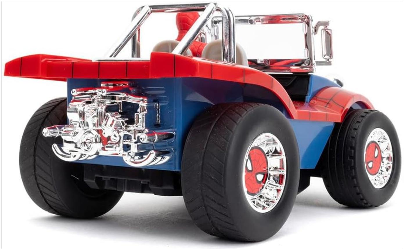
Image: A rear view of the Spider-Man RC buggy, highlighting the detailed rear engine design and large wheels.

The 2.4 GHz technology allows for multiple RC vehicles to be used in the same area without signal interference. Ensure both the vehicle and remote are powered on to establish connection.