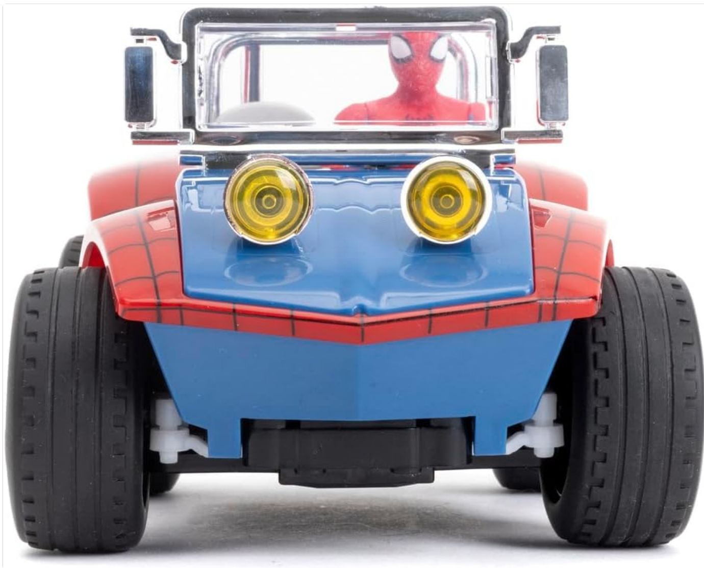
Image: A direct front view of the Spider-Man RC buggy, showcasing its blue hood and red fenders with yellow headlights.