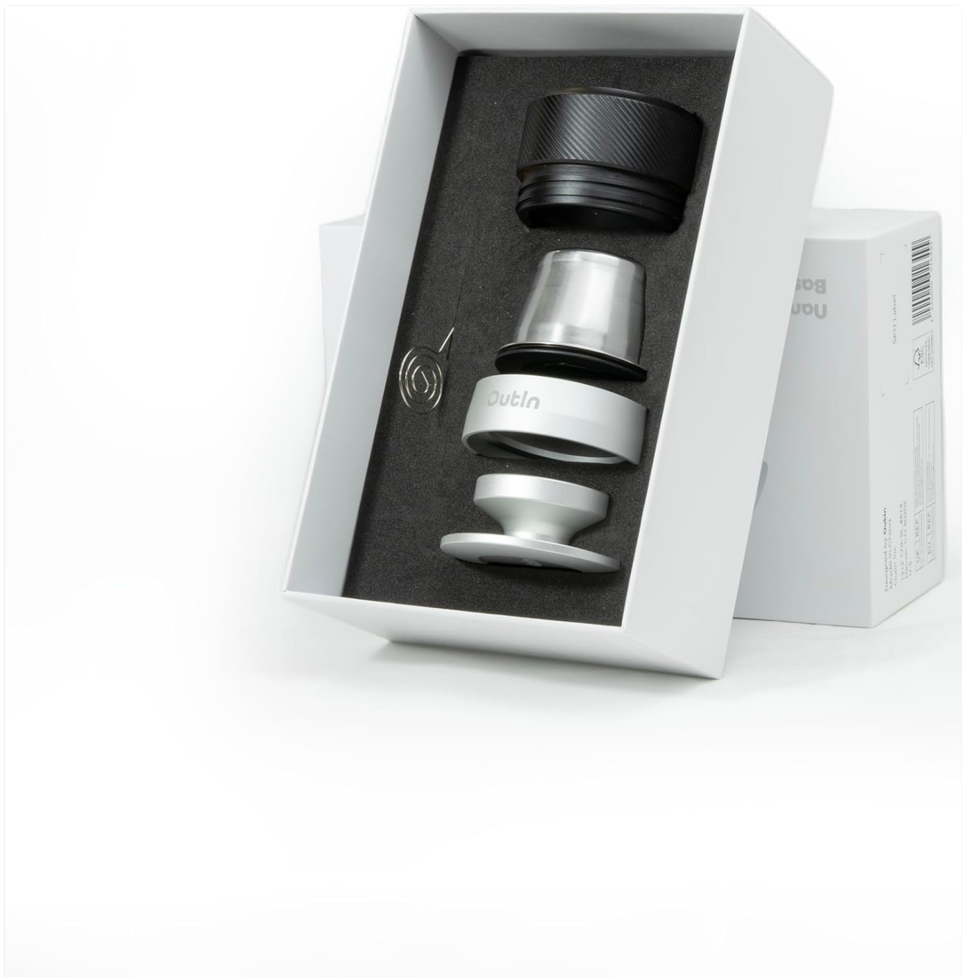
Figure 2.1: Outin Nano Espresso Accessories Kit as packaged.