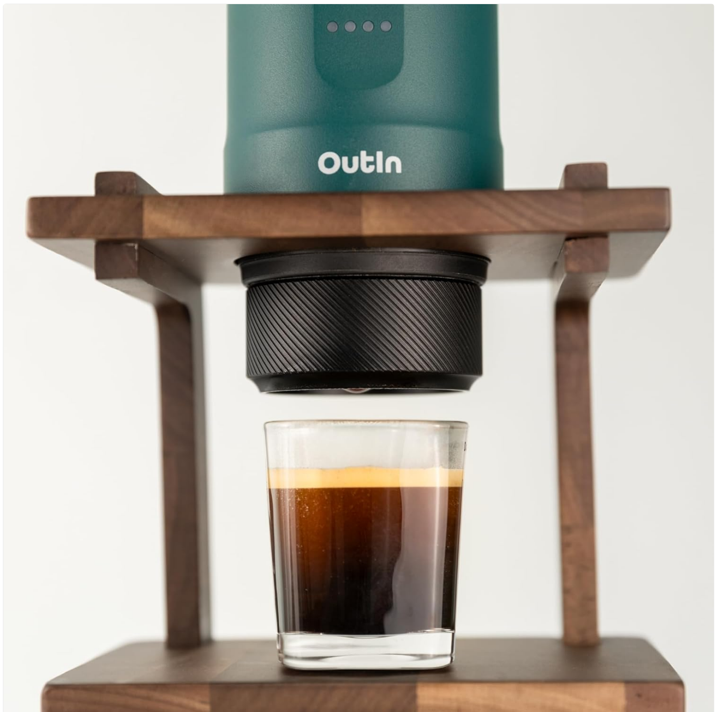
Figure 4.2: Espresso extraction using the Outin Nano Espresso Maker with accessories.