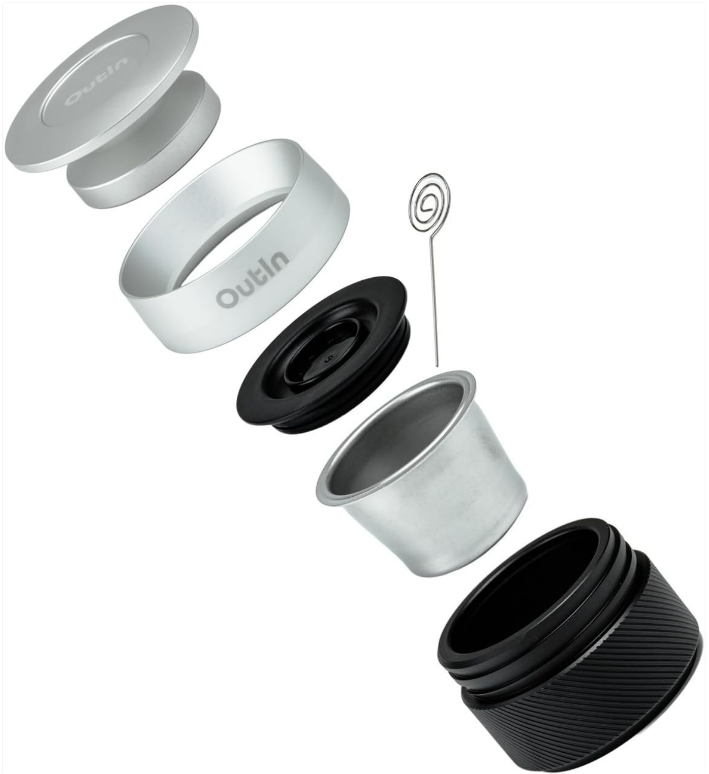
Figure 2.2: Exploded view of the Outin Nano Espresso Accessories Kit components, showing the distributor, tamper, doser, basket, and shower screen.