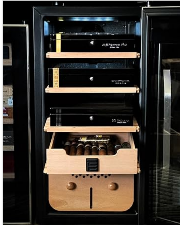
Image: Interior view of the KingChii 43L humidor, highlighting the Spanish cedar wood shelves and drawers.