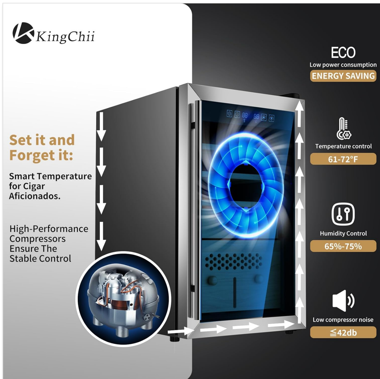
Image: The KingChii 43L Electric Cigar Humidor, showcasing its exterior and internal components like cedar shelves and drawers.