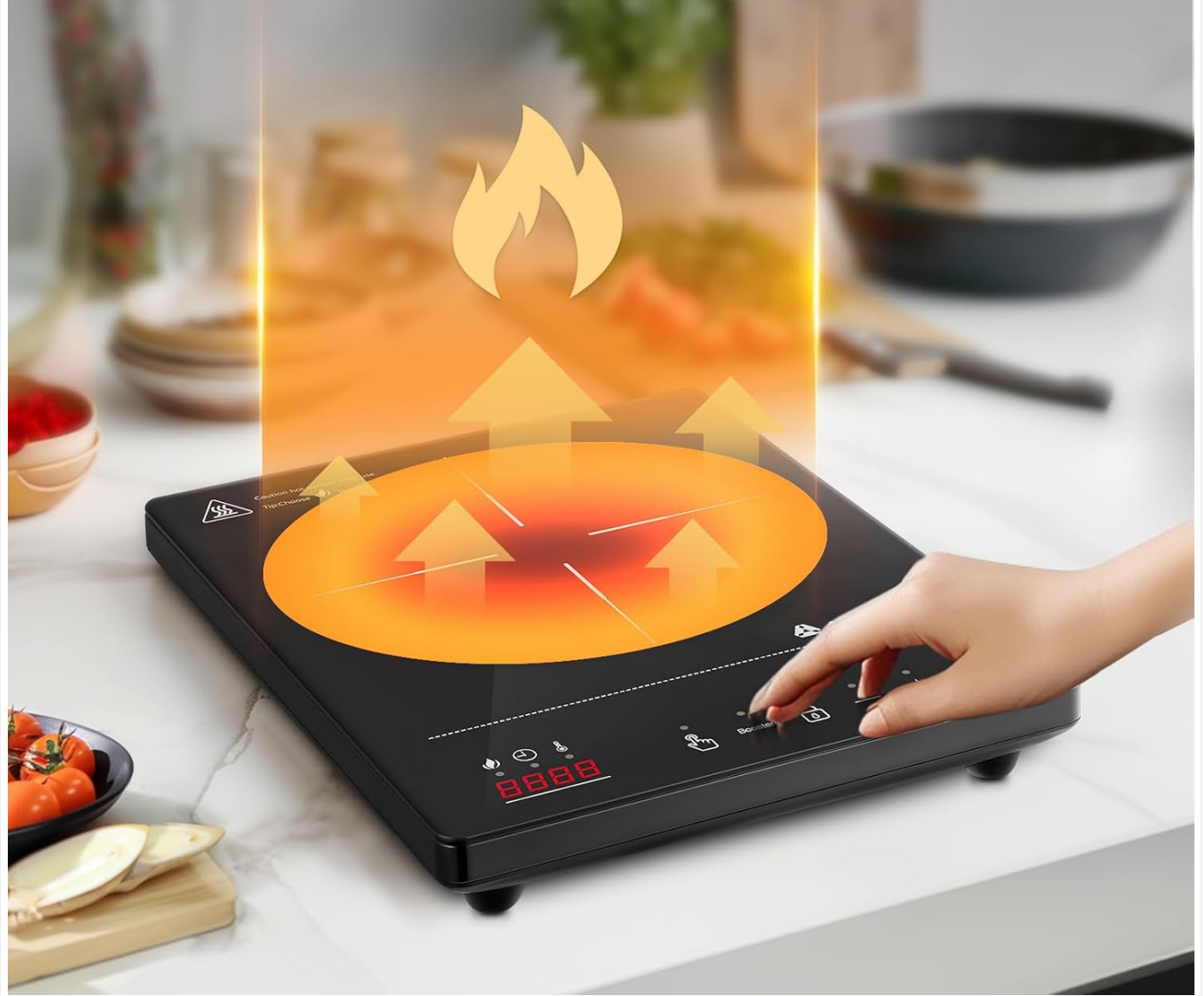
Image: The cooktop with a visual representation of the Booster function, showing intense heat for quick cooking.