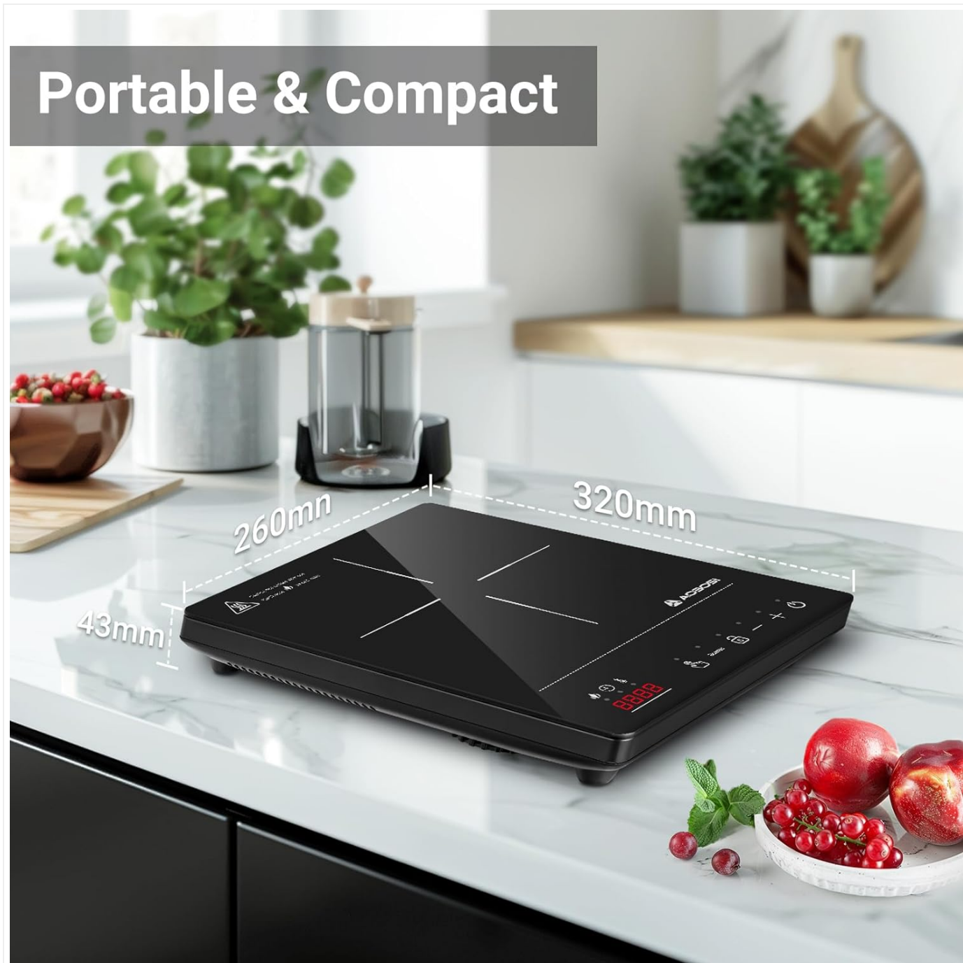
Image: The cooktop positioned on a kitchen counter, demonstrating its portable and compact size with dimensions labeled.