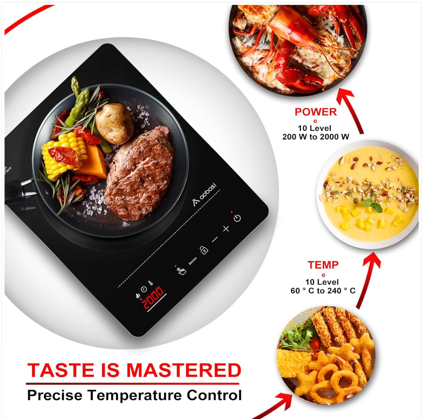
Image: The cooktop demonstrating its precise temperature control capabilities, with visual indicators for power and temperature ranges.