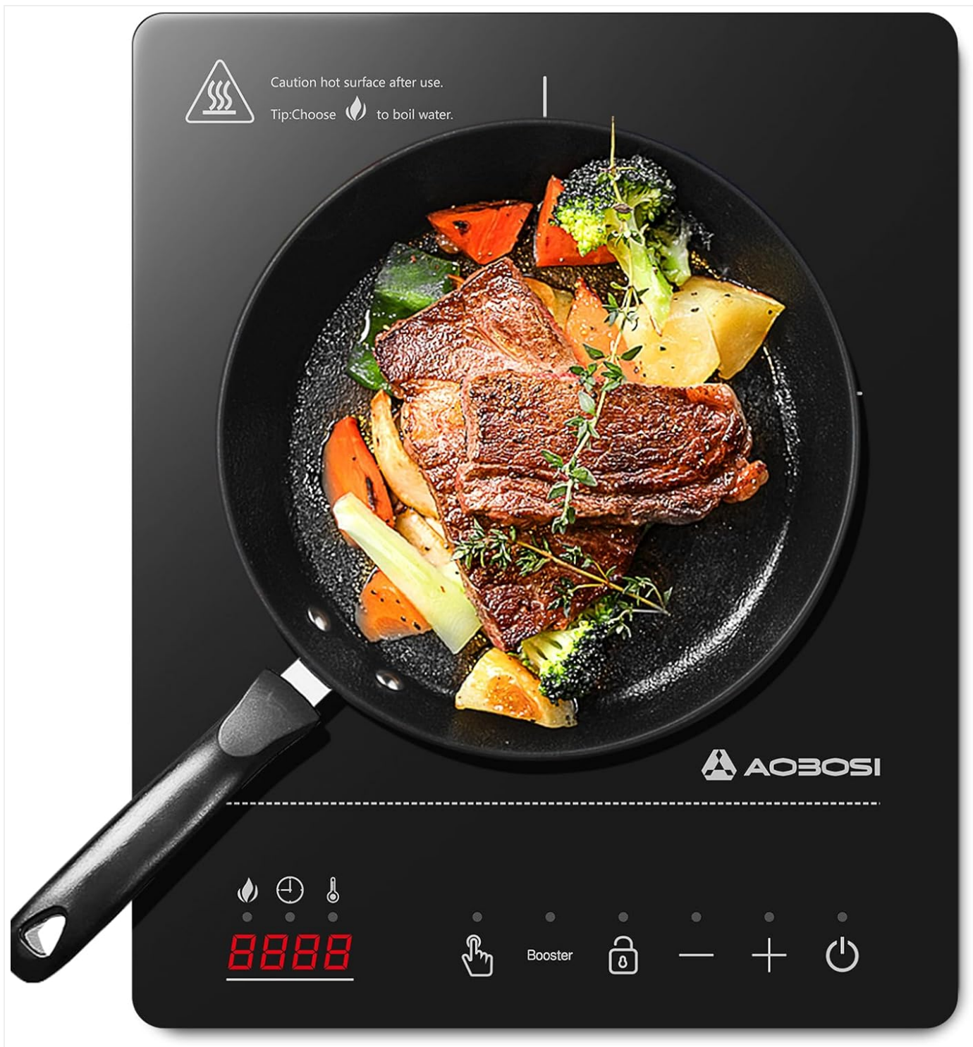
Image: The AAOBOSI Portable Induction Cooktop in use, showcasing its sleek design and a pan with a cooked meal.