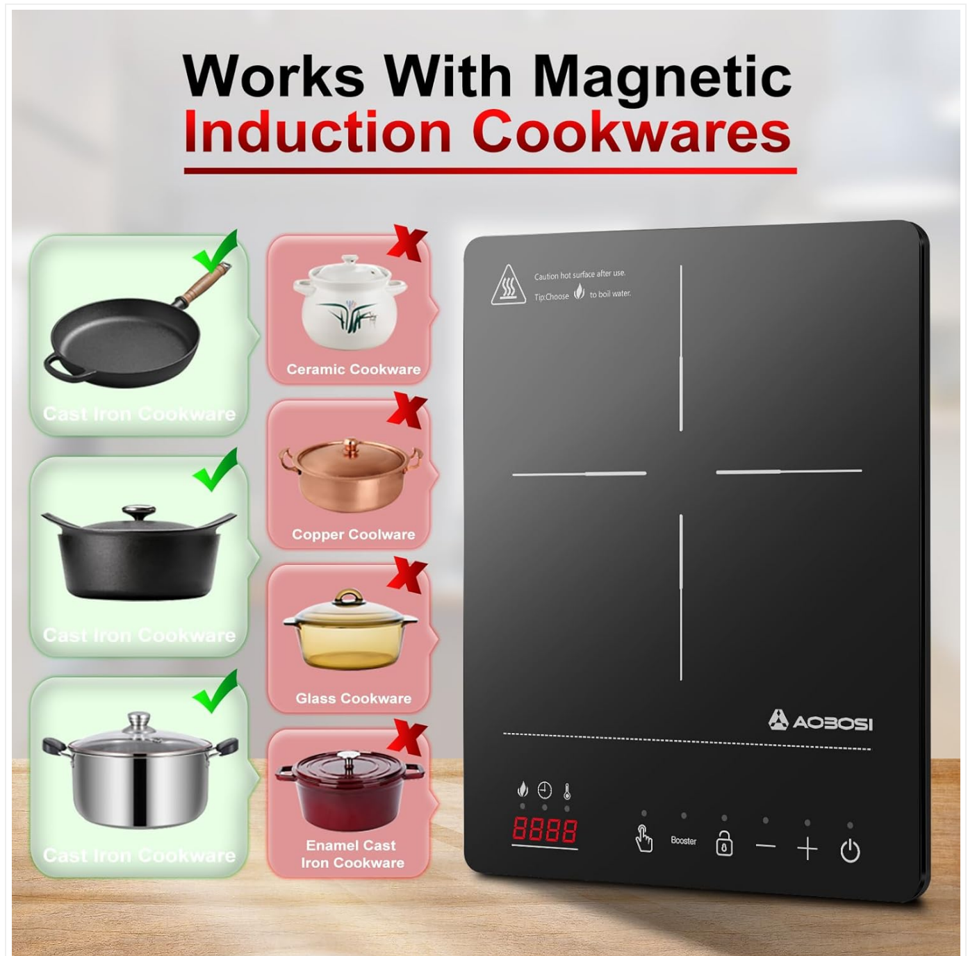
Image: A visual guide to induction-compatible cookware, showing examples of suitable (cast iron, stainless steel) and unsuitable (ceramic, copper, glass) materials.

Cookware NOT compatible with induction cooktops includes ceramic, copper, glass, and aluminum (unless specifically designed for induction).