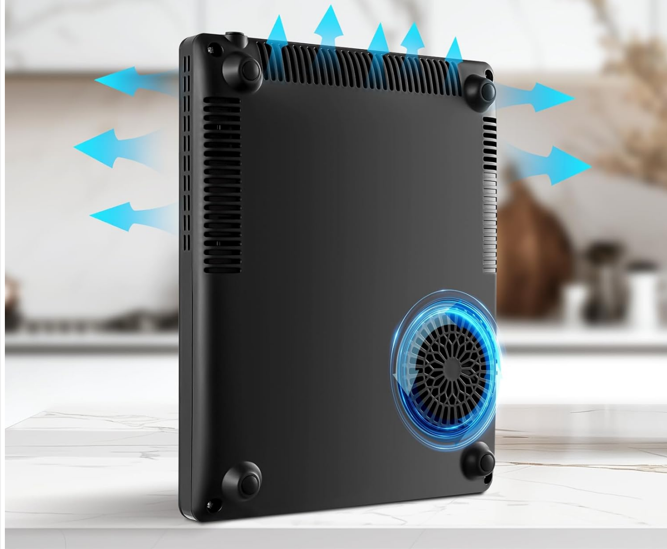
Image: The underside of the cooktop, illustrating its cooling system with air vents and a fan for efficient heat dissipation and low noise operation.

Operating noise \leq 61\text{db} Fan noise \leq 45\text{db}