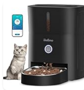
Image: App interface displaying the meal scheduling calendar, allowing users to set specific times and portions for daily feedings.