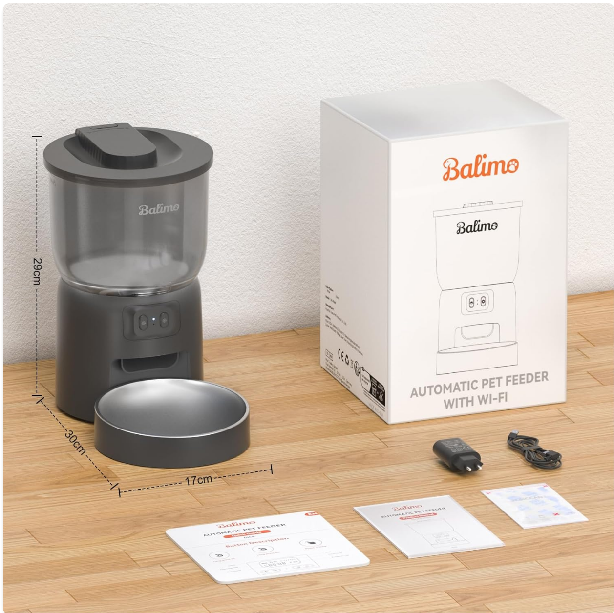
Image: Overview of the Balimo Automatic Pet Feeder, its packaging, and included accessories, along with key dimensions.