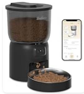
Image: App interface showing the device detection and 'Add' button for pairing.