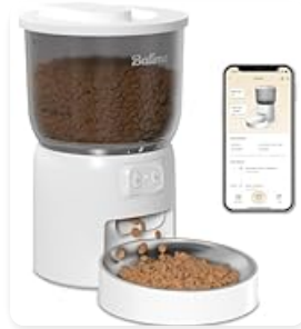
Image: App interface for Wi-Fi setup, indicating support for 2.4GHz networks only.