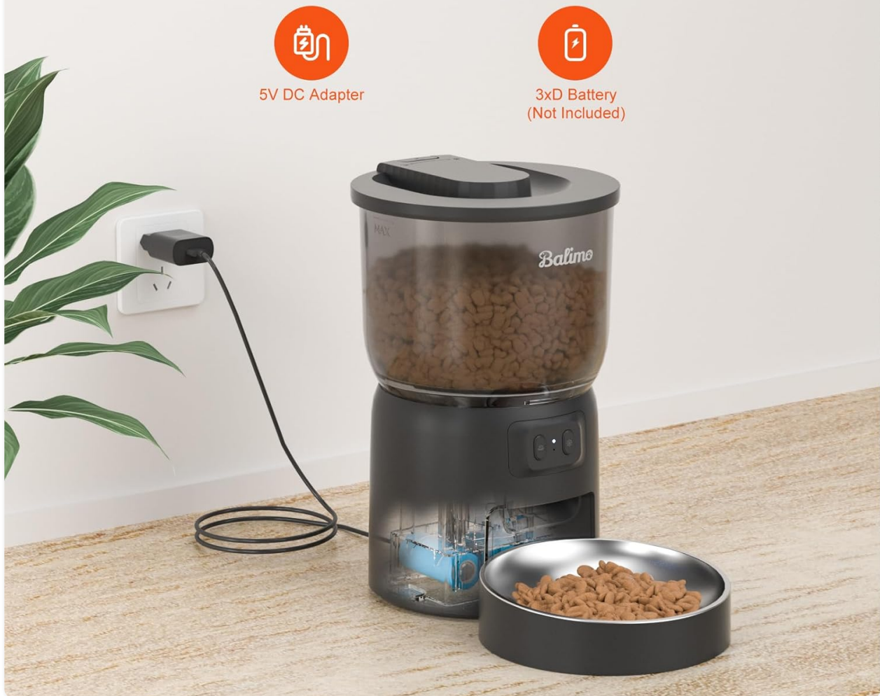
Image: The pet feeder connected to an AC power outlet, illustrating the dual power supply capability with an option for D-size batteries.

Never miss a meal even during unexpected power outage