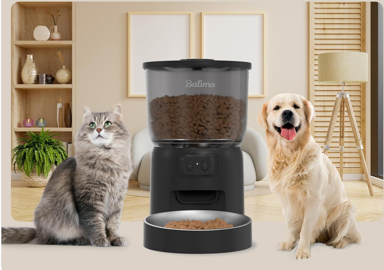
Image: The pet feeder positioned between a cat and a dog, highlighting its capacity (3L) and customizable feeding options (1-10 meals/day, 1-15 portions/meal).