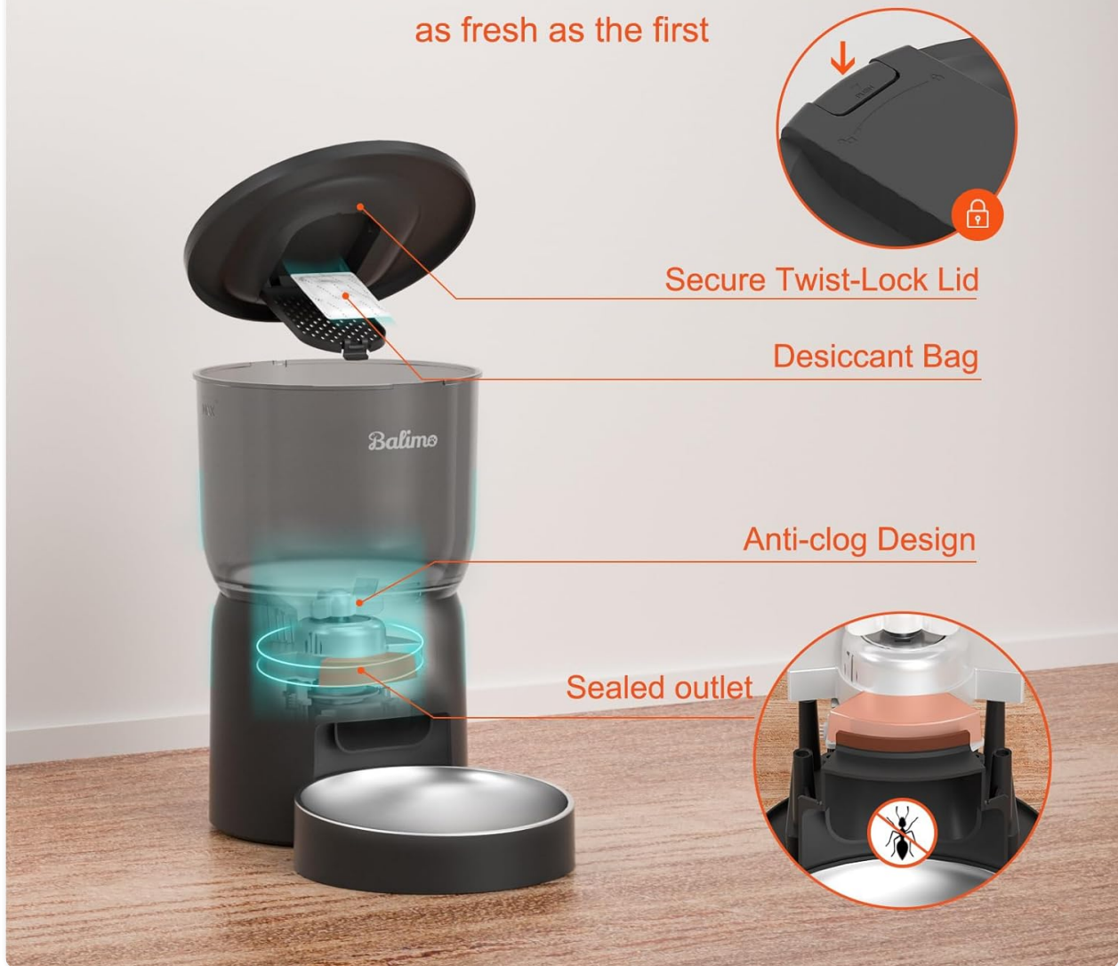
Image: Diagram illustrating the feeder's triple sealing features, including the secure twist-lock lid, desiccant bag compartment, anti-clog design, and sealed outlet for food freshness.

Lock in freshness, keep out moisture, and keep every bite as fresh as the first