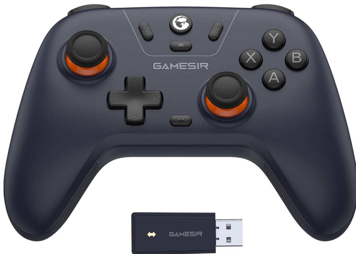
The GameSir Nova Lite controller shown with its accompanying 2.4G USB dongle.