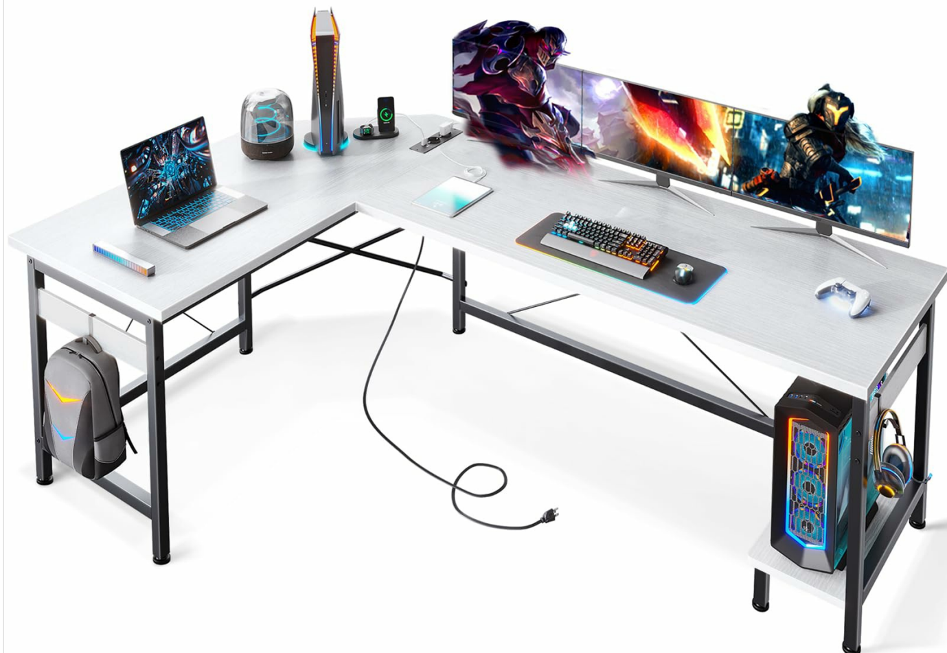
Image: The ODK Corner Desk configured for a comprehensive gaming and work setup, showcasing its spacious L-shaped design and integrated features.