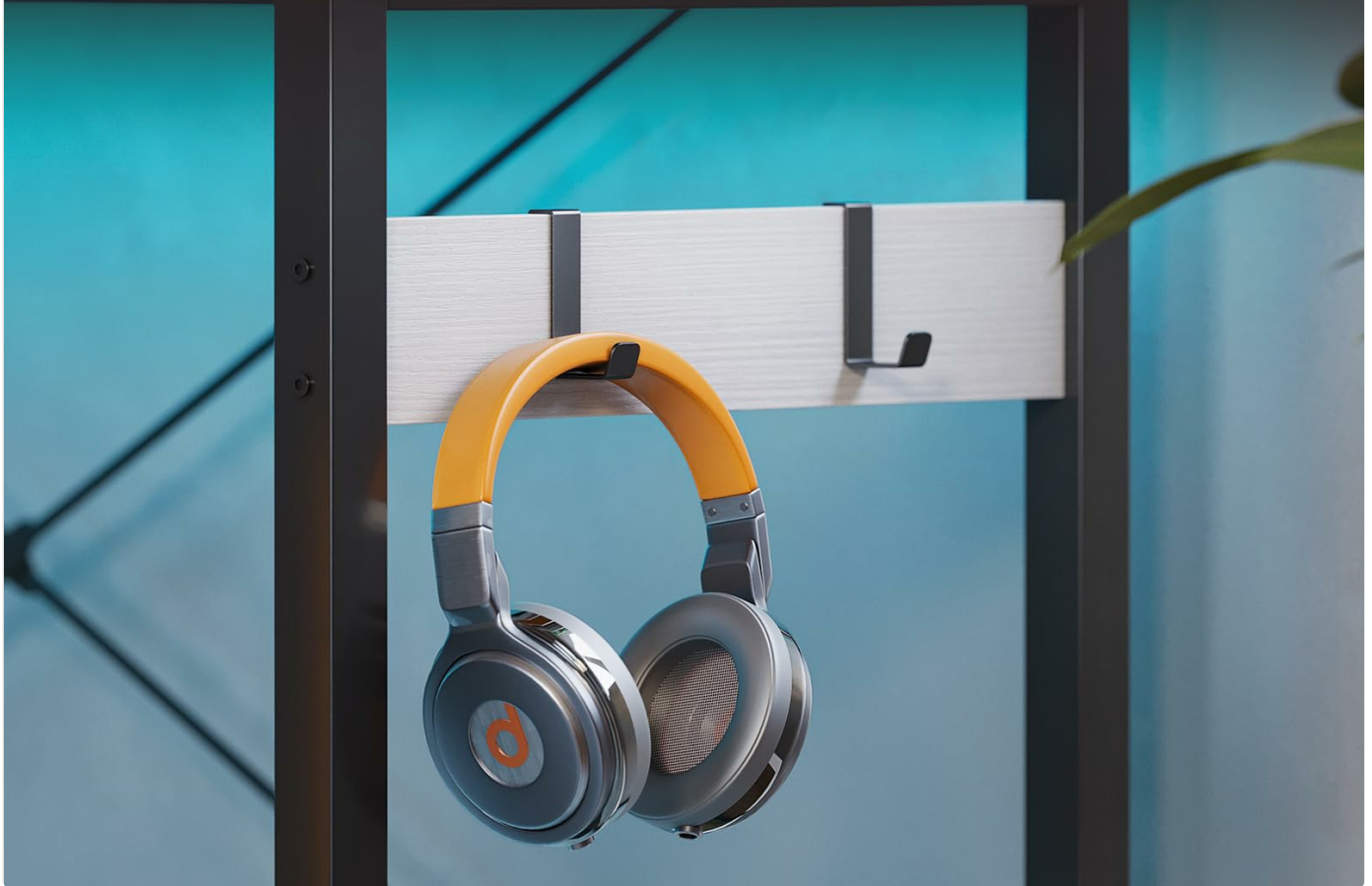
Image: The sturdy iron hook designed for hanging headphones, promoting a tidy workspace.