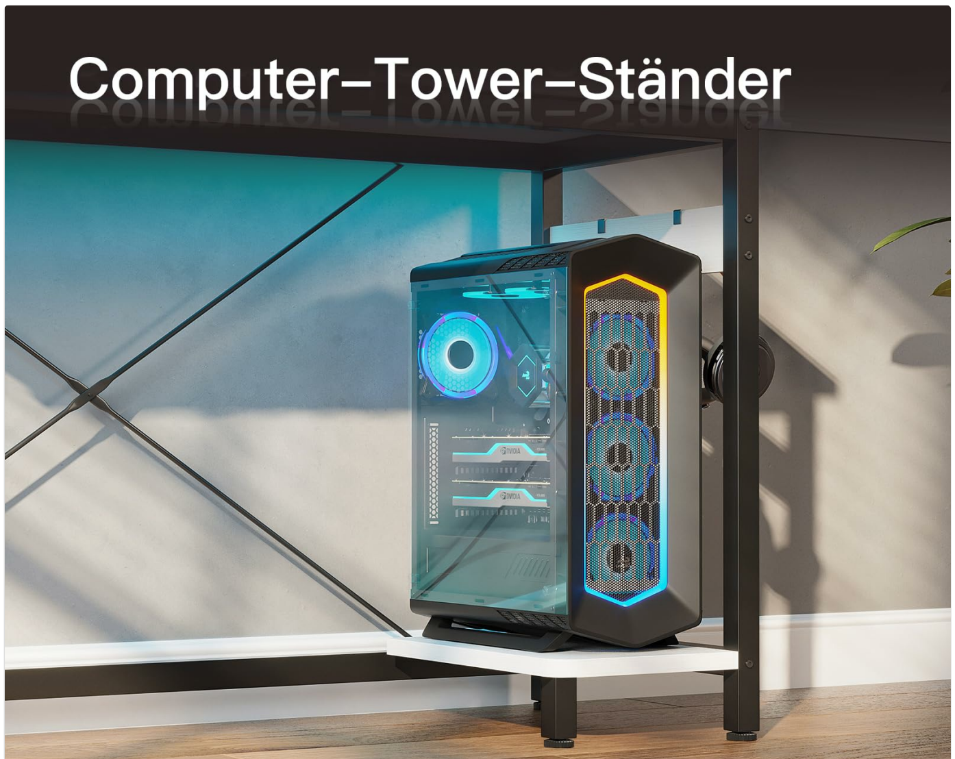
Image: The dedicated CPU stand, providing a stable and accessible location for your computer tower.

A dedicated CPU stand is integrated into the desk's design, allowing for convenient and organized placement of your computer tower.