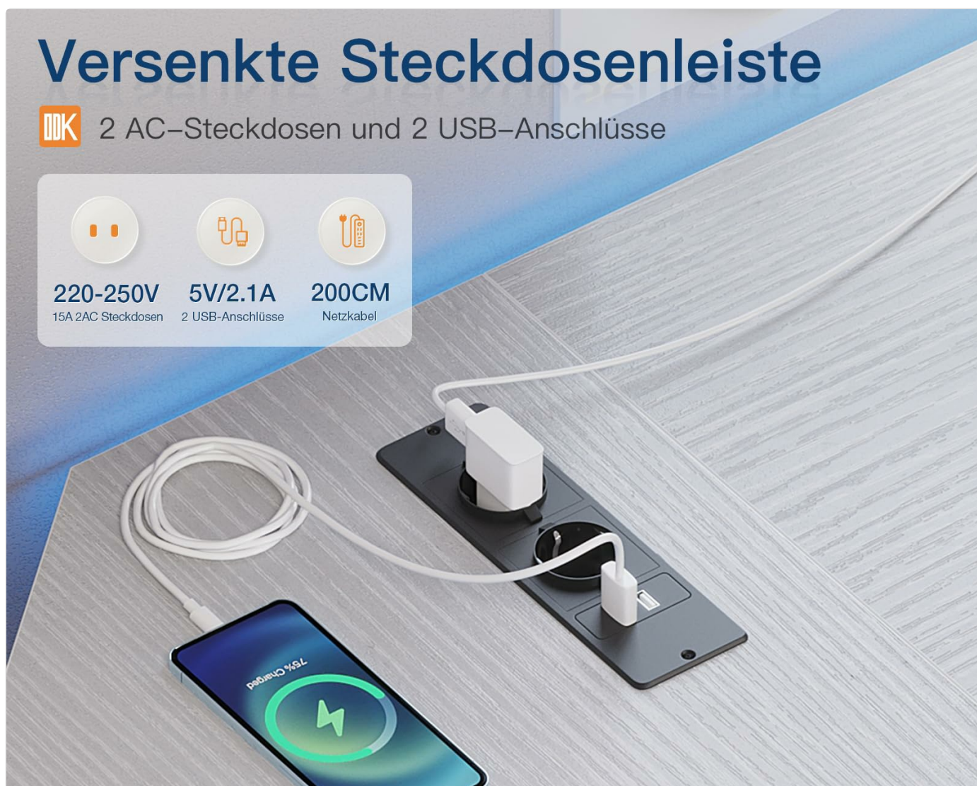
Image: A detailed view of the desk's integrated power strip, highlighting the AC sockets and USB charging ports in use.

The ODK Corner Desk features a built-in power strip with 3 standard AC sockets and 2 USB charging ports, providing convenient access to power for your electronic devices.