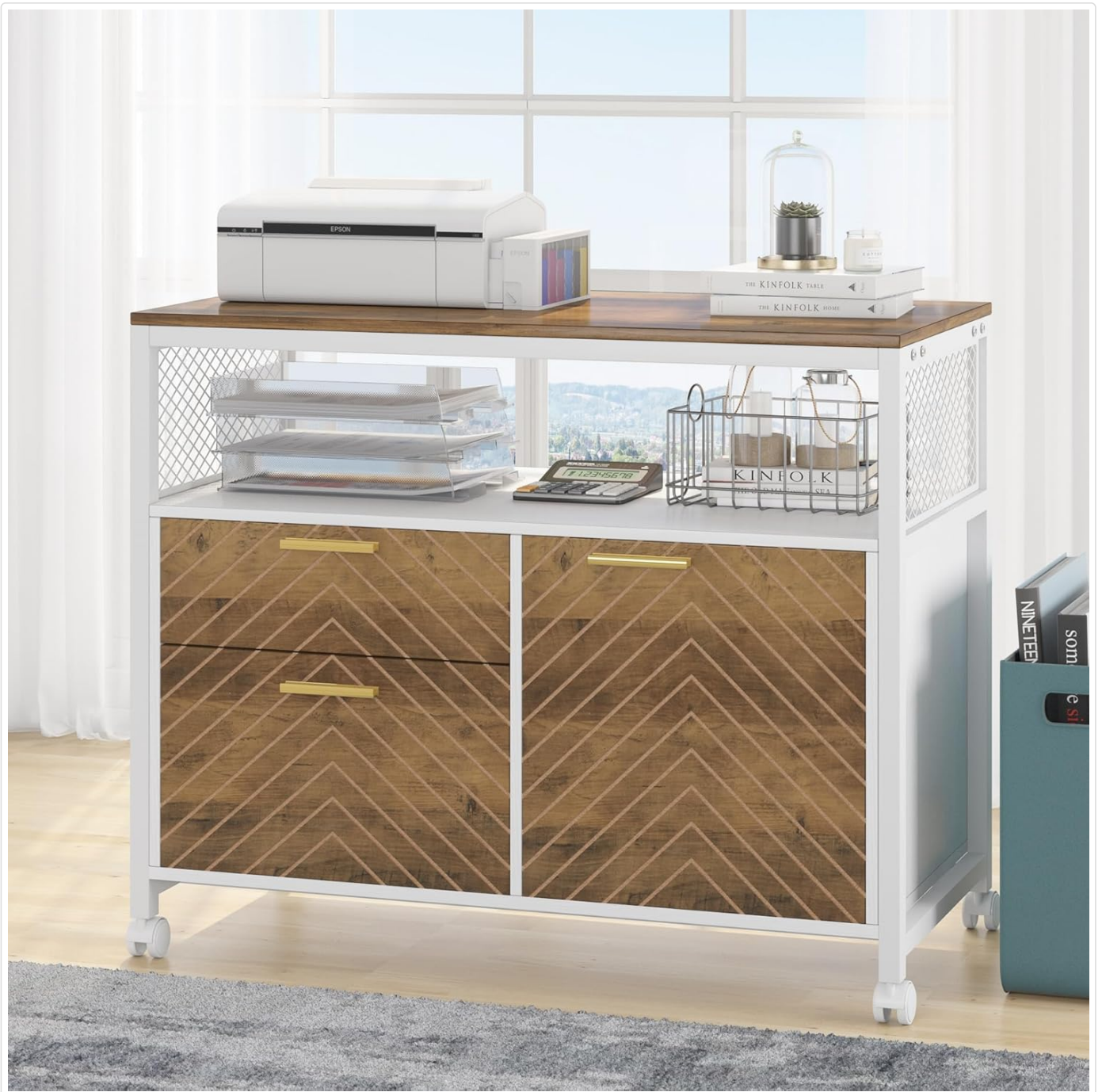
Image: The standalone mobile file cabinet, featuring a top shelf, an open storage area, two drawers, and a cabinet door for concealed storage.