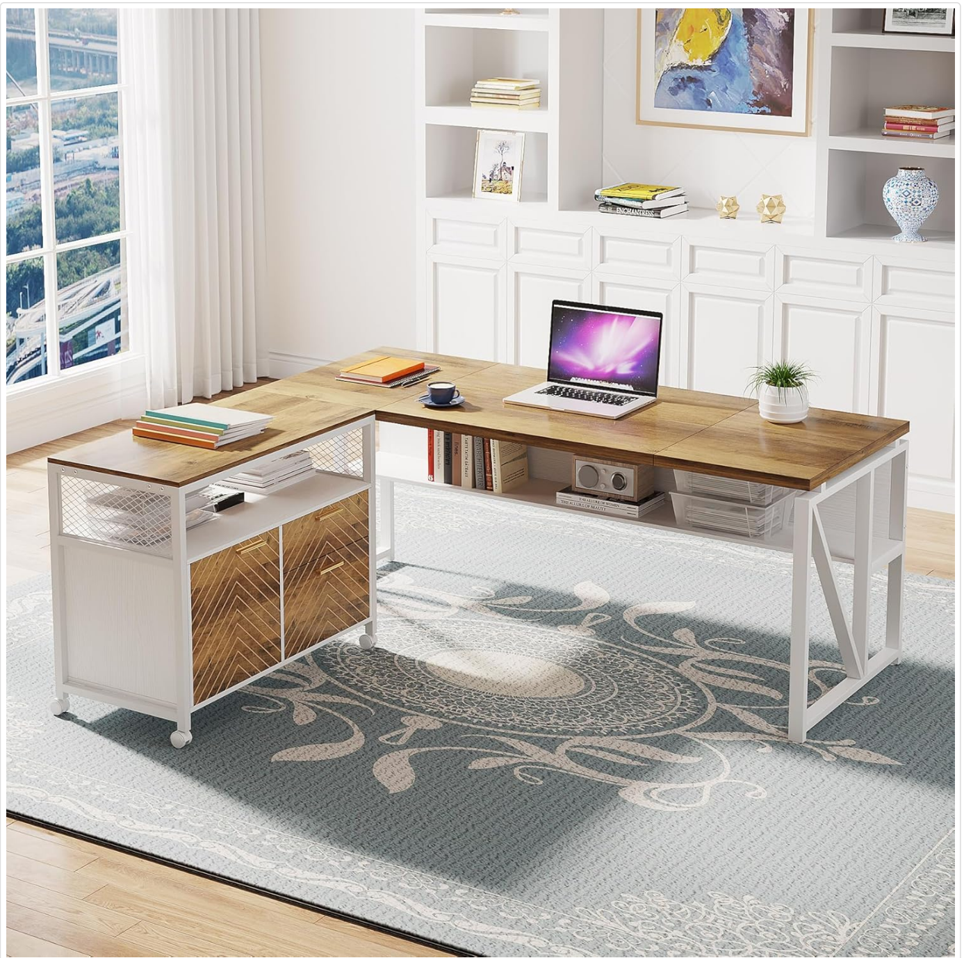
Image: The L-shaped desk setup, demonstrating how the mobile file cabinet seamlessly integrates to extend the workspace and provide convenient storage.