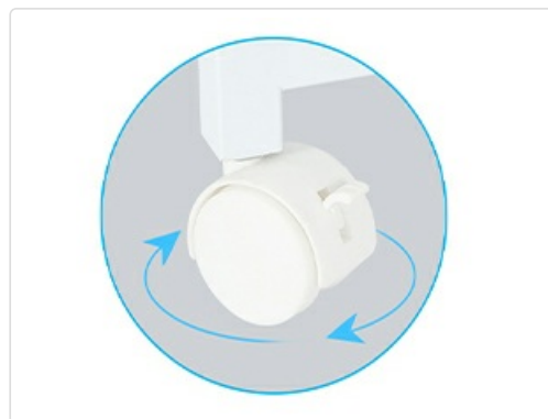
Image: A detailed view of one of the rolling casters, which allows the file cabinet to be easily moved and locked into position.