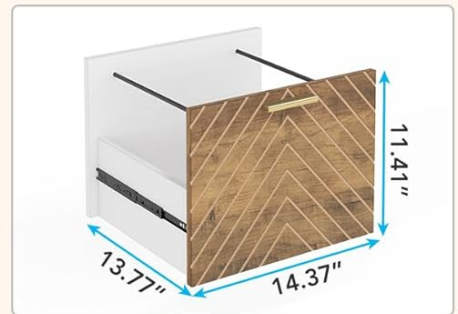
Letter Size Drawer