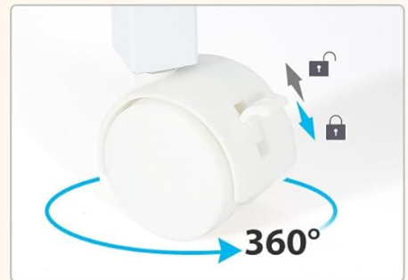
360° Swivel Lockable Casters