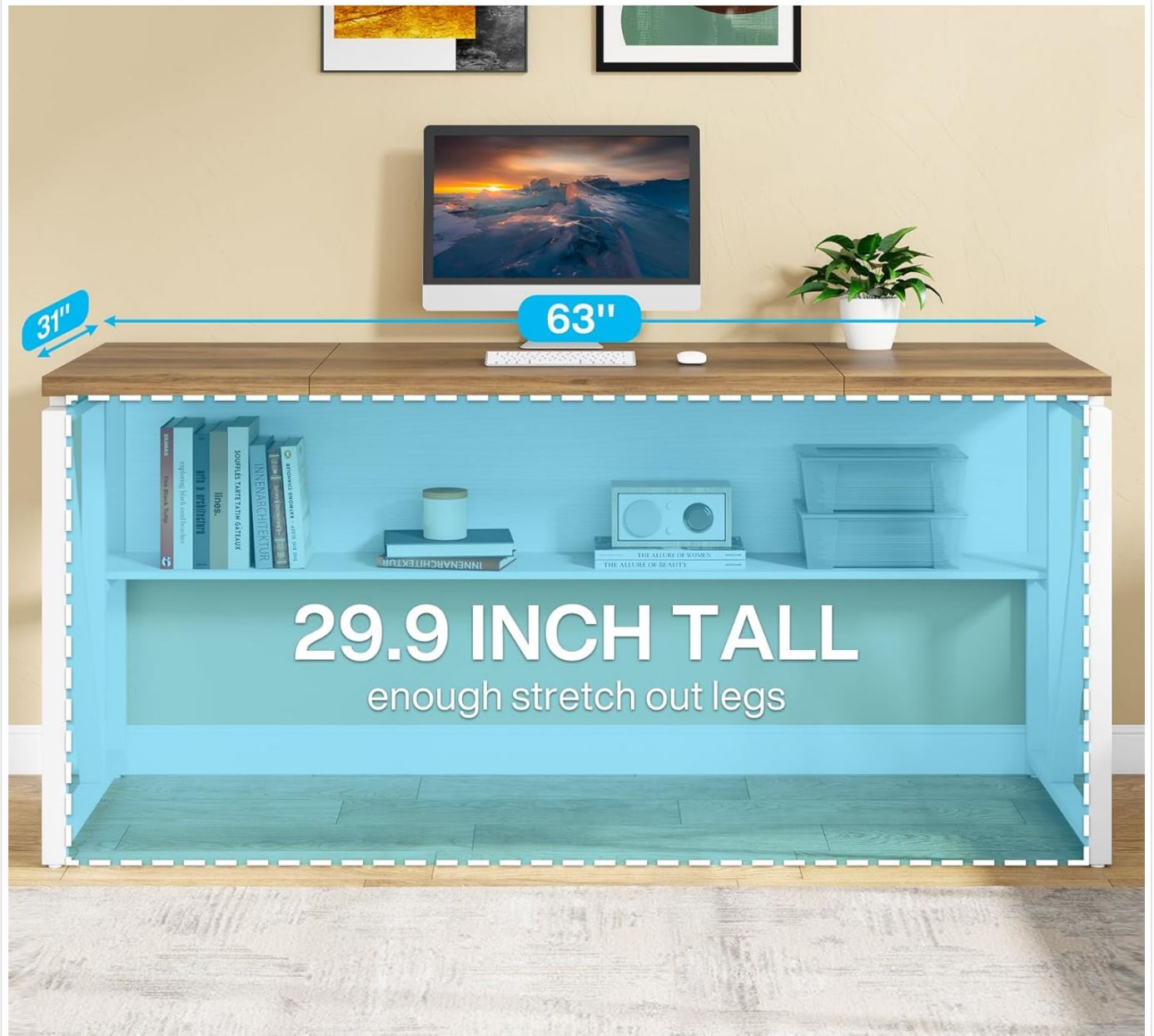
Image: The generous dimensions of the desk provide a comfortable and expansive work area, with 29.9 inches of height for legroom.