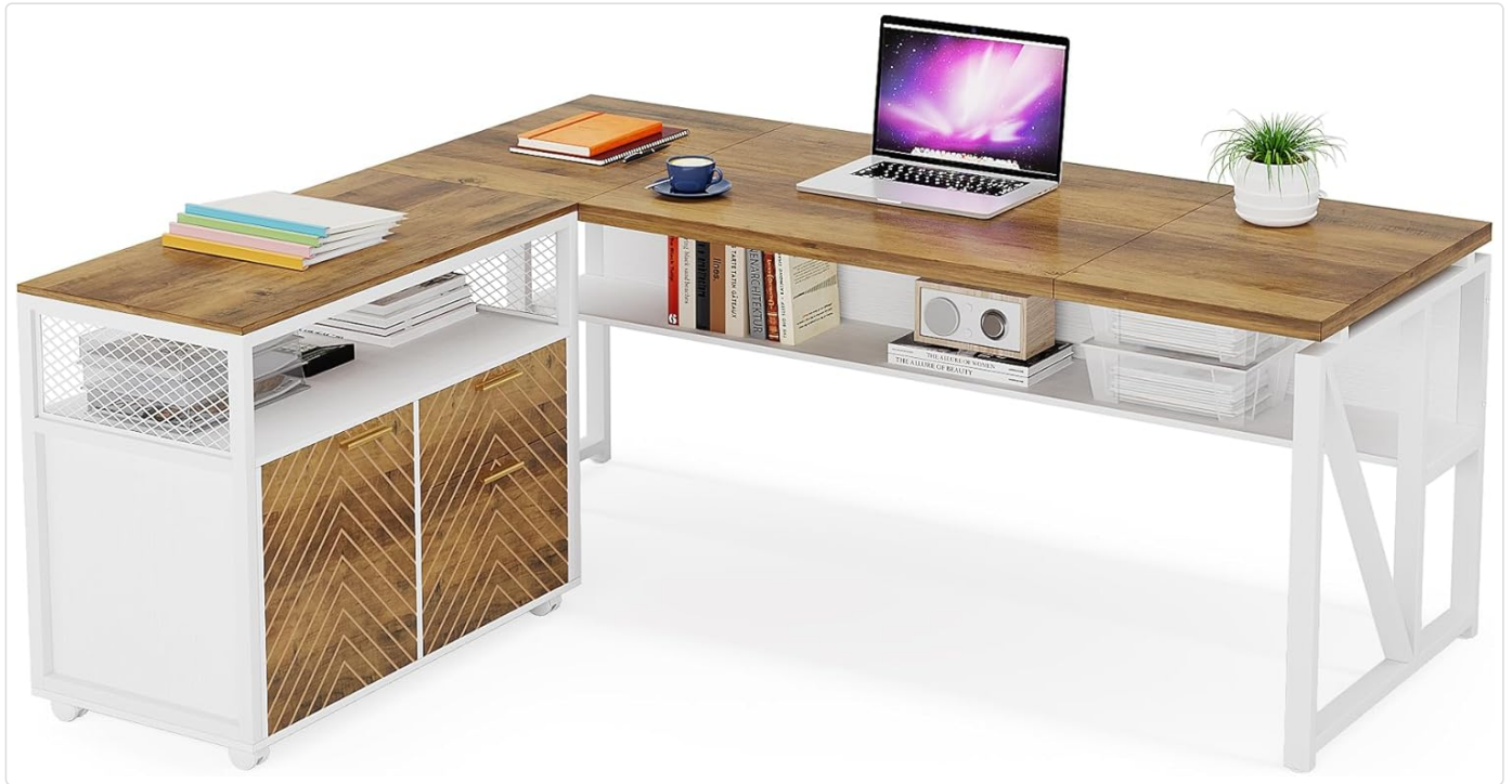
Image: The L-shaped desk and mobile file cabinet arranged to create a comprehensive and functional workspace.