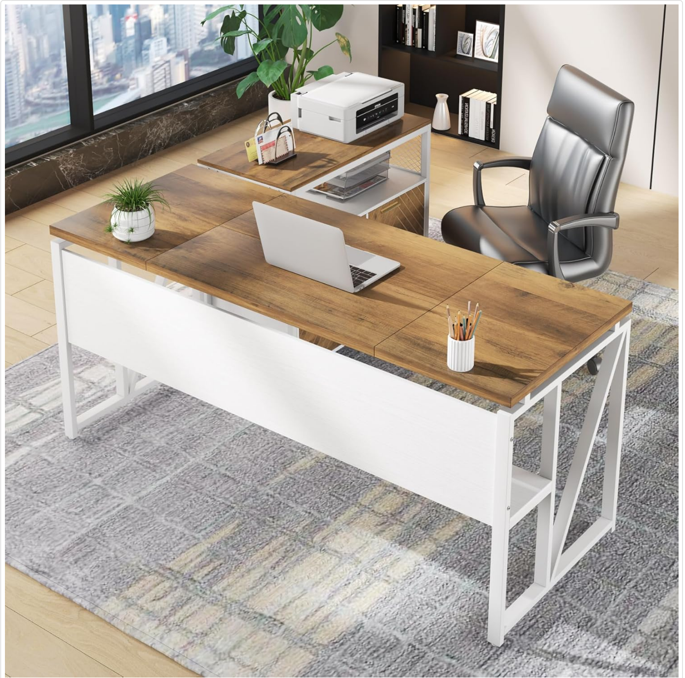
Image: The completed L-shaped desk with its spacious light walnut desktop, showcasing its modern design and ample work surface.