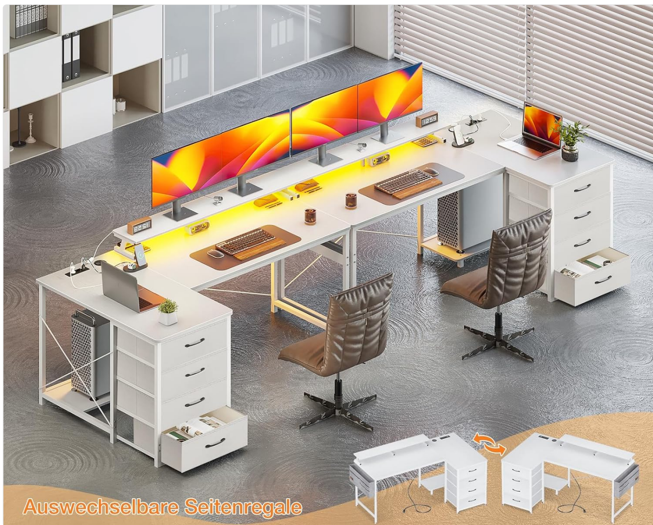
Image: Overview of the ODK L-Shaped Desk setup, showing the main desk sections, monitor stands, and integrated drawer units. Note the reversible design of the side shelves.