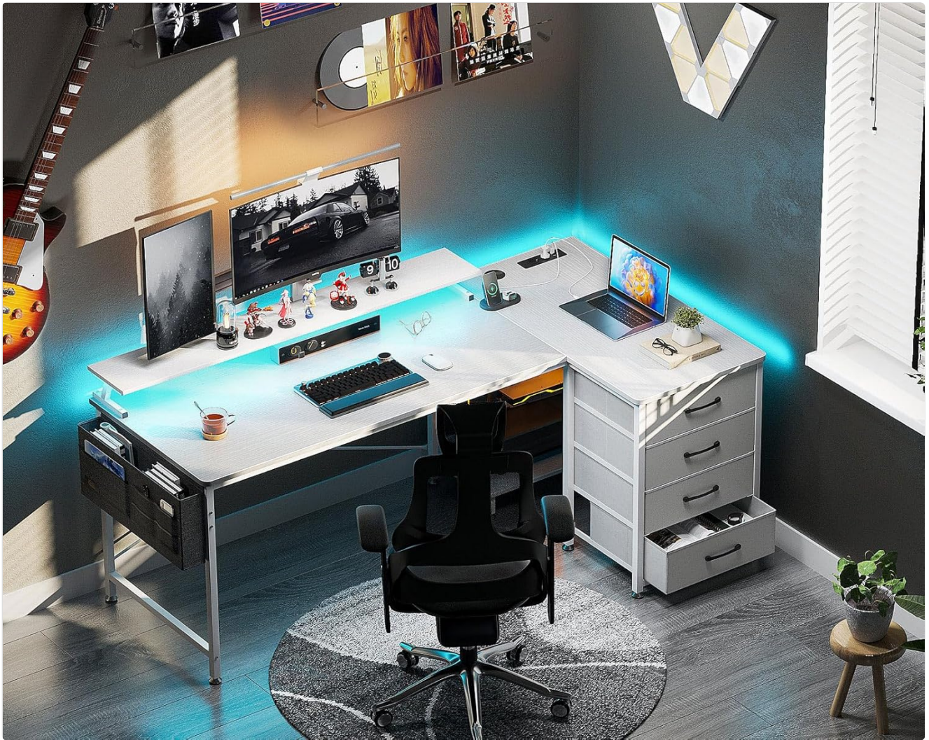
Image: Visual comparison demonstrating the flexibility of the drawer unit. It can be integrated under the desk for storage or used as a side cabinet, providing space for a PC tower under the desk.