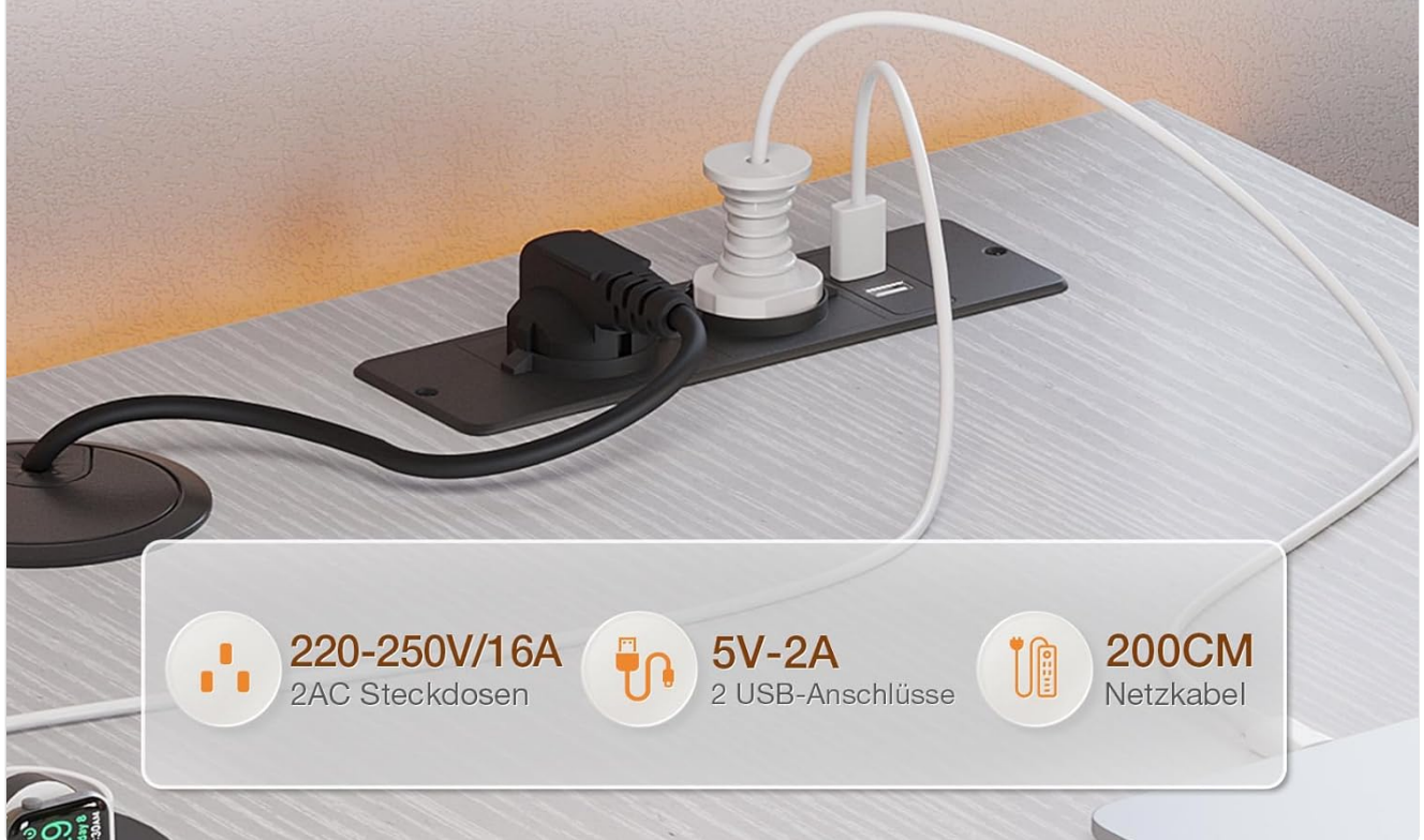
Image: Detailed view of the recessed power strip, highlighting its two AC outlets and two USB charging ports. Specifications for voltage, amperage, and cable length are also shown.

| Mit 2 Steckdosen und 2 USB-Anschlüssen