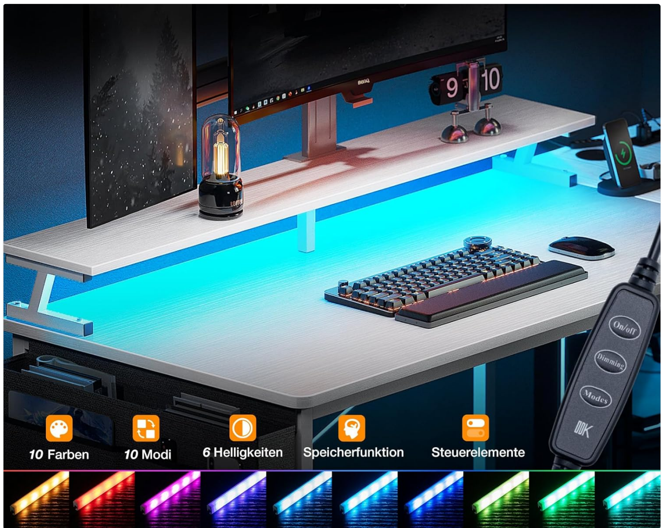
Image: Close-up of the LED light strip and its wired controller, illustrating the available functions: On/Off, Dimming, Modes, and Color selection. The image also shows various color outputs.