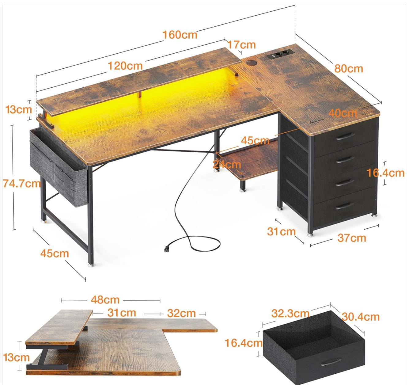
Image: A visual representation demonstrating the reversible design of the desk's storage unit, allowing it to be configured on either the left or right side of the L-shape.