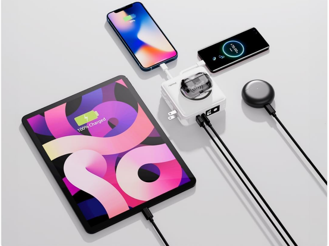
Image: The PWR Travel PRO Power Bank actively charging a tablet, two smartphones (one wirelessly, one via cable), and another small device, demonstrating its multi-device charging capability.