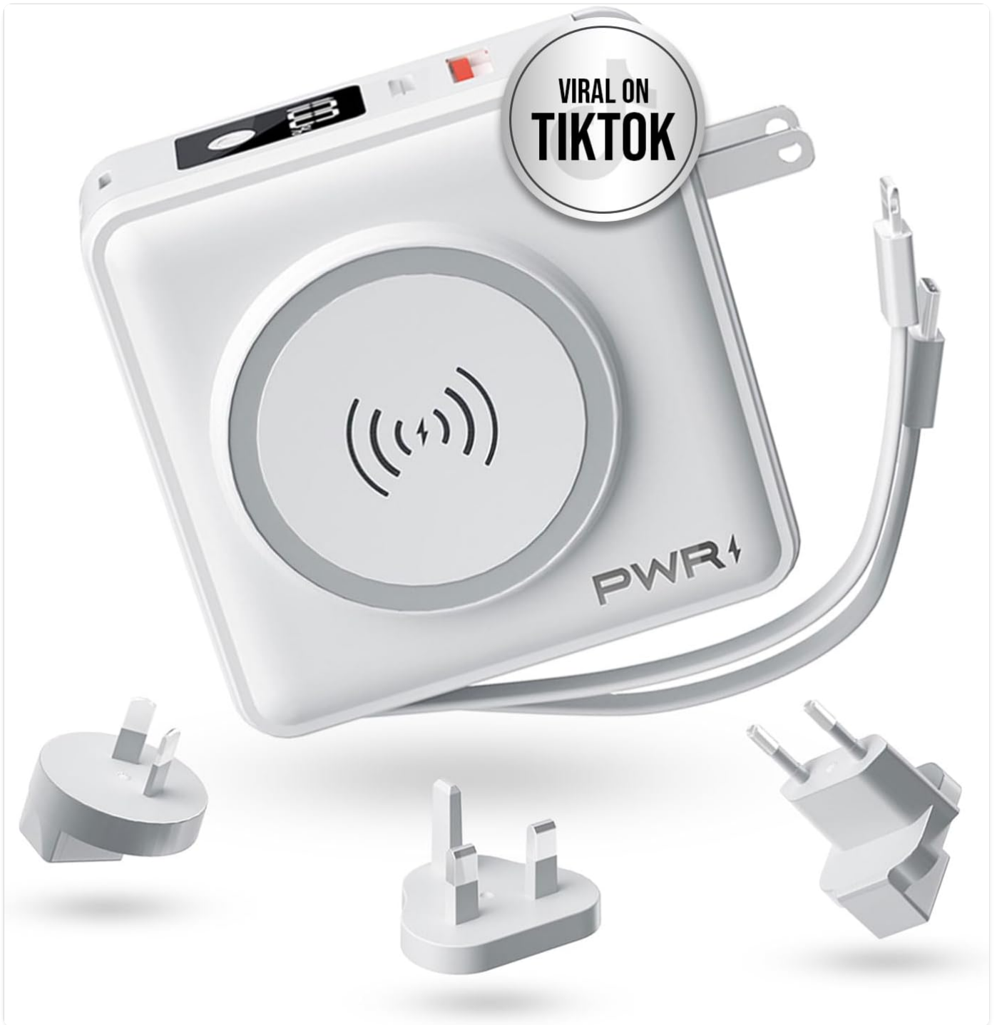
Image: The PWR Travel PRO 5-in-1 Power Bank shown with its built-in US plug and the three interchangeable international adapters (EU, AU, UK/ASIA) for worldwide compatibility.