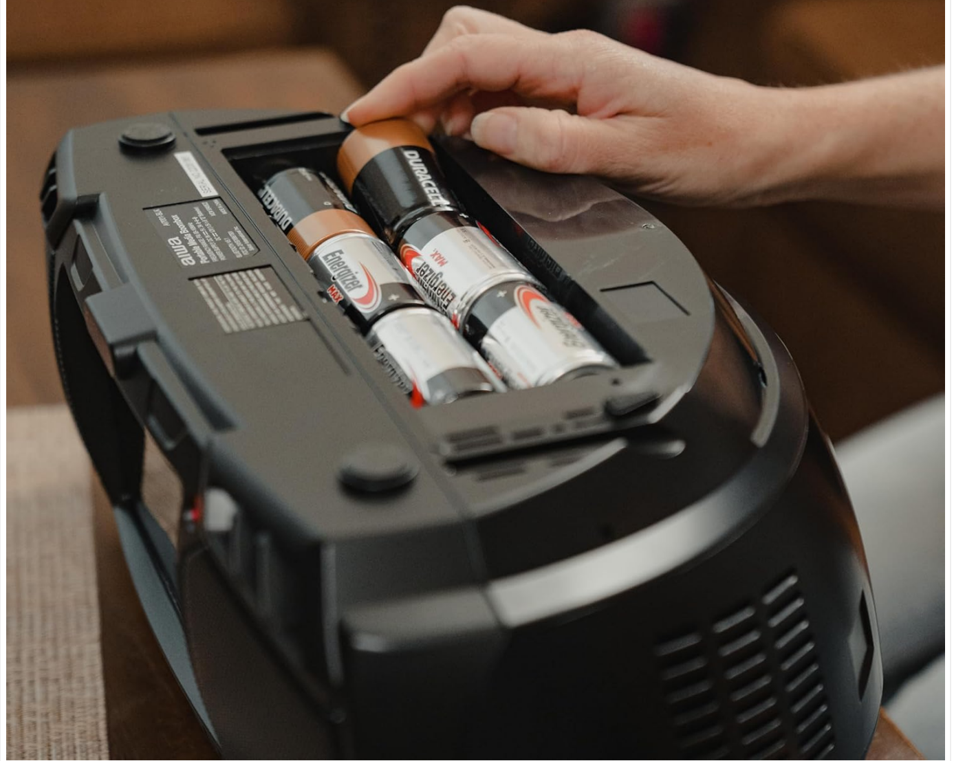
Figure 4: Battery installation.