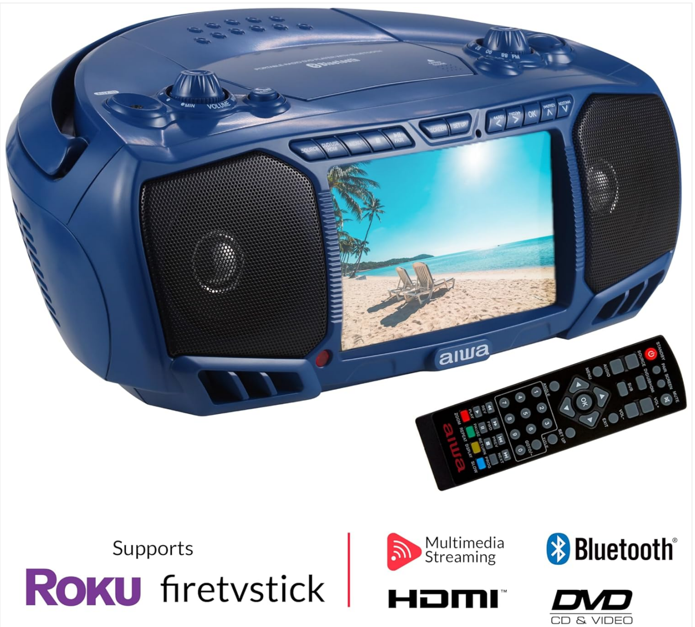
Figure 5: Boombox with remote control.