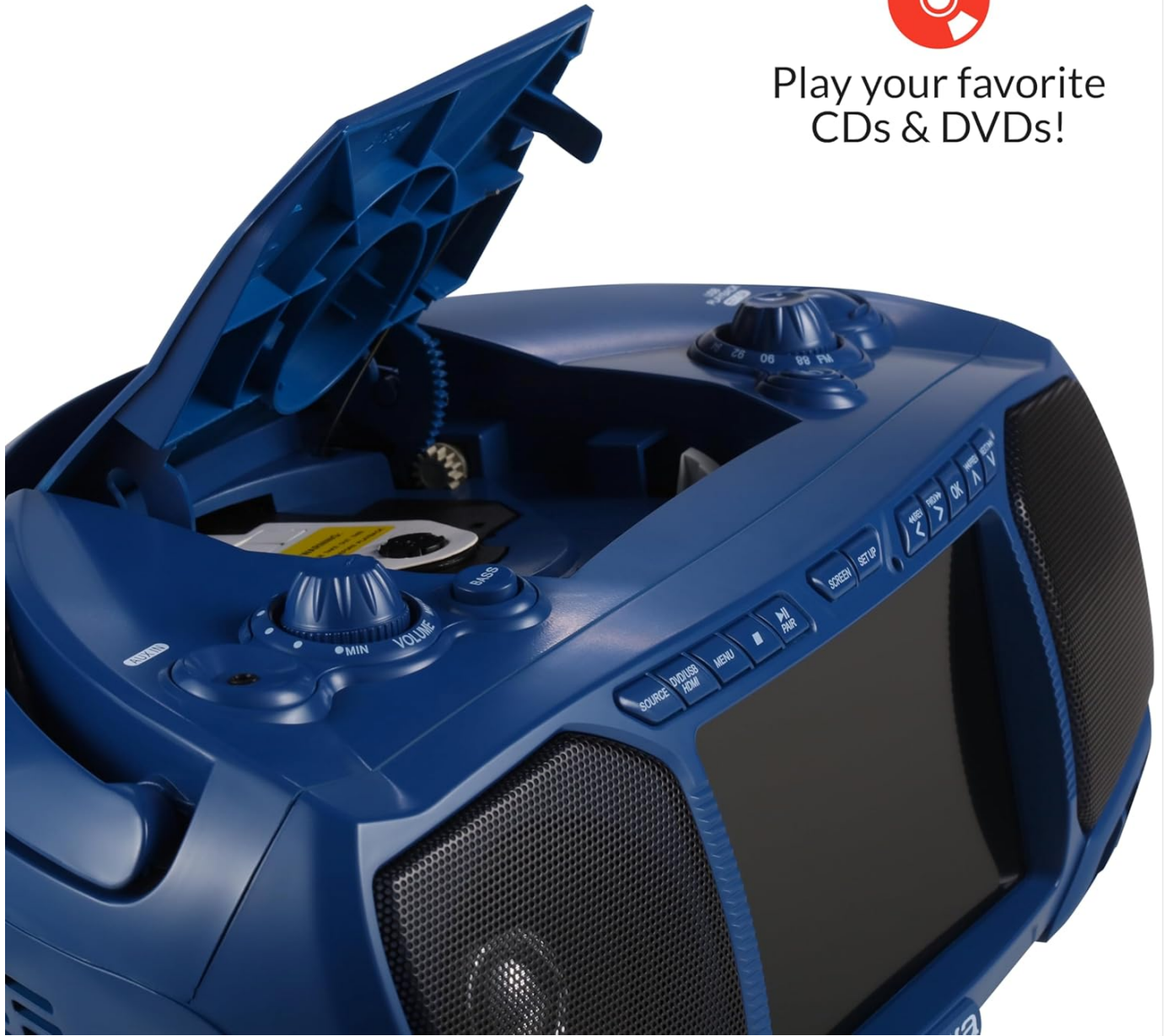
Figure 6: Top-loading CD/DVD player.