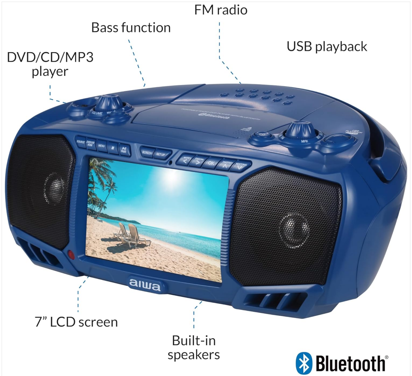
Figure 2: Key features of the Aiwa Portable Boombox.