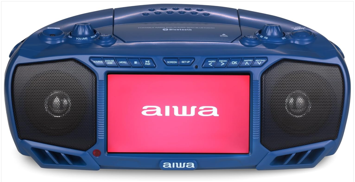
Figure 1: Front view of the Aiwa Portable Boombox.

The Aiwa Portable Boombox is a versatile multimedia device designed for on-the-go entertainment. It features a 7-inch LCD display, Bluetooth connectivity, FM radio, and a CD/DVD player. This manual provides detailed instructions for setting up, operating, and maintaining your boombox.