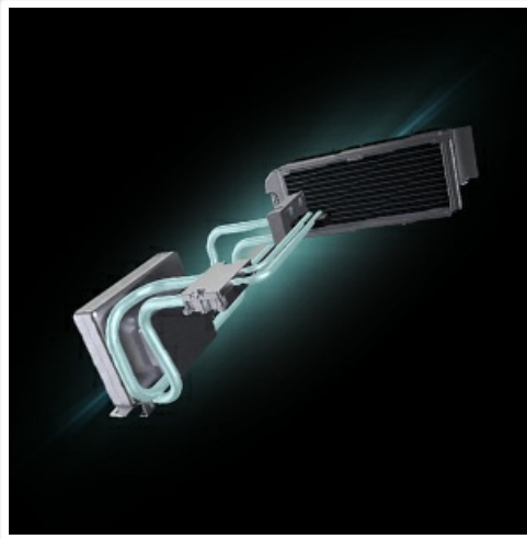
Figure 7.1: Internal view of the liquid cooling system.