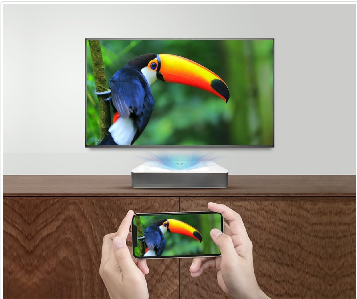
Figure 6.1: Wireless screen mirroring in action.