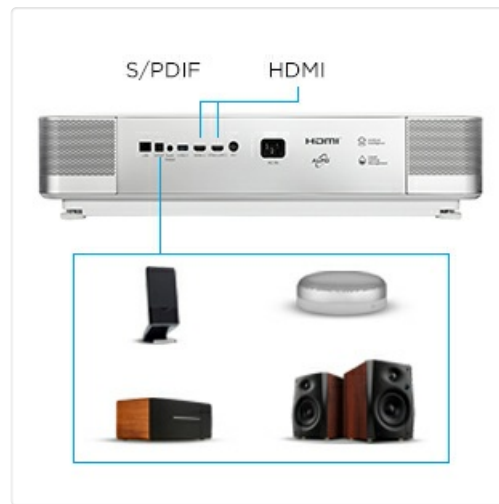
Figure 5.4: External audio connection options.