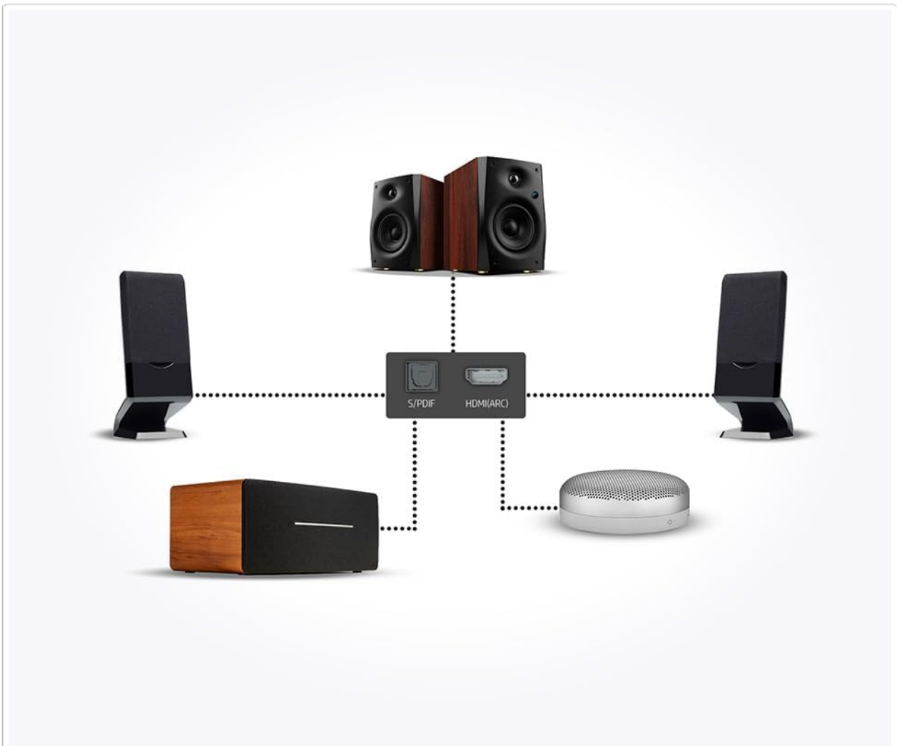
Figure 6.2: Options for connecting external audio systems.