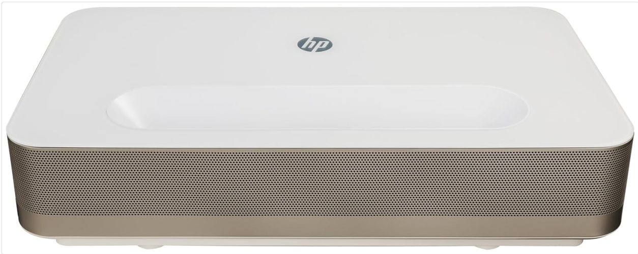
Figure 4.1: Front view of the HP BP5000 PLUS Projector.

The HP BP5000 PLUS features a sleek, minimalist design, typically in a white finish with a metallic grille along the front for the integrated speakers. Its compact form factor allows for discreet placement in any living space.