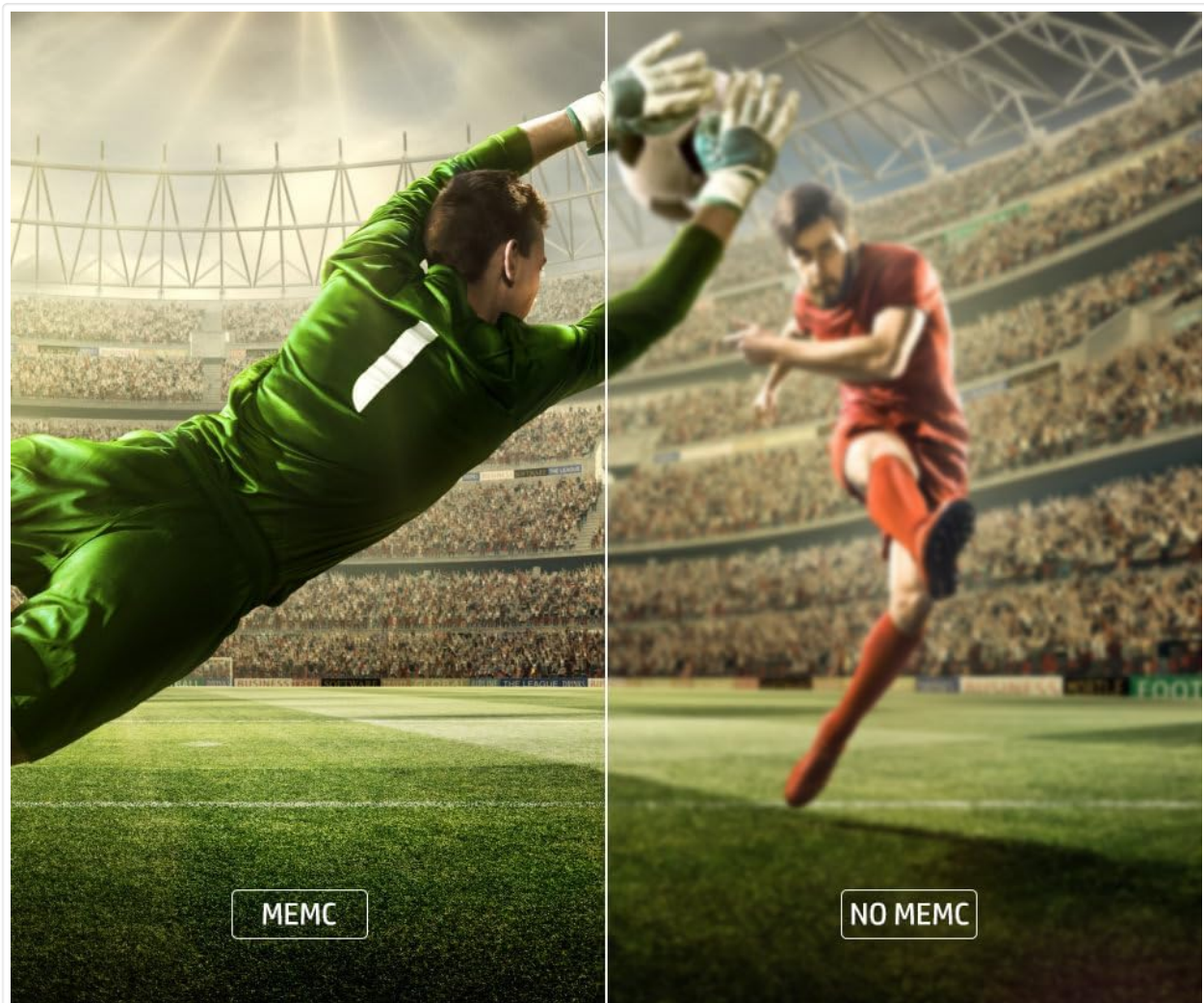
Figure 6.3: Visual comparison of MEMC technology in action.