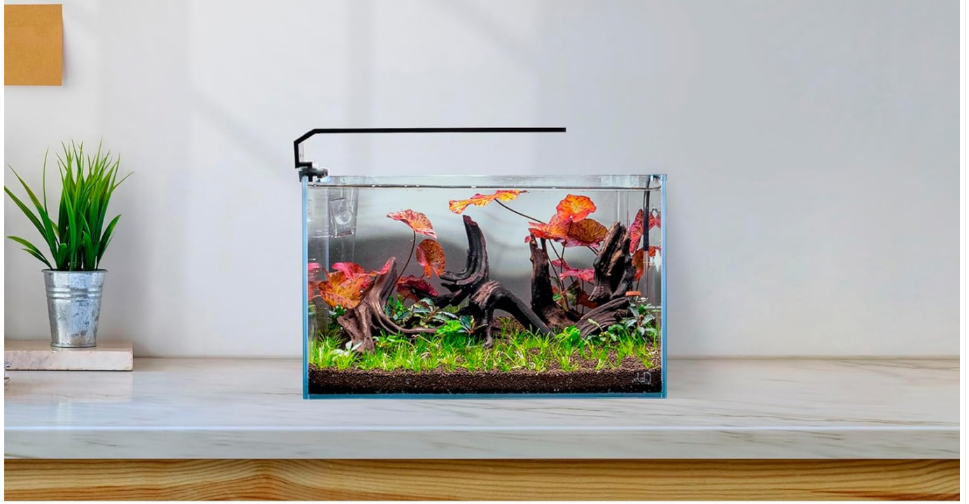
Image: The Chihiros C301 LED Light actively illuminating a planted aquarium, showcasing its effect on the aquatic environment.