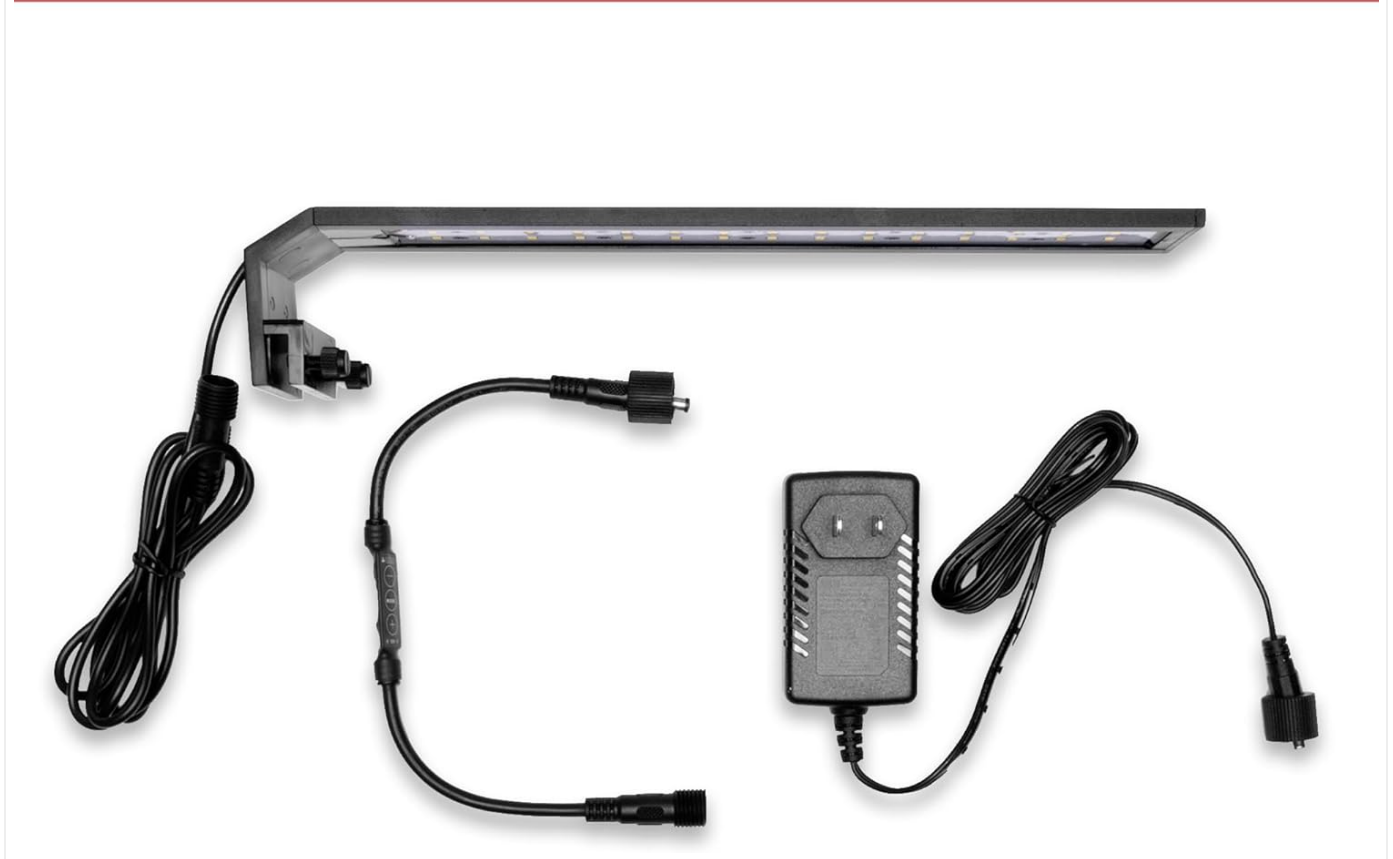
Image: All components included in the Chihiros C301 LED Light package, including the light unit, power adapter, and dimmer cable.