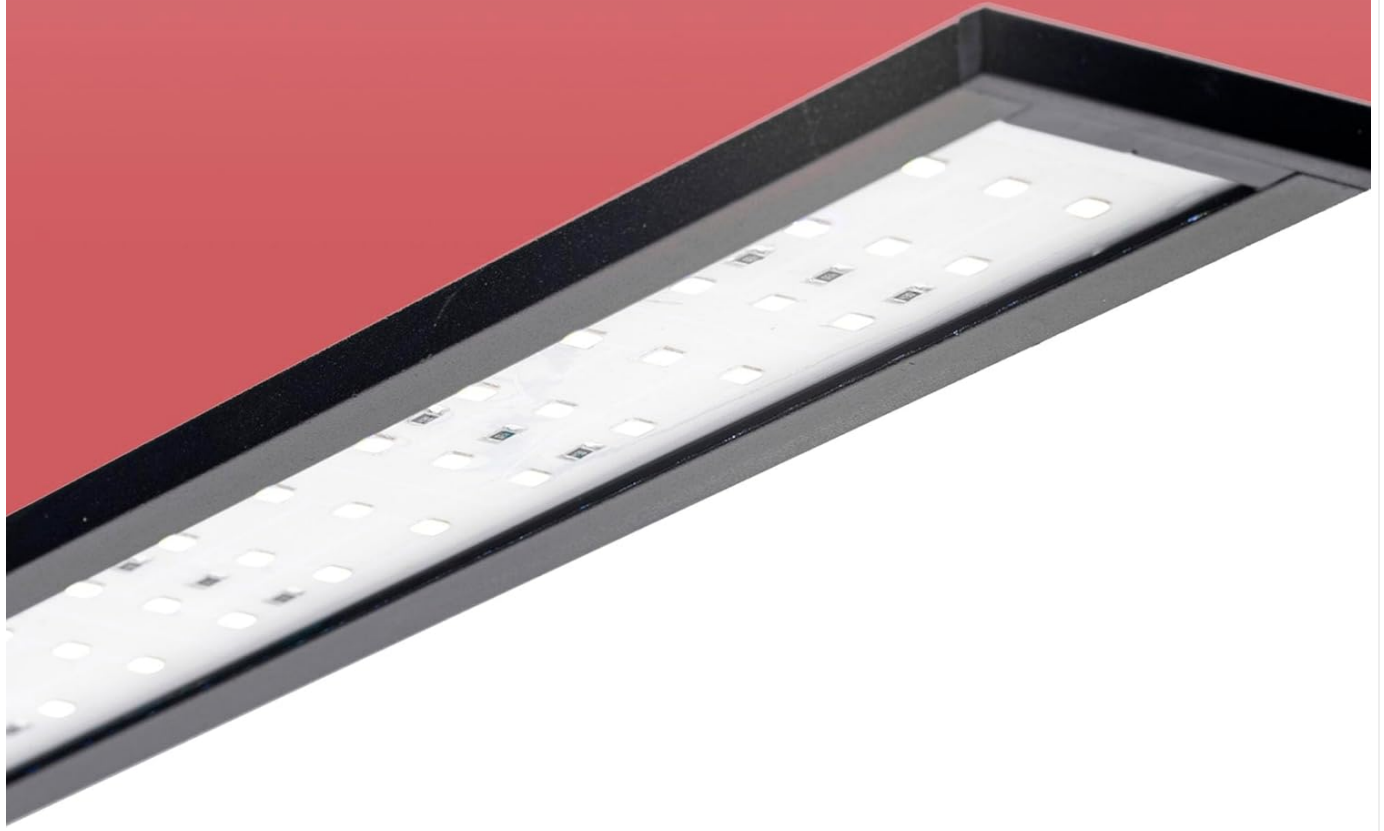
Image: The Chihiros C301 LED Light, showcasing the brand logo and model name.