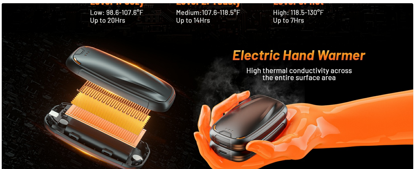
Image: Charging the hand warmer using the Type-C port. The device features a smart chip for safety.