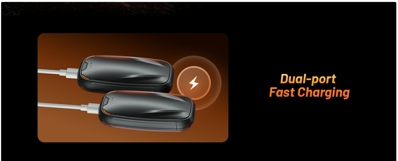
Image: Both hand warmers connected to the dual-port charging cable for simultaneous fast charging.