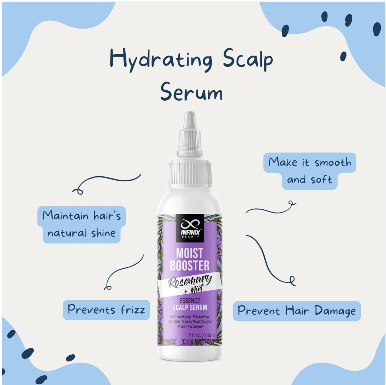
Figure 4: An illustration of the Hydrating Scalp Serum bottle with arrows pointing to its benefits: maintains natural shine, prevents frizz, makes hair smooth and soft, and prevents hair damage.