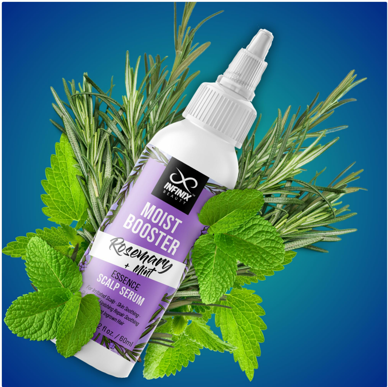
Figure 2: A bottle of Infinix Rosemary Mint Scalp Serum, 2 fl oz / 60 ml, featuring a white bottle with a purple label and green leaf accents.