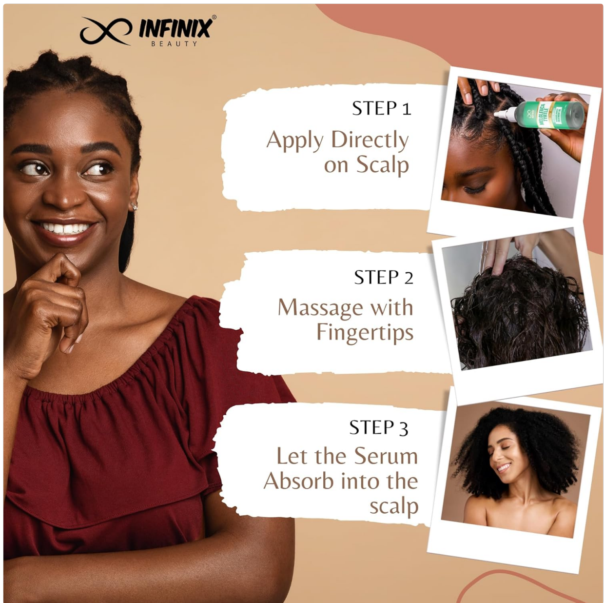
Figure 1: Visual guide demonstrating the three steps for applying the serum: 1. Apply directly on scalp, 2. Massage with fingertips, 3. Let the serum absorb into the scalp.