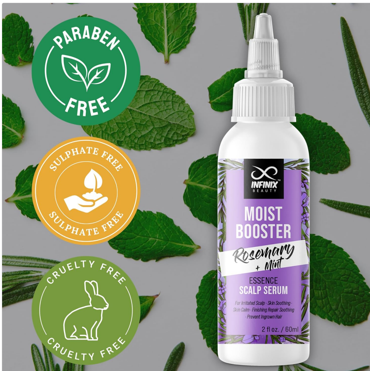
Figure 3: The Infinix Scalp Serum bottle surrounded by fresh mint and rosemary leaves, highlighting its 'Paraben Free', 'Sulphate Free', and 'Cruelty Free' certifications.