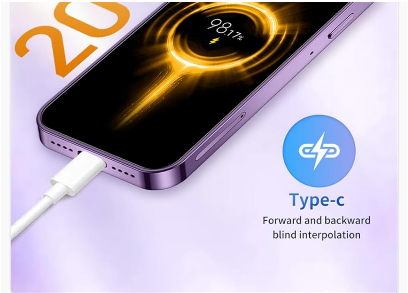
Image: The XS16 Mini Smartphone connected to a Type-C charger, displaying battery charging status.