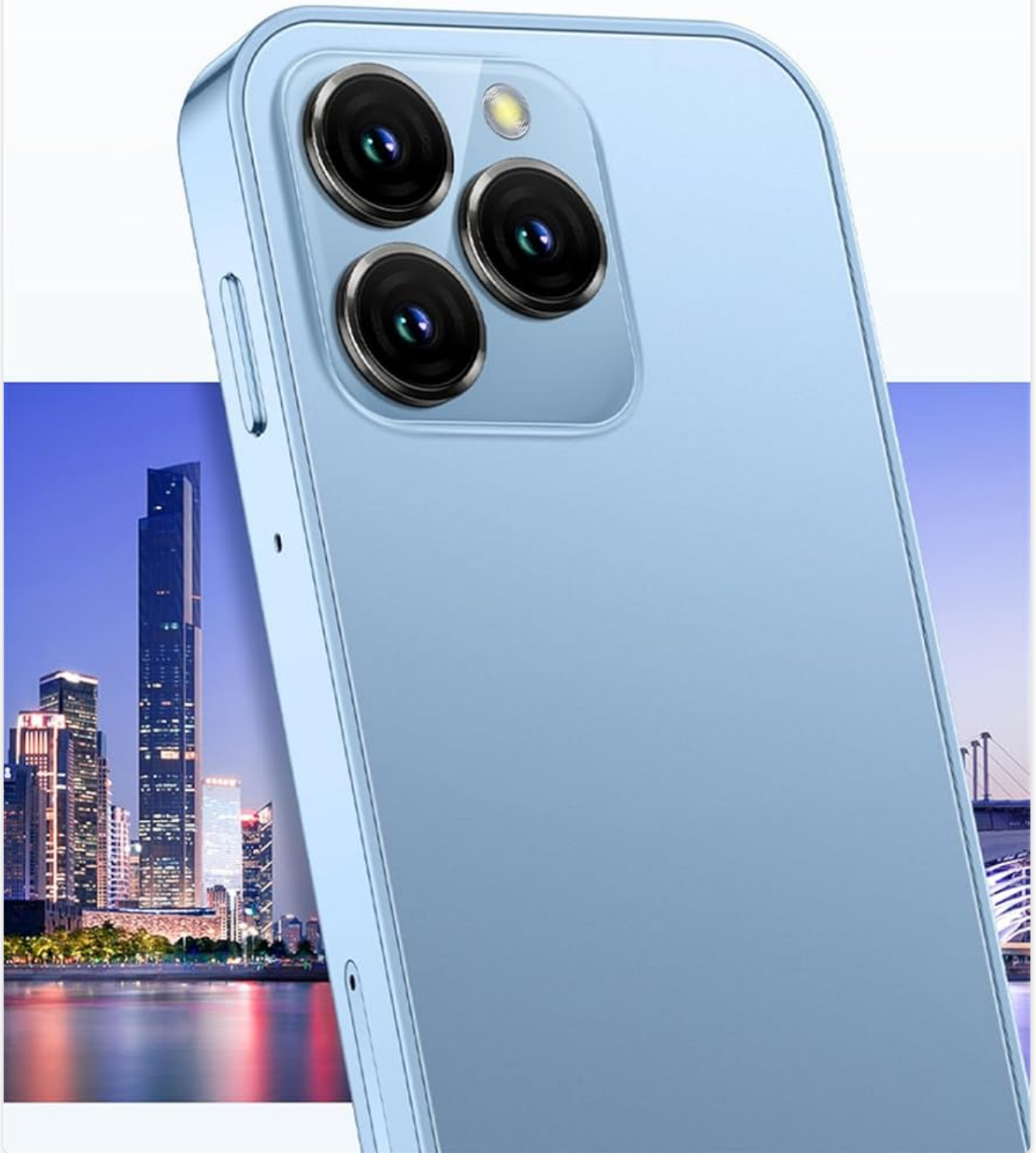
Image: Close-up of the rear camera module on the XS16 Mini Smartphone.