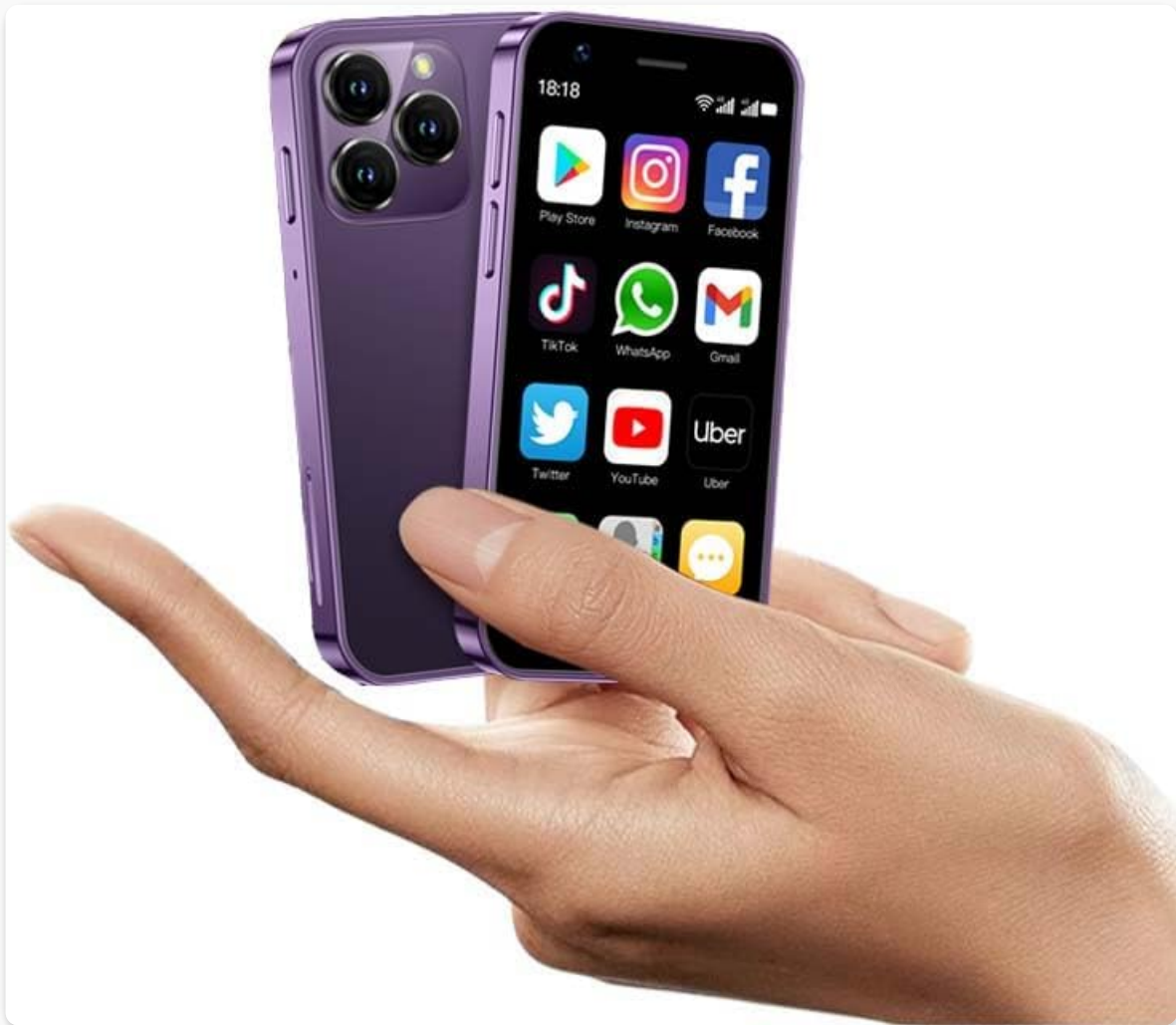
Image: The roiesvry XS16 Mini Smartphone, showcasing its compact size when held in a hand.