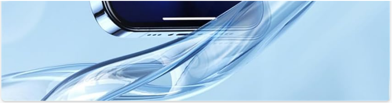
Image: The XS16 Mini Smartphone showcasing its Android 10.0 operating system and compatibility with various applications.