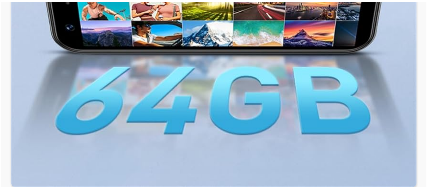
Image: Visual representation of the 64GB storage capacity on the XS16 Mini Smartphone.