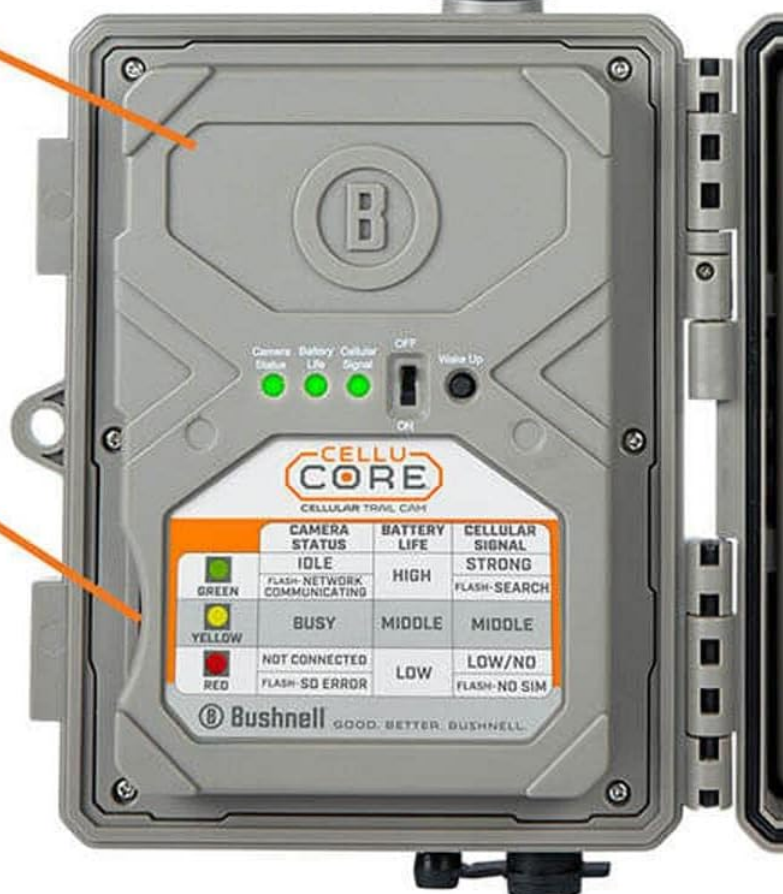
Image: An open view of the camera's interior, highlighting the status indicator lights that provide information on camera, battery, and cellular status.