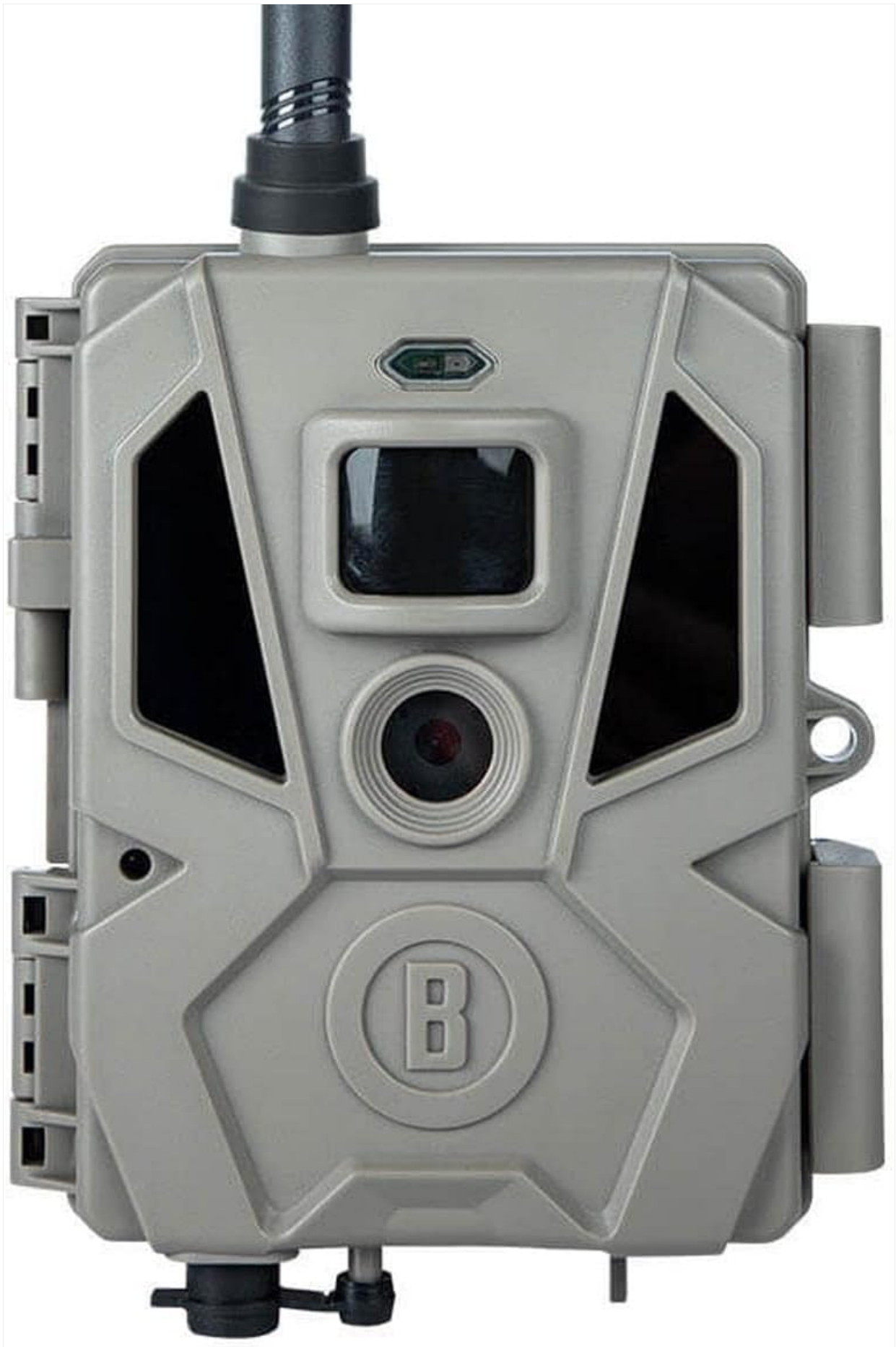
Image: Front view of the Bushnell CelluCORE 20 Trail Camera, showcasing its compact and rugged design.