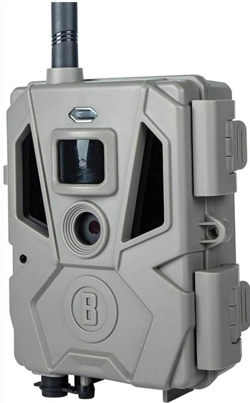
Image: The Bushnell CelluCORE 20 Trail Camera with key features such as night range, LED type, trigger speed, image resolution, and solar compatibility labeled.